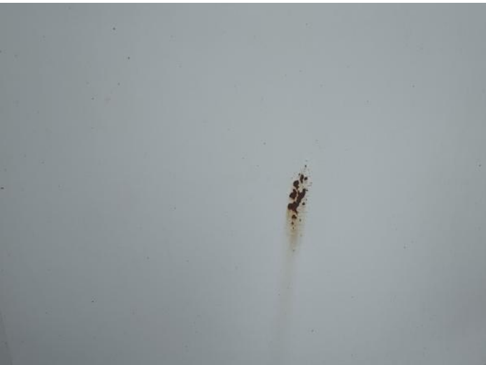
6: Qtr Panel osr Rusted Over 5mm