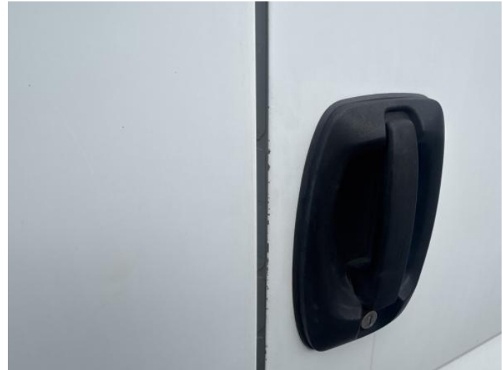
1: Door osf Chipped Multiple Chips