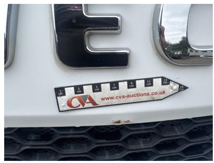
3: Bonnet Rusted Over 5mm