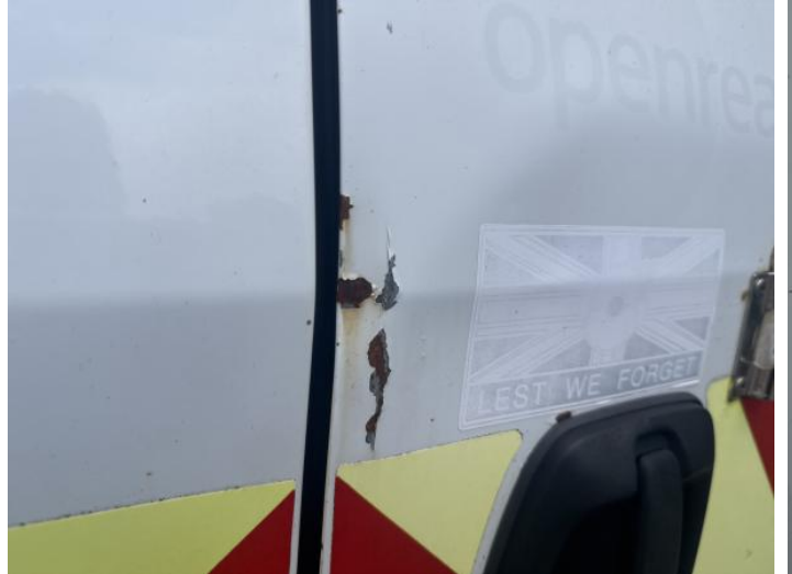
5: Door osr Dented With Paint Damage