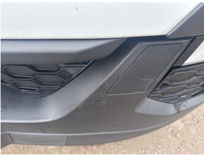
4: Bumper Front Moulding Scuffed (Unpainted) Over 100mm