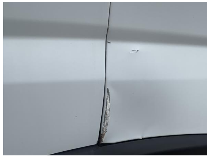
2: Wing osf Dented With Paint Damage