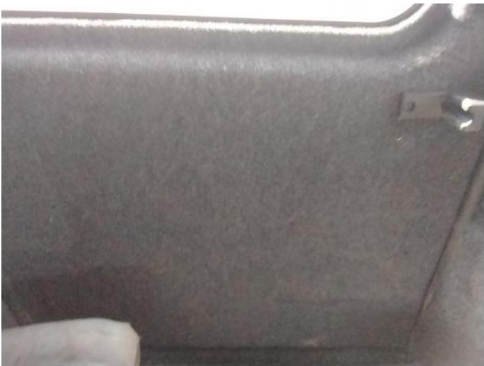
1: Door Pad nsr Broken Replace