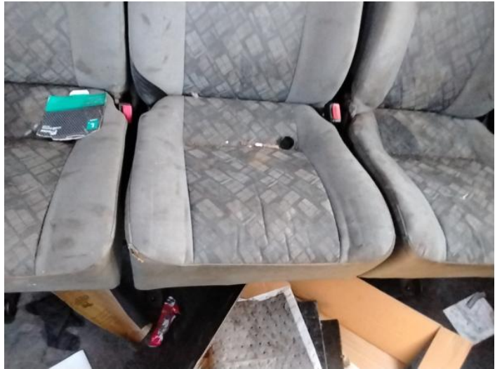
4: Seat Back Cover nr Soiled Heavy