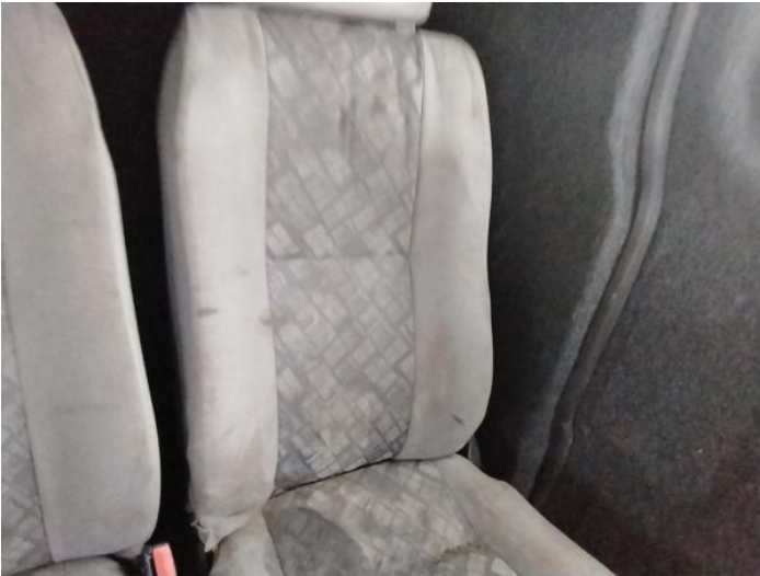
3: Seat Back Cover nr Soiled Heavy