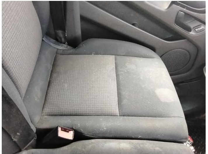
12: Seat Base Cover nsf Soiled Heavy