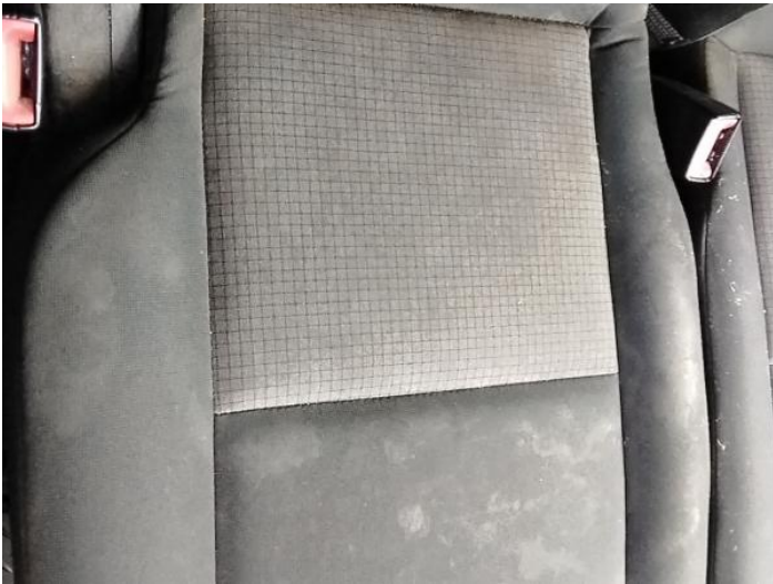
11: Seat Base Cover nsf Soiled Heavy