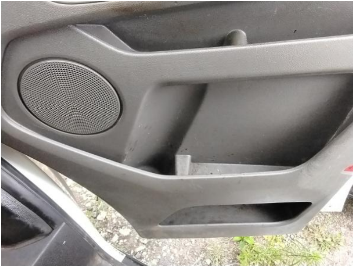
9: Door Pad osf Scuffed Over 25mm