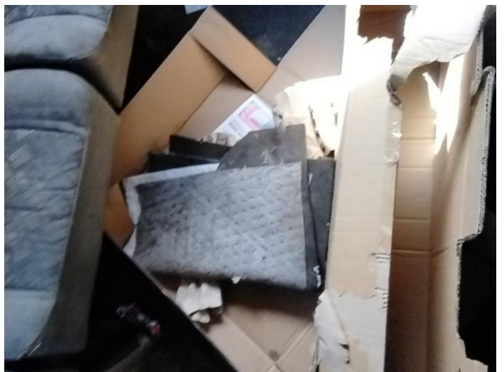
8: Carpets Rear Soiled Heavy