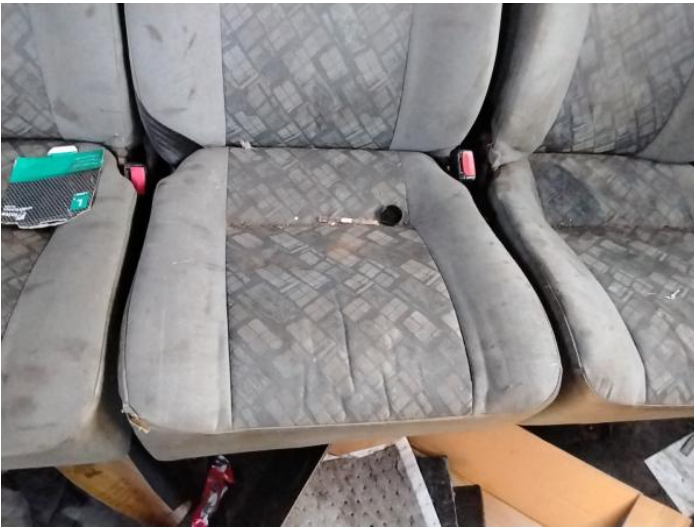
5: Seat Base Cover nr Soiled Heavy