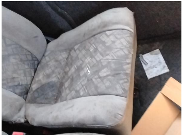
2: Seat Base Cover nsr Soiled Heavy