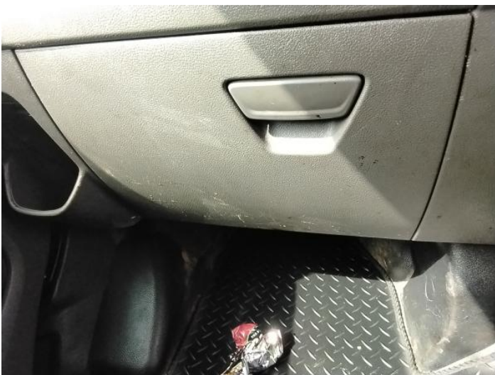
13: Fascia Panel Scuffed Over 25mm