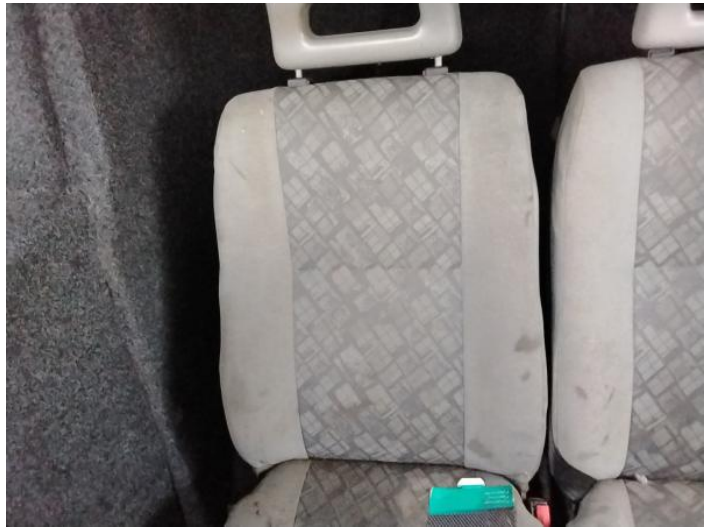
6: Seat Back Cover osr Soiled Heavy