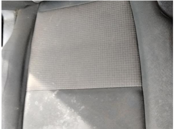
10: Seat Base Cover osf Soiled Heavy