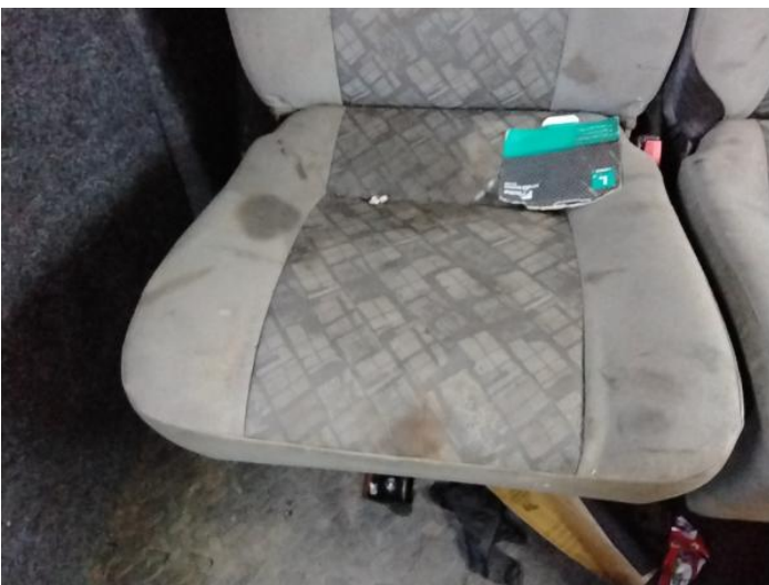
7: Seat Base Cover osr Soiled Heavy