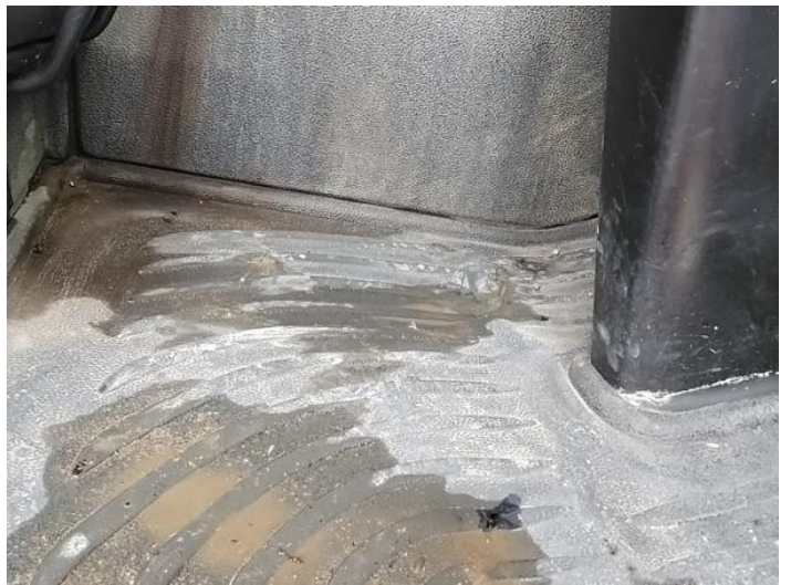
18: Carpets Front Holed Over 3mm