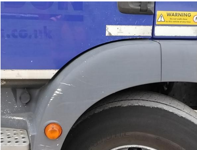
11: Other N/A N/A