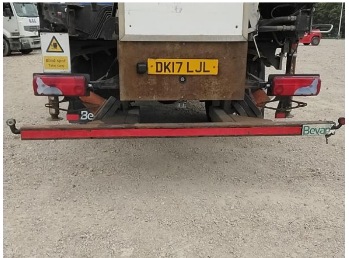
12: Bumper Rear Rusted Over 5mm