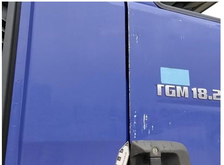
16: Door osf Chipped Edge Chip