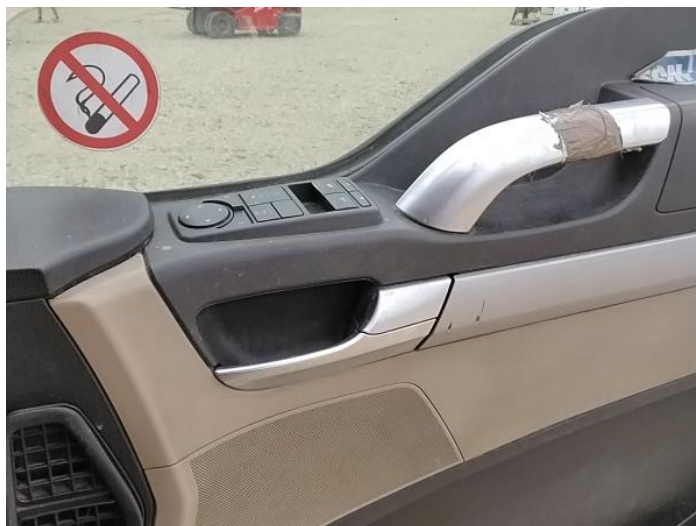
22: Handle Inner osf Damaged Replace