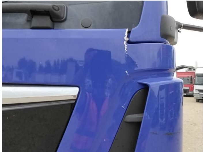
4: Bonnet Cracked Replace