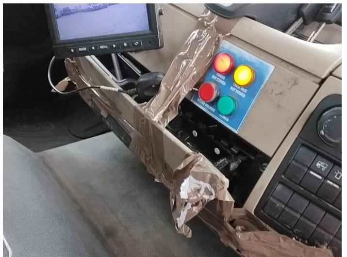
20: Centre Console Front Broken Replace