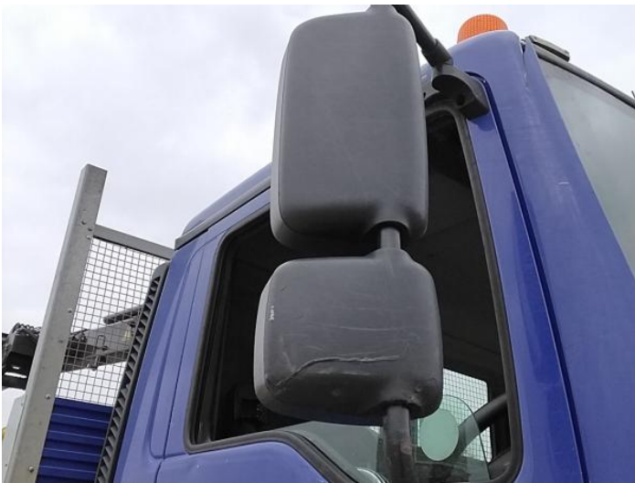
17: Door Mirror Assy osf Scuffed (Unpainted) UpTo 100mm