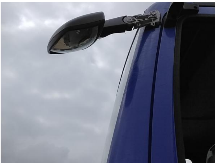
7: Door Mirror Assy nsf Missing Replace