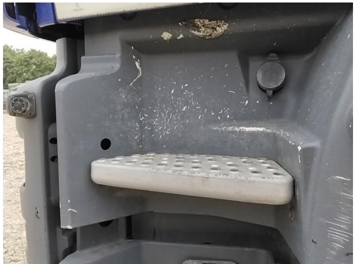
10: Other N/A N/A