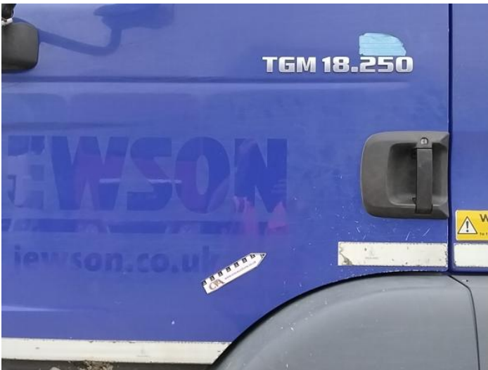
9: Door nsf Scratched Over 25mm Thru Paint