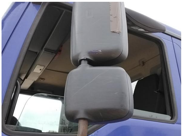
8: Door Mirror Assy nsf Scuffed (Unpainted) Over 100mm