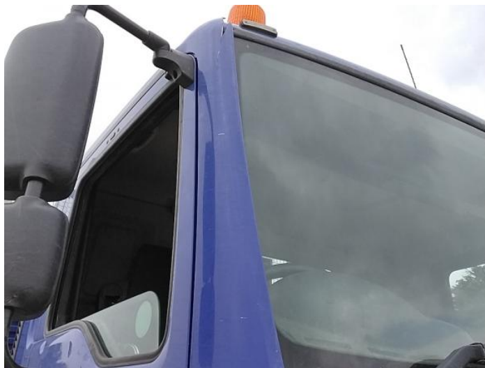
2: A Post os Cracked Replace