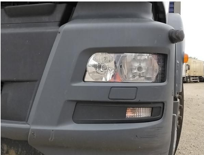
5: Fog Lamp Surround ns Scuffed (Unpainted) Over 100mm