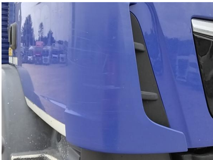
1: Wing osf Scratched Over 25mm Not Thru Paint