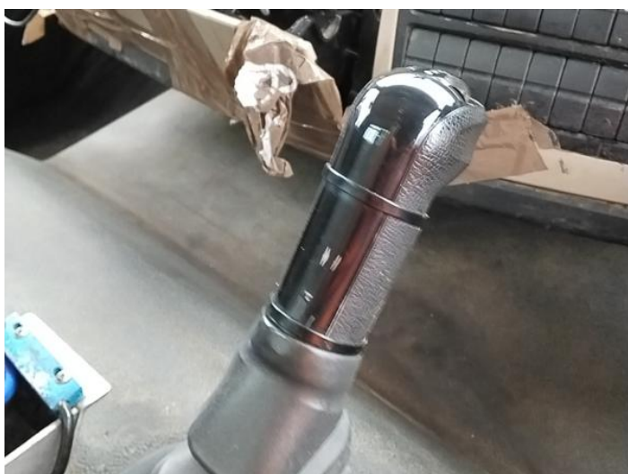
23: Other N/A N/A