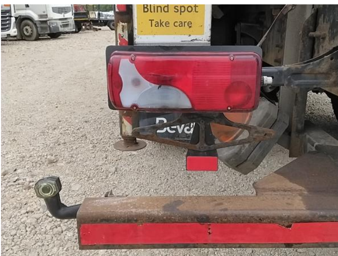
13: Lamp nsr Broken Replace