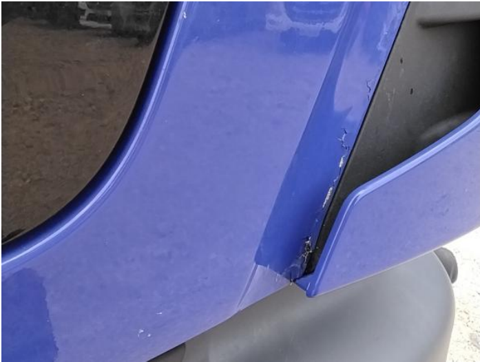
3: Bonnet Cracked Replace