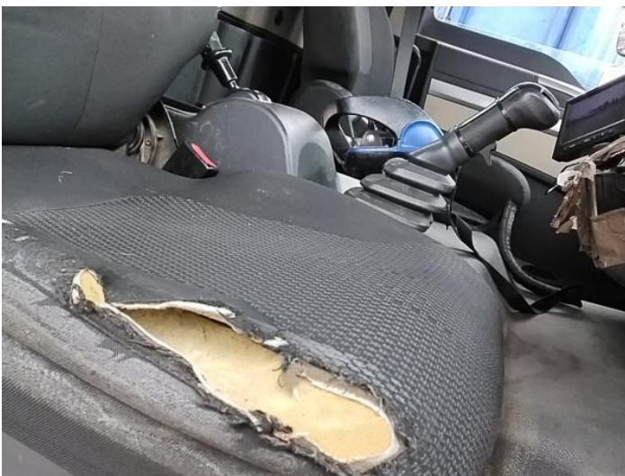
19: Seat Base Cover osf Holed Over 3mm