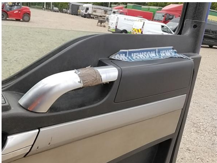
21: Door Pad osf Broken Replace