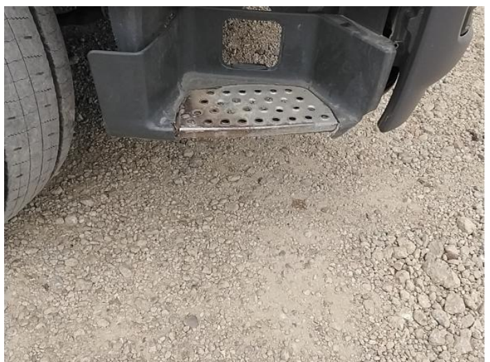
14: Other N/A N/A