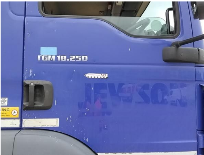
15: Door osf Dented Over 2 UpTo 10mm