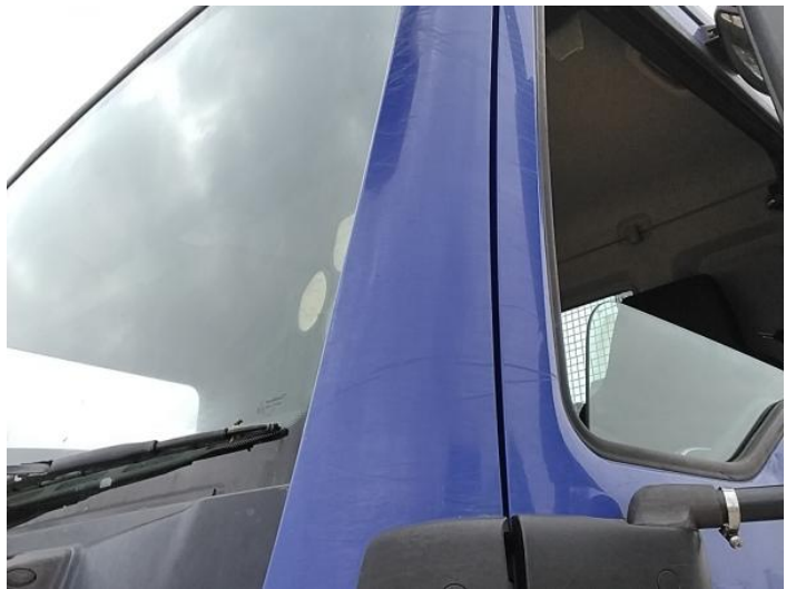
6: A Post ns Scratched Over 25mm Not Thru Paint