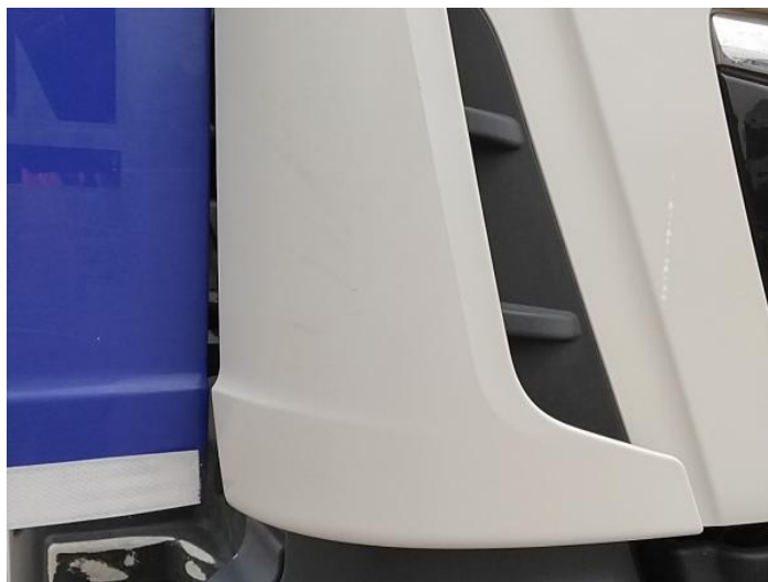
2: Wing is Scratched Up To 25mm Not Thru Paint