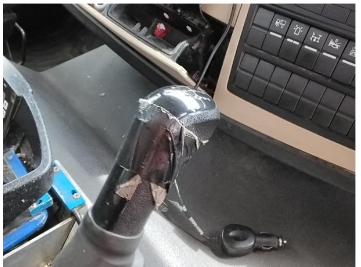
20: Other N/A N/A