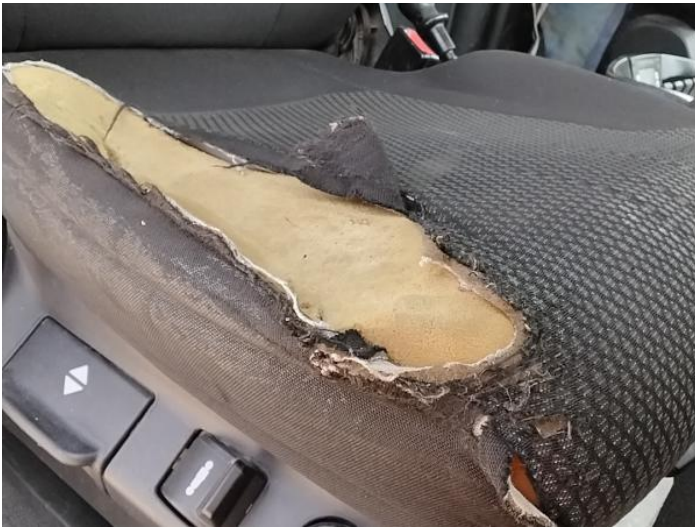
17: Seat Base Cover osf Torn Over 3mm