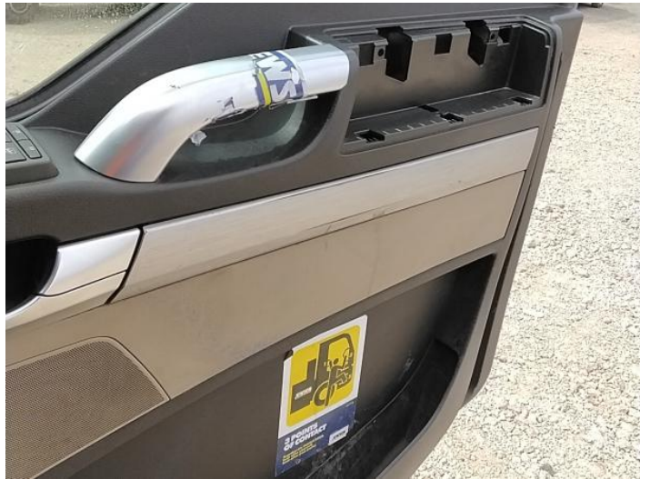
18: Door Pad osf Missing Replace