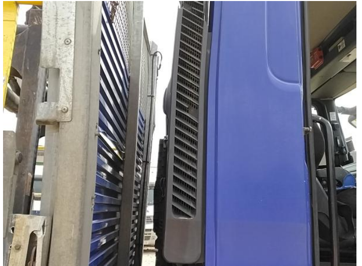
16: Other N/A N/A