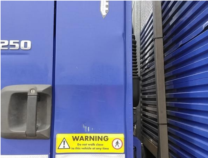
9: B Post ns Dented With Paint Damage