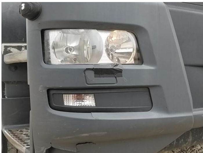
1: Fog Lamp Surround is Broken Replace