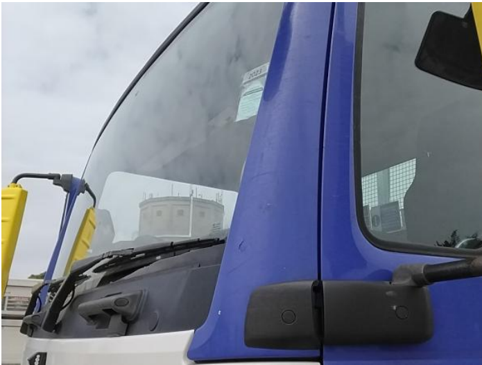
5: A Post ns Cracked Replace