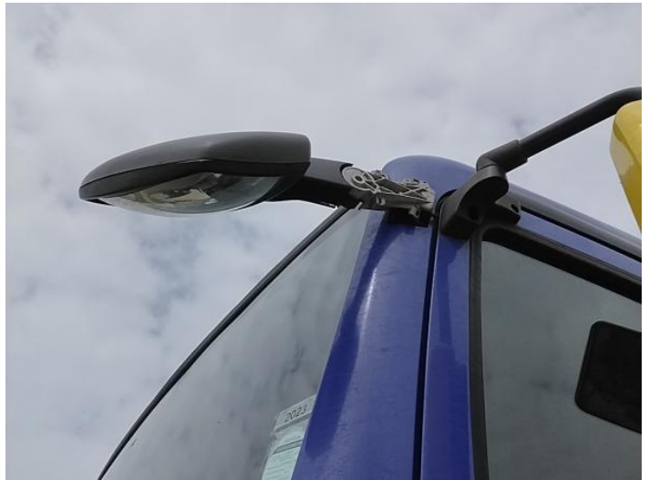
6: Door Mirror Assy nsf Missing Replace