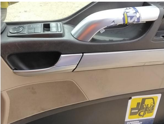
19: Handle Inner osf Damaged Replace