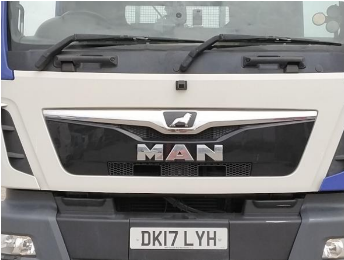
3: Bonnet Scratched UpTo 25mm Not Thru Paint