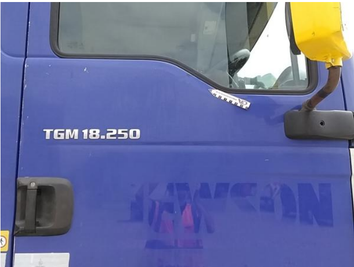
14: Door osf Dented 2 Or Less UpTo 10mm