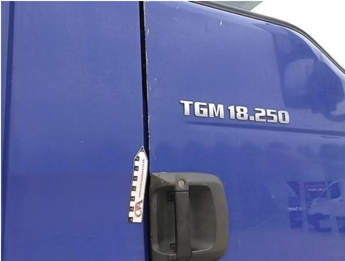
15: Door osf Chipped Edge Chip