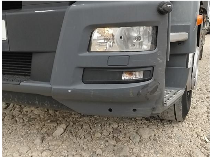
4: Fog Lamp Surround ns Scuffed (Unpainted) Over 100mm