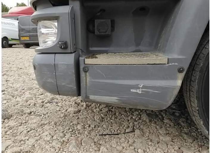
6: Other N/A N/A