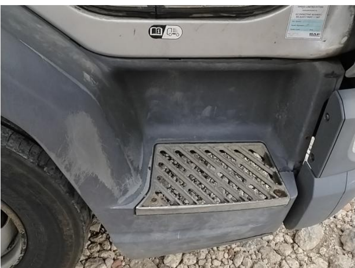
12: Other N/A N/A