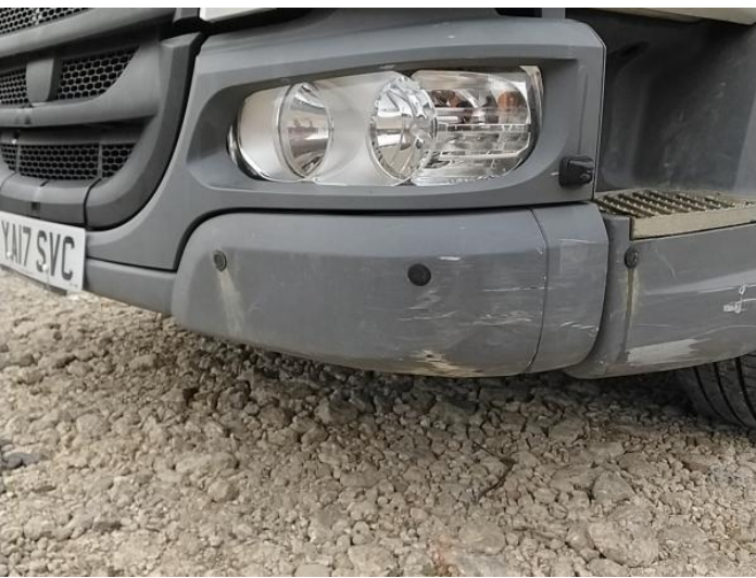
4: Bumper Front Moulding Scratched (Painted) Over 25mm Thru Paint