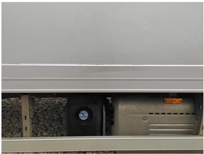
10: Qtr Panel osr Dented Between 10mm + 30mm