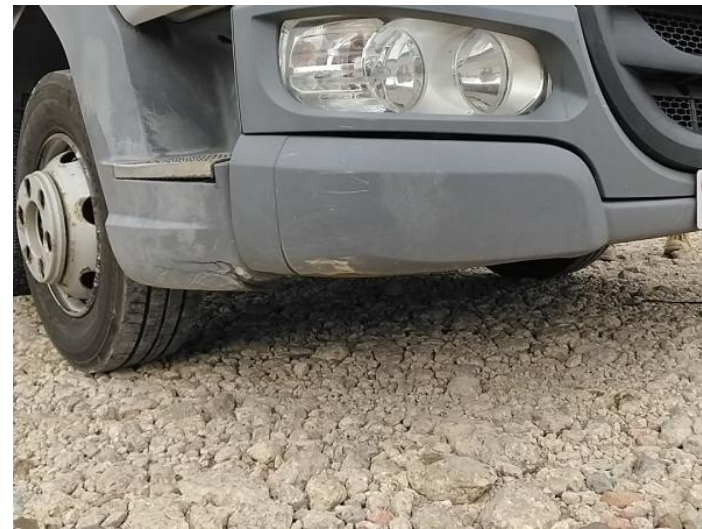
1: Bumper Front Moulding Scratched (Painted) Over 25mm Thru Paint