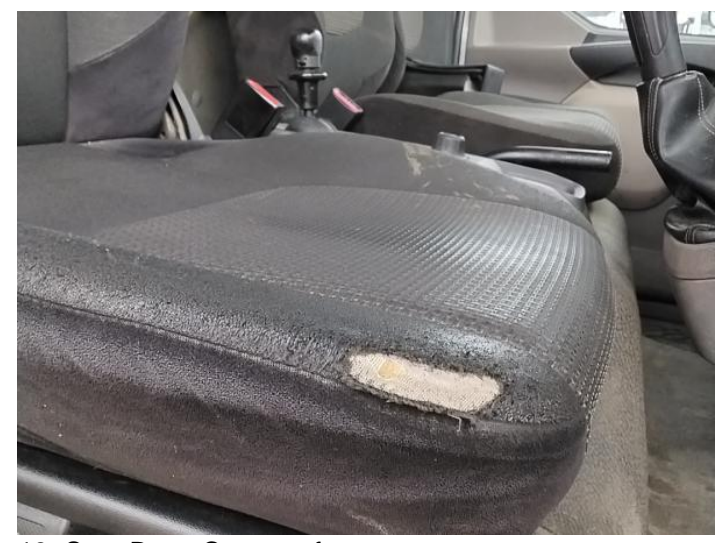
13: Seat Base Cover osf Holed Over 3mm