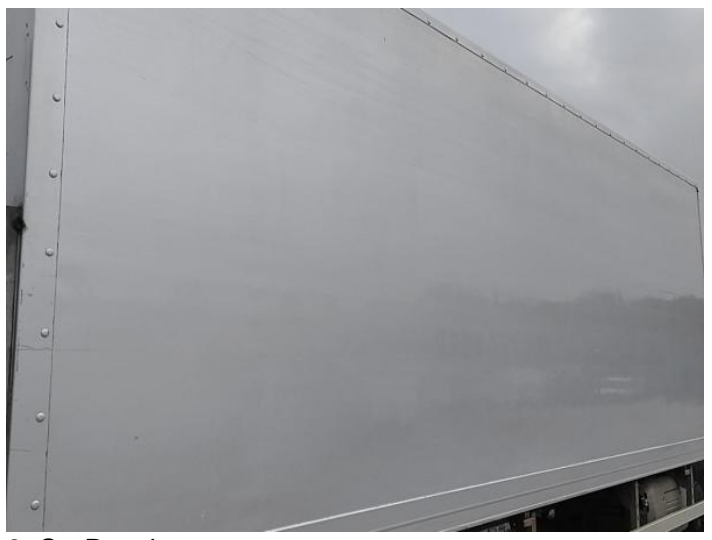
9: Qtr Panel osr Scratched Over 25mm Thru Paint