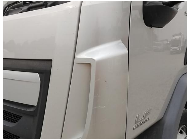
5: Wing nsf Scratched Over 25mm Thru Paint