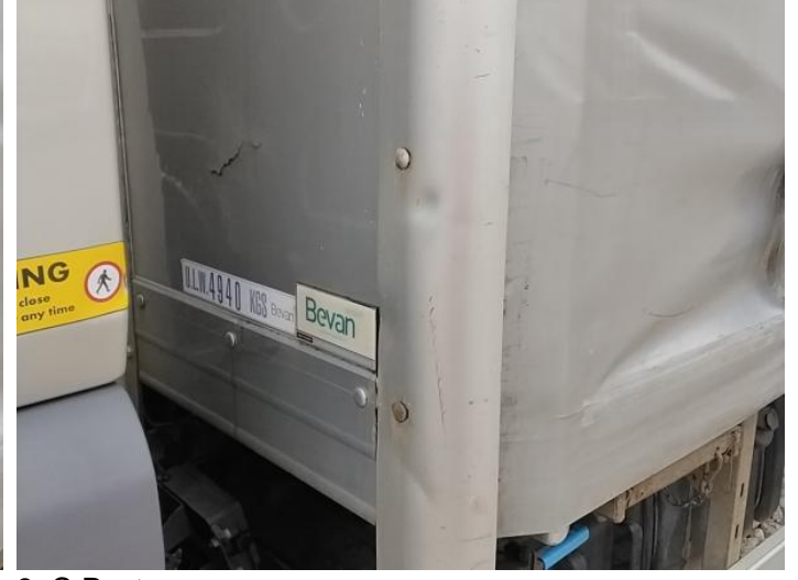
8: C Post ns Dented Between 10mm + 30mm