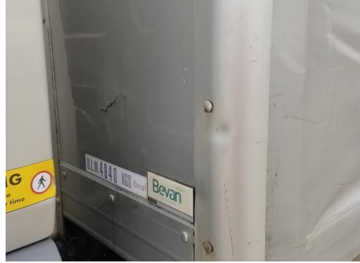
7: Other N/A N/A