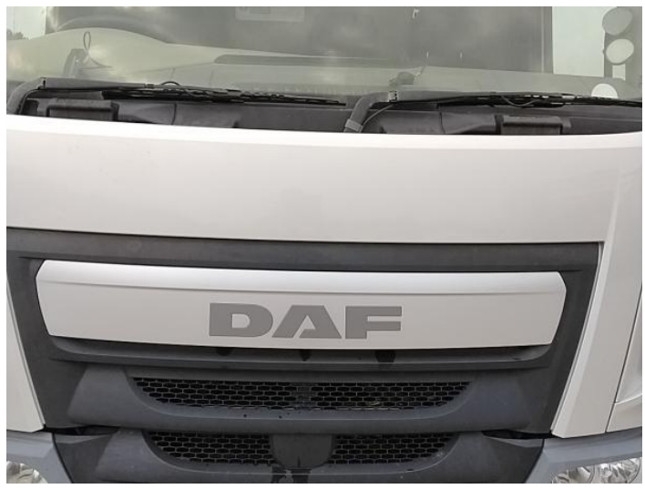
3: Bonnet Chipped Multiple Chips