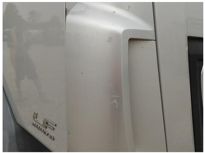
2: Wing osf Chipped Multiple Chips