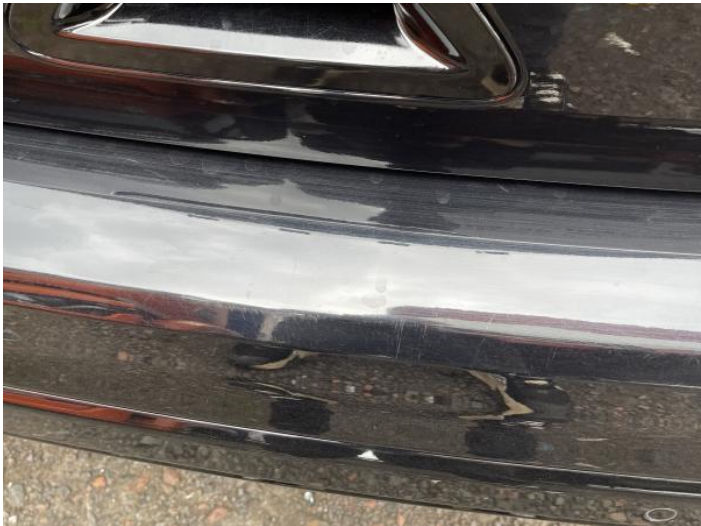
2: Bumper Rear Scratched Up To 25mm Not Thru Paint