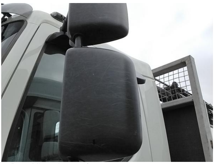
5: Door Mirror Assy nsf Scuffed (Unpainted) UpTo 100mm