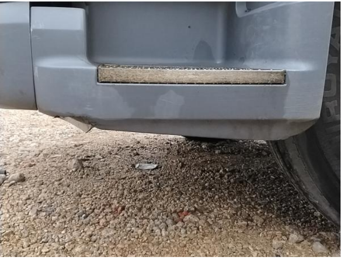
3: Bumper Front Chipped Multiple Chips