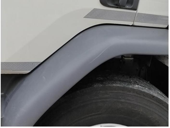
6: Other N/A N/A