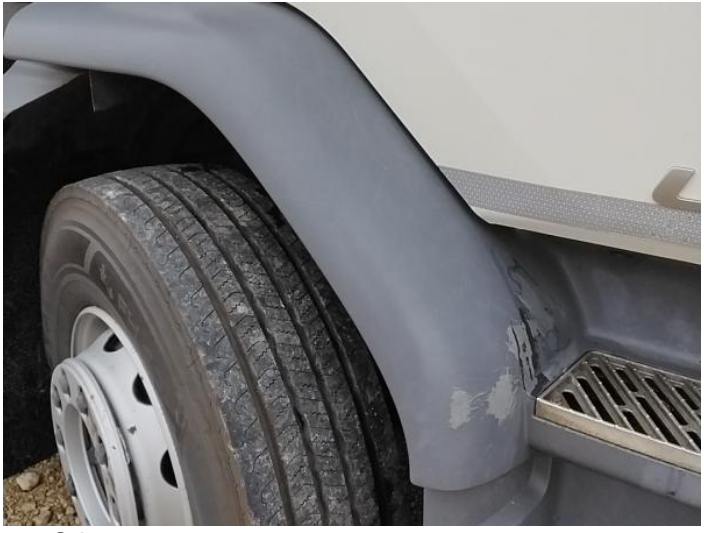
9: Door osf Chipped Edge Chip