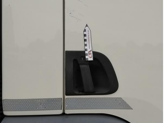
8: Door osf Scratched Over 25mm Thru Paint