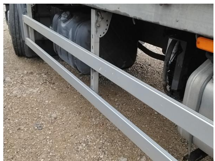
7: Other N/A N/A