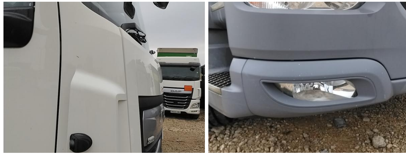
1: Wing osf Scratched UpTo 25mm Thru Paint