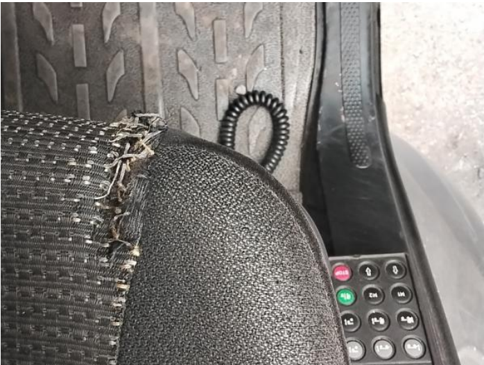
1: Seat Base Cover osf Torn Over 3mm