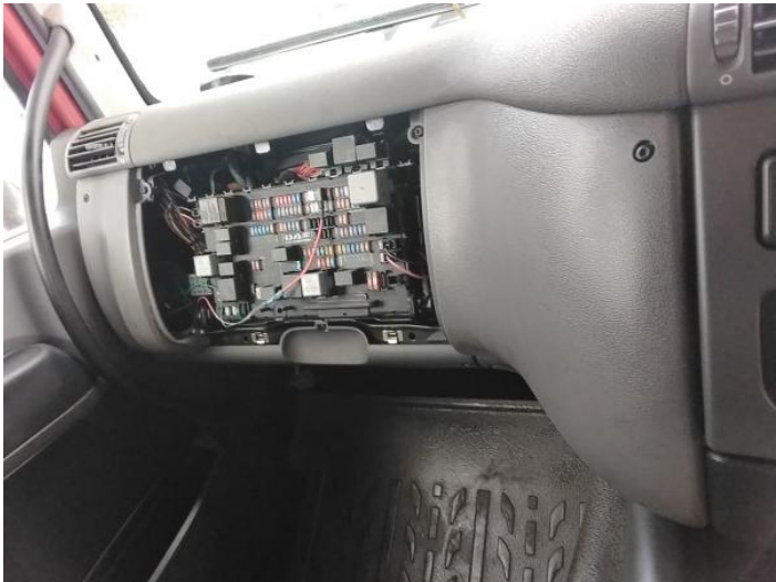
2: Fascia Panel Missing Replace