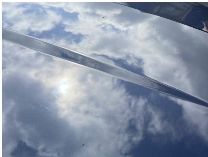
2: Bonnet Dented Over 2 UpTo 10mm