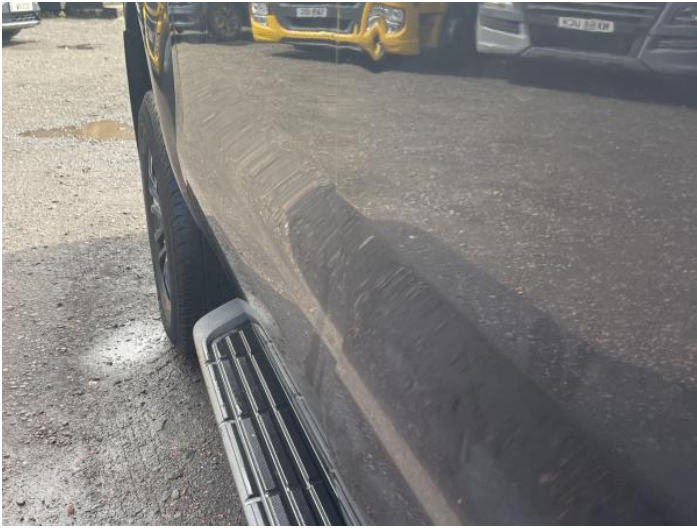
3: Door osf Dented Over 2 UpTo 10mm