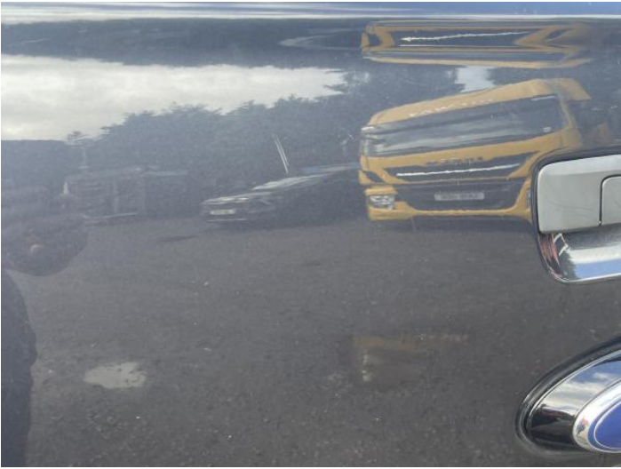
4: Tailgate Scratched UpTo 25mm Not Thru Paint