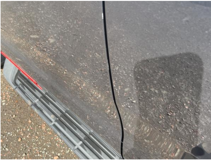
5: Door nsf Chipped Edge Chip