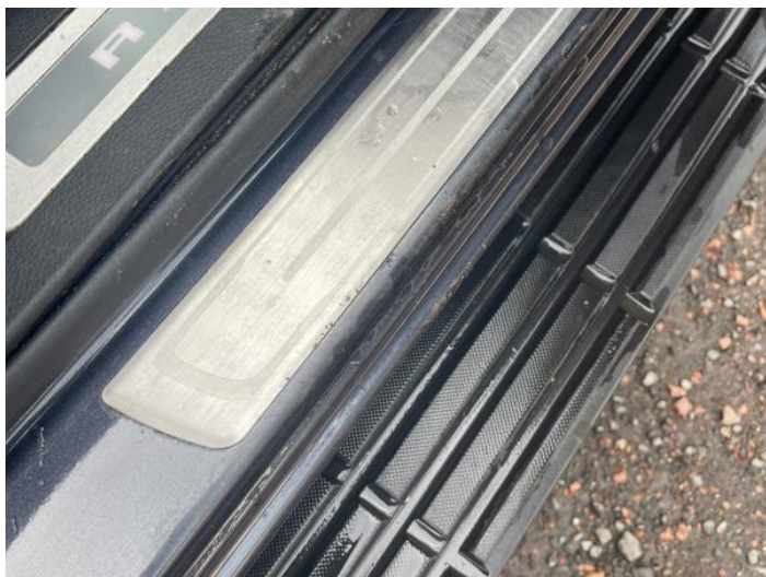
1: Sill os Scratched UpTo 25mm Not Thru Paint