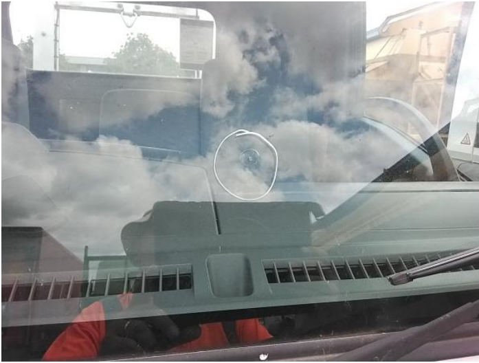
3: Screen Front Chipped Over 10mm