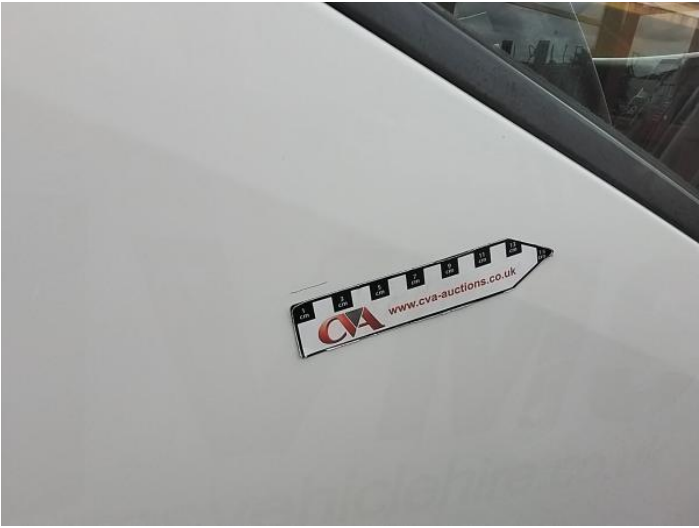
4: Door osf Scratched Over 25mm Thru Paint