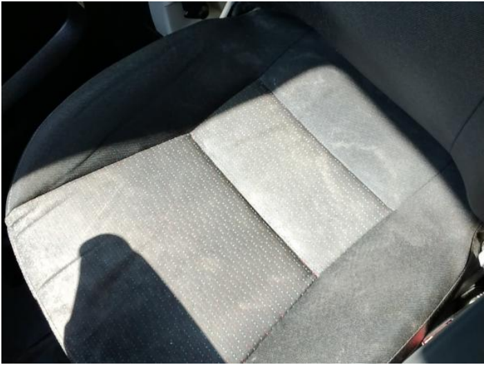
27: Seat Base Cover nsf Soiled Light