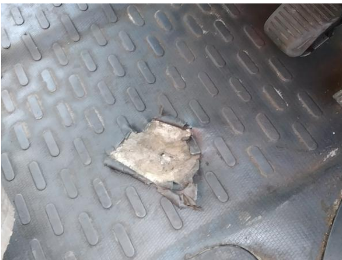
25: Carpets Front Holed Over 3mm