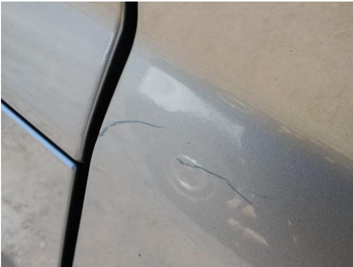
23: Panel Front Scratched Over 25mm Not Thru Paint