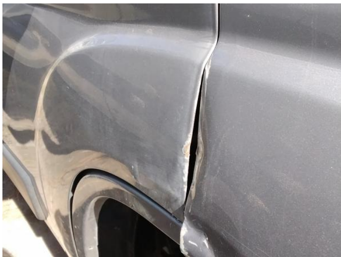
1: Wing nsf Dented With Paint Damage