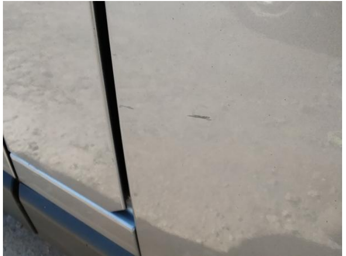
22: Panel Front Scratched Over 25mm Not Thru Paint