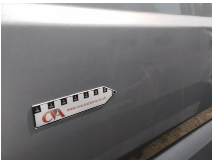
7: Panel Front Scratched Over 25mm Not Thru Paint