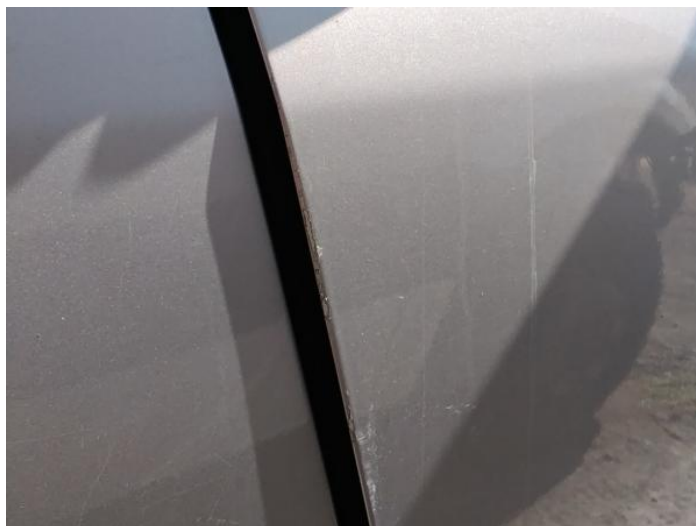
4: Door nsf Chipped Edge Chip