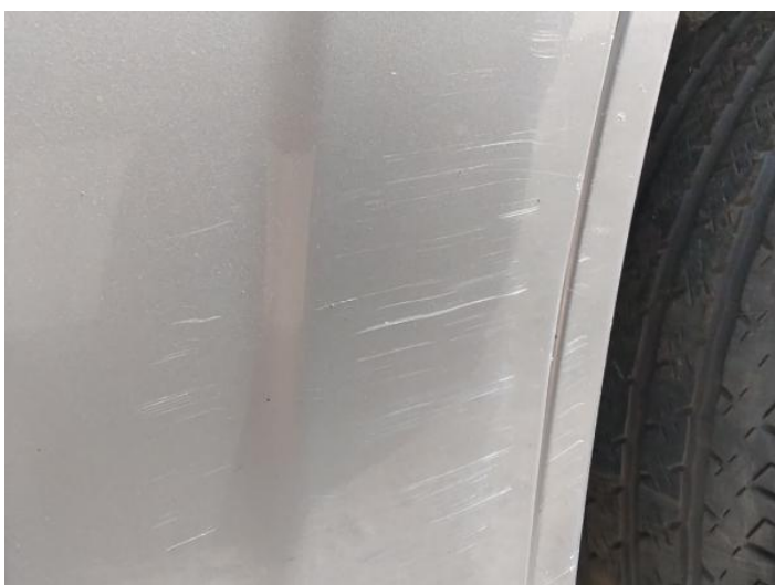
5: Door nsf Scratched Over 25mm Not Thru Paint