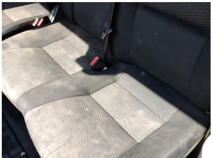
26: Seat Base Cover osf Soiled Light