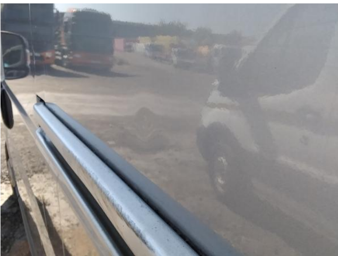
19: Panel Rear Dented Over 30mm