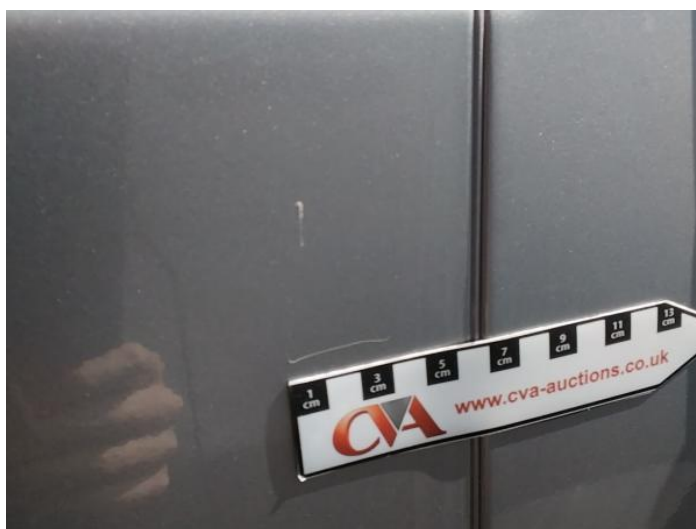
6: Panel Front Scratched Over 25mm Not Thru Paint