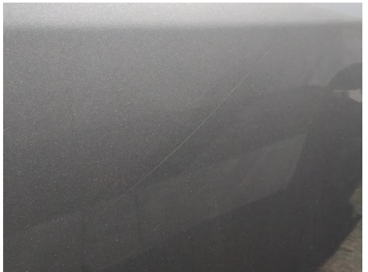
12: Panel Front Scratched Over 25mm Not Thru Paint