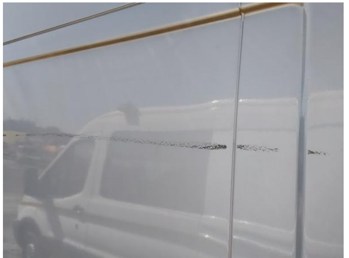
18: Panel Rear Scratched Over 25mm Not Thru Paint