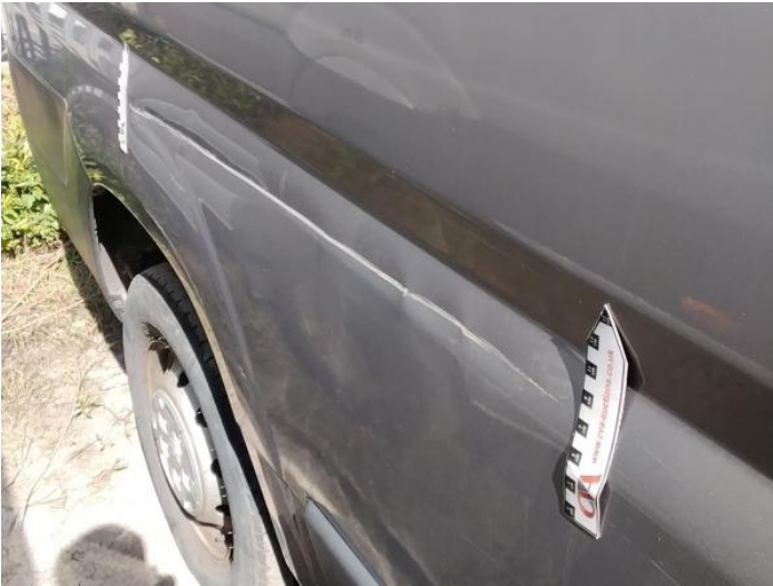
9: Panel Rear Dented With Paint Damage