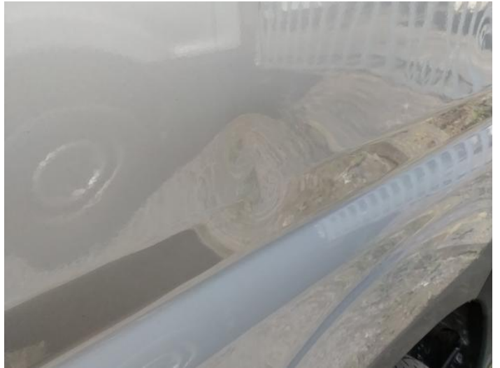
16: Panel Rear Dented Over 30mm