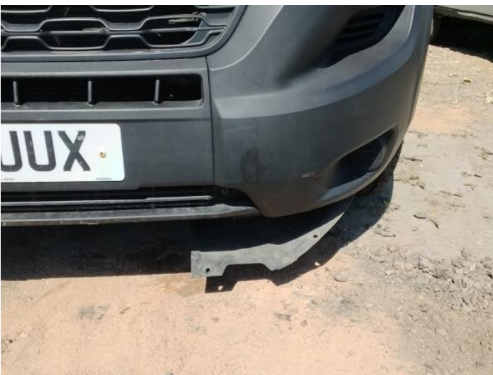
13: Bumper Front Insecure Action Required