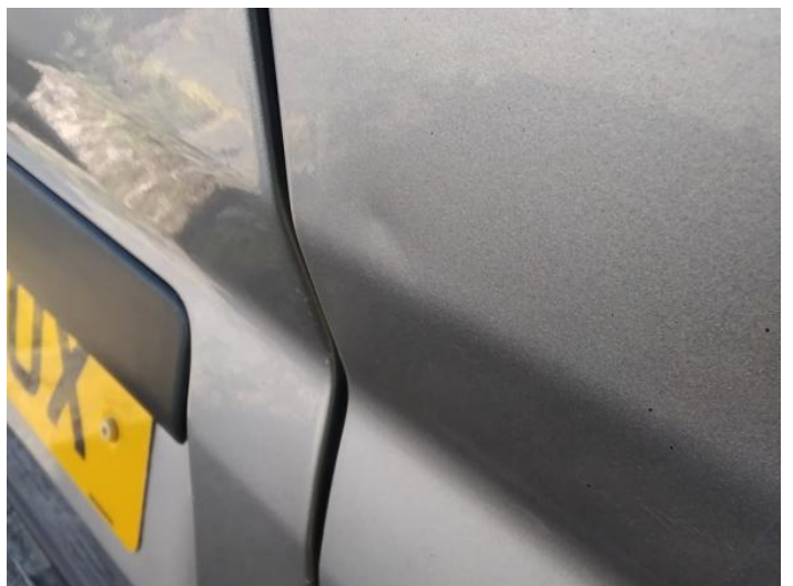
14: Panel Rear Dented Between 10mm + 30mm