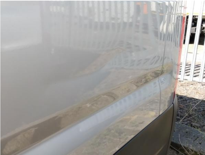
15: Panel Rear Dented Over 30mm