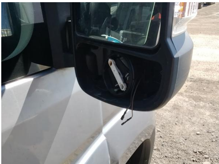
3: Door Mirror Glass ns Missing Replace