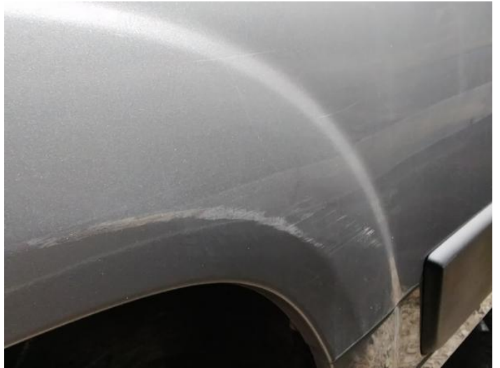
10: Panel Rear Scratched Over 25mm Not Thru Paint