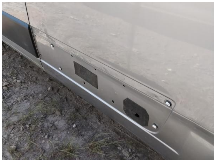
20: Qtr Panel Trim os Missing Replace