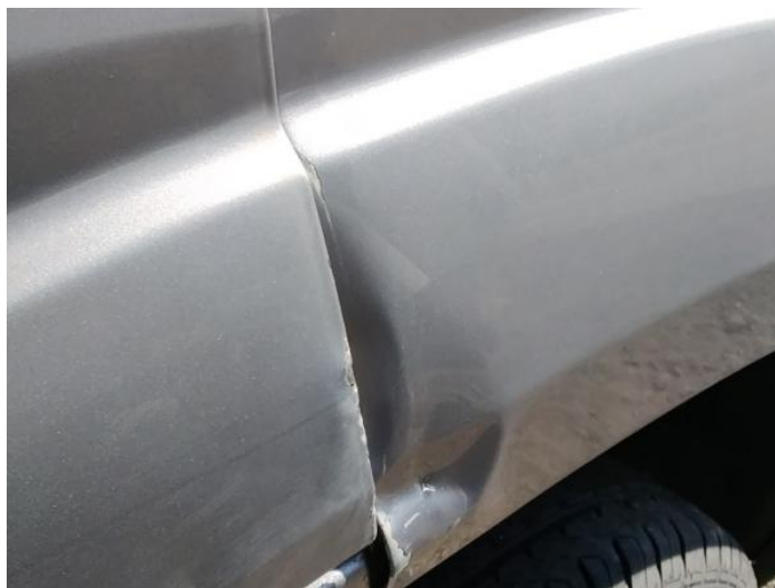
2: Door nsf Chipped Multiple Chips