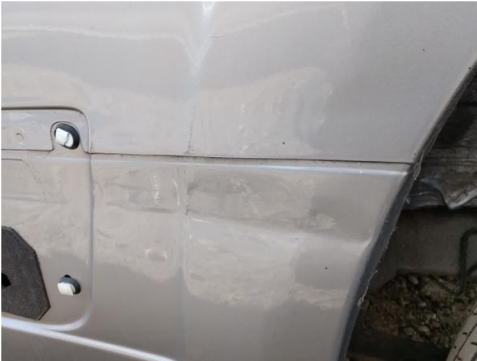
21: Panel Rear Dented Over 30mm