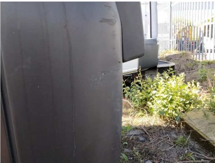
17: Bumper Rear Scratched Over 25mm Not Thru Paint