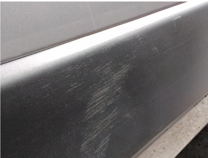
11: Panel Rear Scratched Over 25mm Not Thru Paint