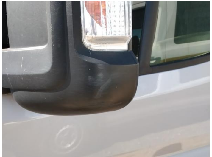
24: Door Mirror Assy osf Scuffed (Unpainted) Over 100mm