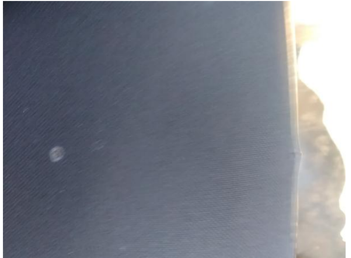
10: Seat Base Cover osf Holed Over 3mm