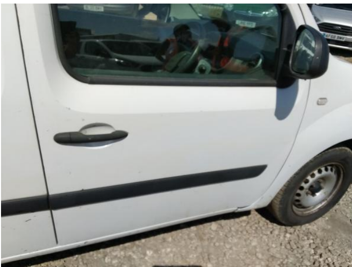
7: B Post os Chipped Multiple Chips