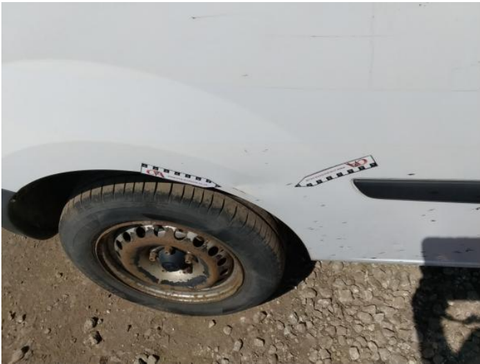
5: Qtr Panel osr Dented Over 30mm