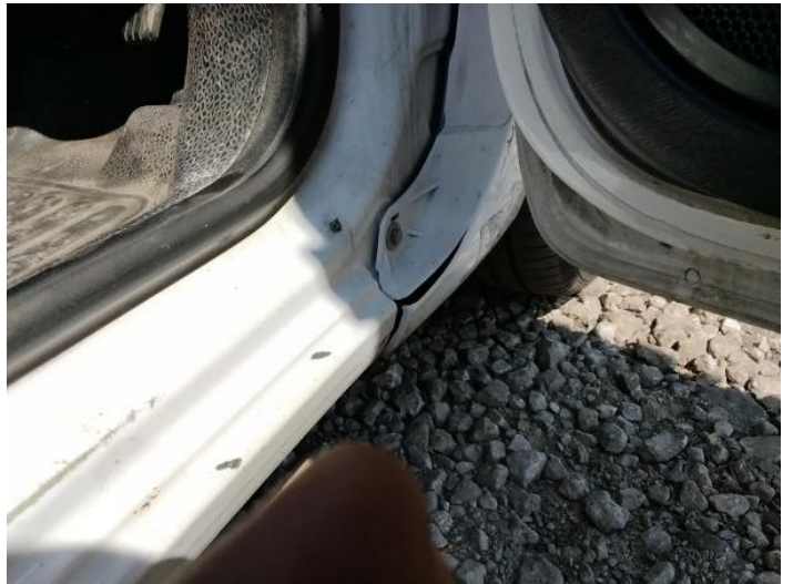
12: Wing osf Cracked Replace