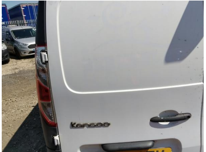
4: D Post os Chipped Multiple Chips