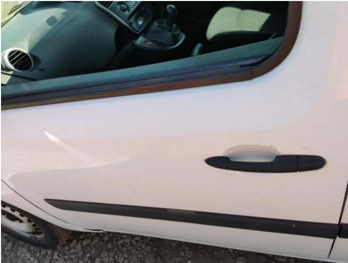
3: B Post ns Chipped Multiple Chips