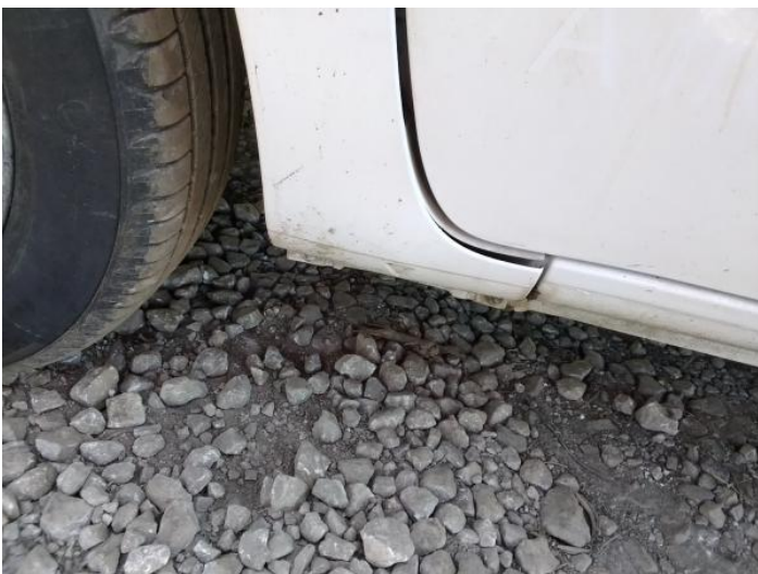
13: Wing nsf Cracked Replace