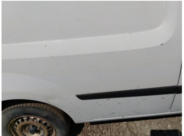
6: Qtr Panel osr Chipped Multiple Chips