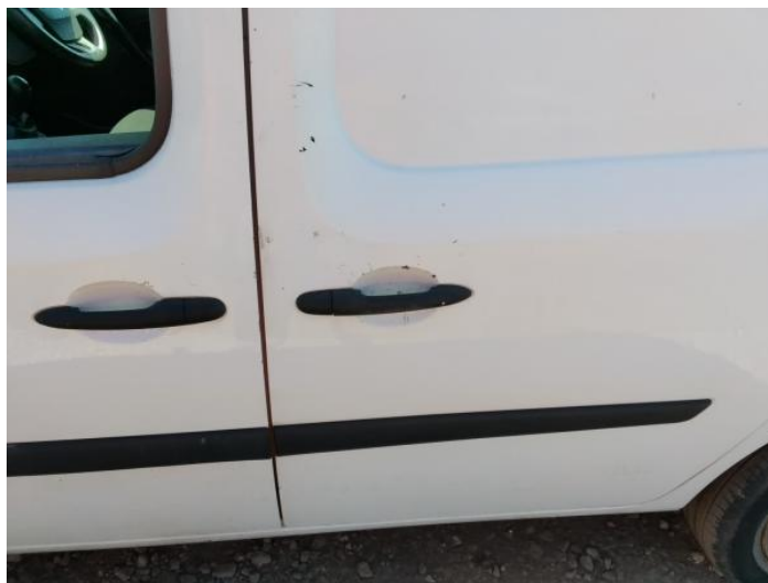
2: Qtr Panel nsr Chipped Multiple Chips