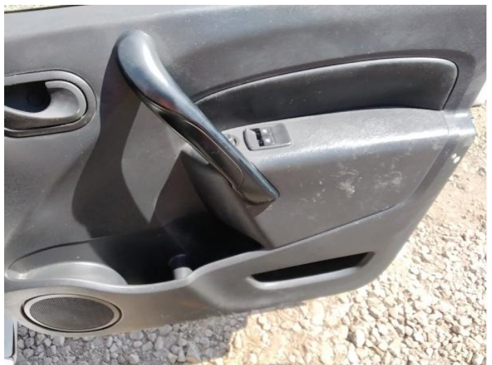
8: Door Pad osf Scuffed Over 25mm