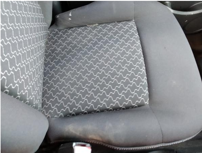
11: Seat Base Cover nsf Soiled Heavy