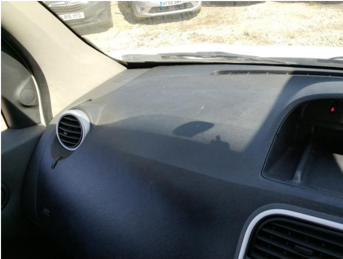
9: Fascia Panel Soiled Heavy