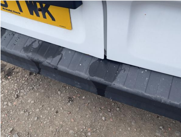
9: Bumper Rear Moulding Scuffed (Unpainted) Over 100mm