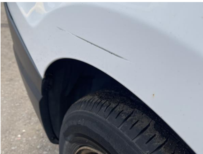
7: Qtr Panel osr Dented With Paint Damage