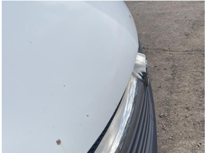
4: Bonnet Dented With Paint Damage