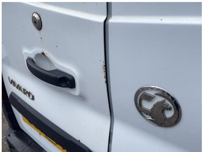
8: Tailgate Dented With Paint Damage