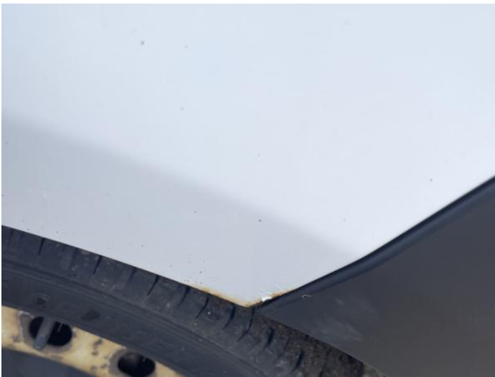
5: Wing osf Rusted Over 5mm