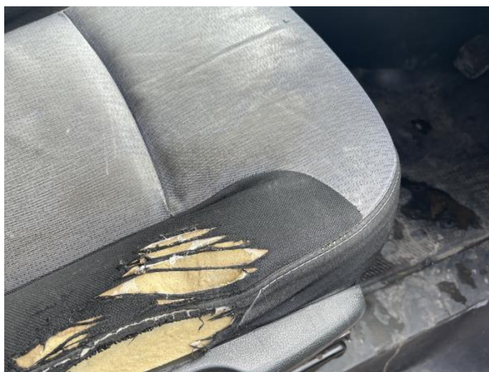
2: Seat Base Cover osf Torn Over 3mm