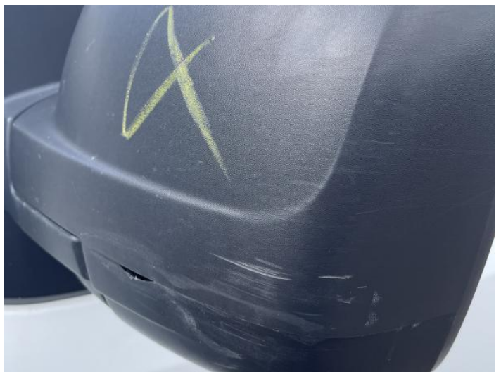
14: Door Mirror Assy nsf Broken Replace