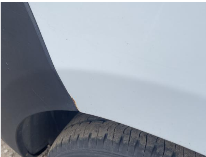
13: Wing nsf Rusted Over 5mm