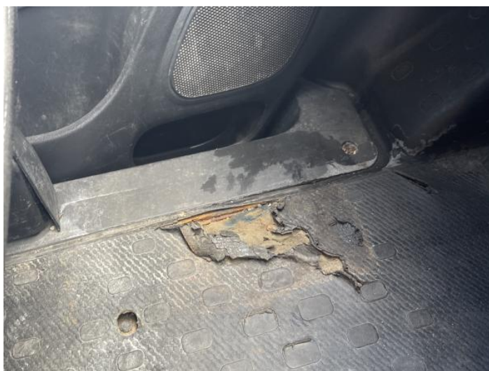
1: Carpets Front Torn Over 10mm