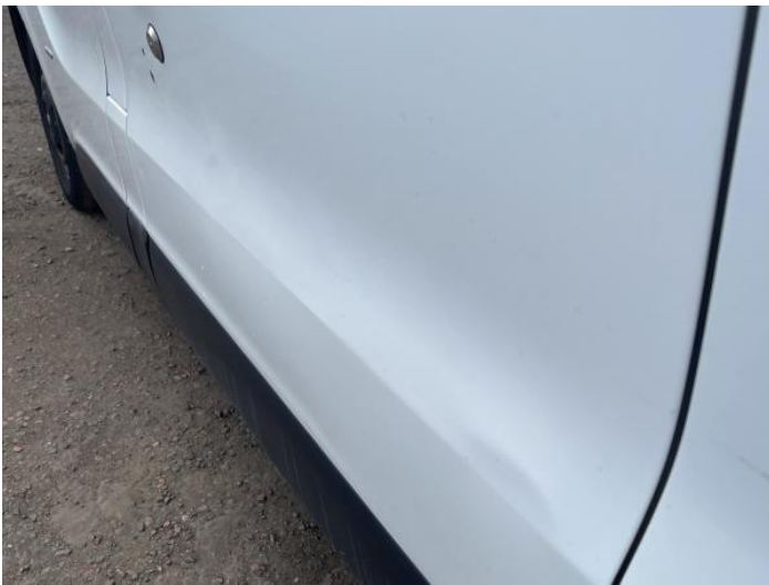
11: Door nsr Dented Over 30mm