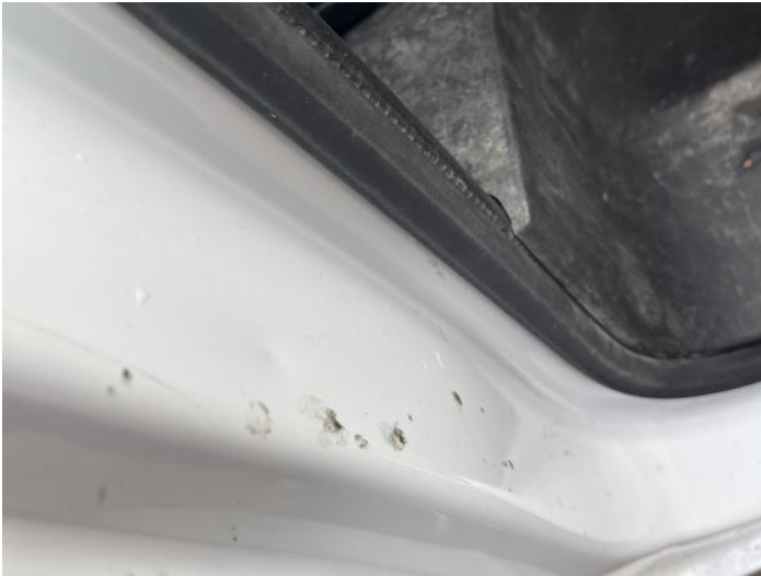
3: Sill os Dented Over 30mm