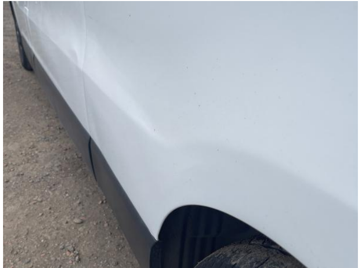
10: Qtr Panel nsr Dented With Paint Damage