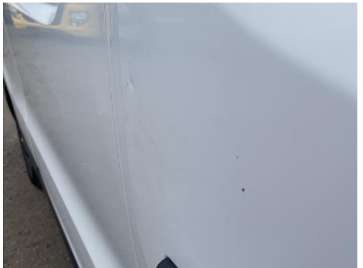
6: Door osf Dented Over 2 UpTo 10mm