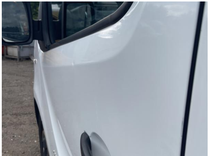
12: Door nsf Dented With Paint Damage