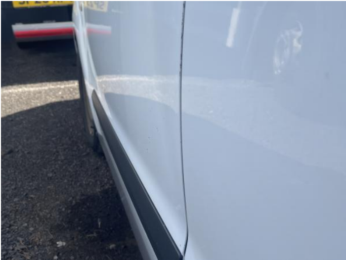
3: Door nsf Dented With Paint Damage