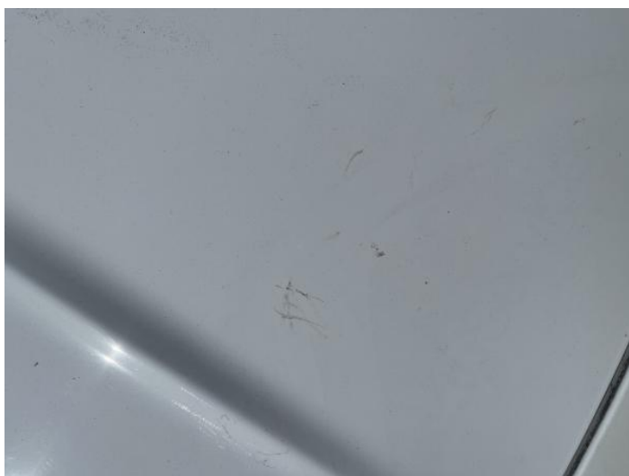
1: Bonnet Scratched UpTo 25mm Not Thru Paint