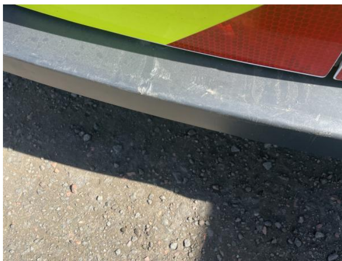
2: Bumper Rear Moulding Scuffed (Unpainted) Over 100mm