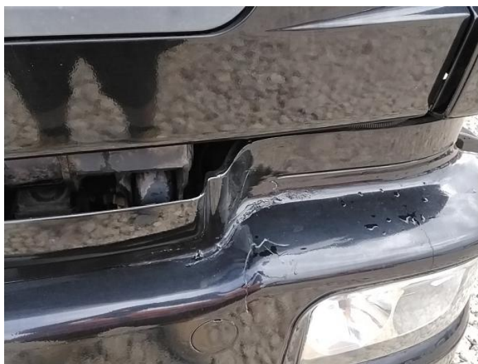
2: Bumper Front Cracked UpTo 25mm