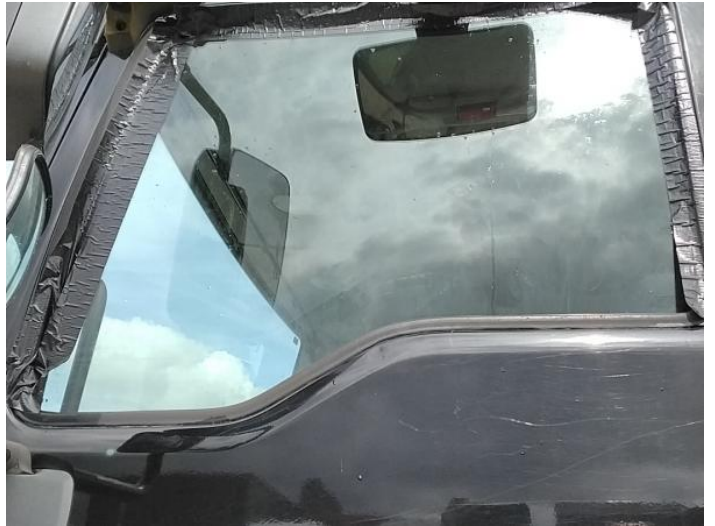
4: Other N/A N/A