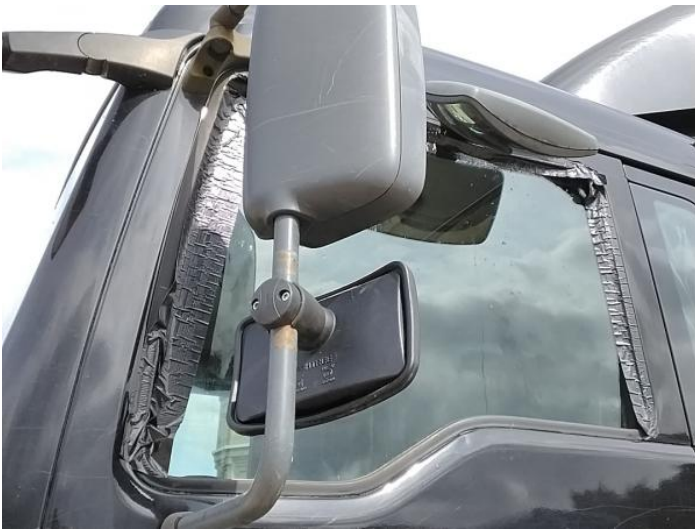
5: Door Mirror Assy nsf Scuffed (Unpainted) UpTo 100mm