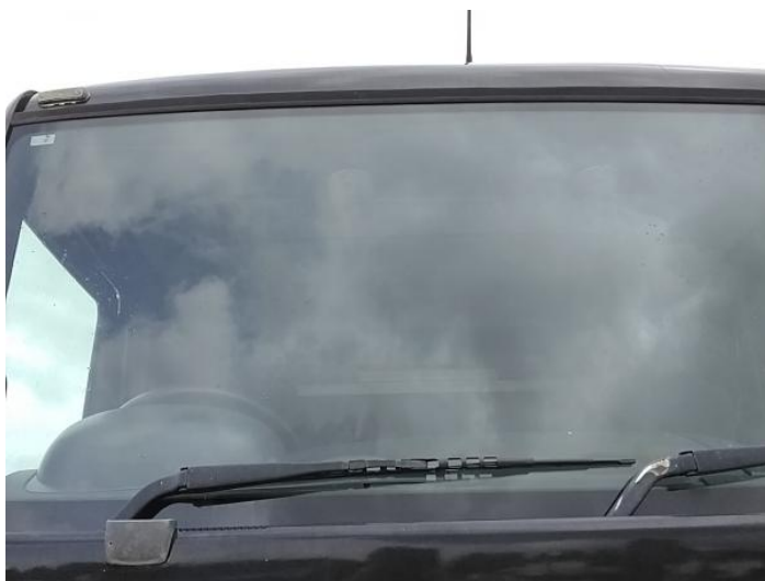
1: Screen Front Chipped UpTo 10mm