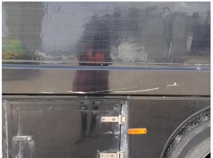
12: Qtr Panel osr Scratched Over 25mm Thru Paint