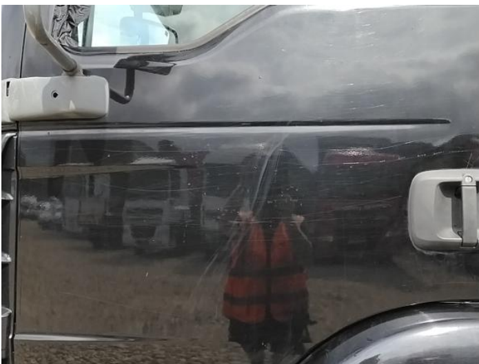
7: Door nsf Scratched Over 25mm Not Thru Paint