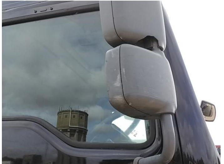
16: Door Mirror Assy osf Broken Replace