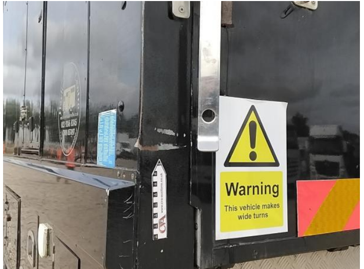
10: Panel Rear Scratched UpTo 25mm Thru Paint