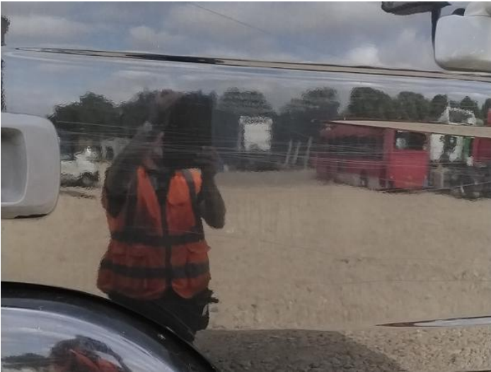
15: Door osf Scratched Over 25mm Not Thru Paint