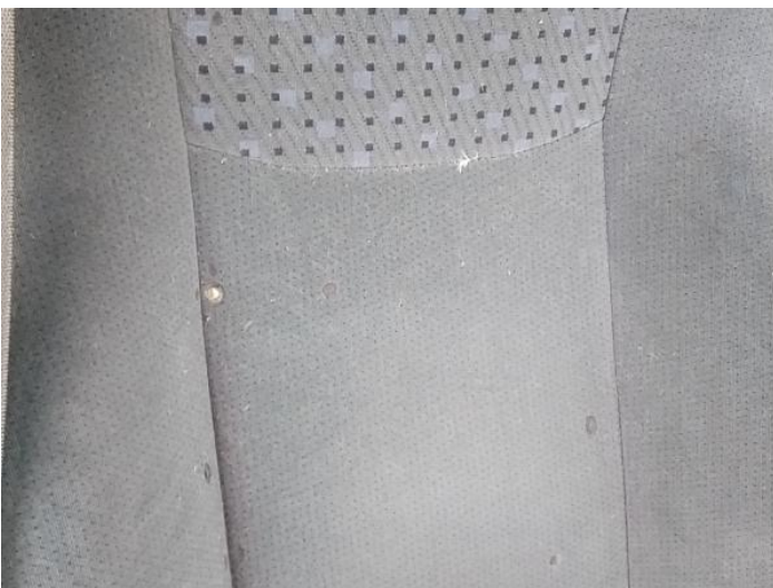
19: Seat Back Cover osf Burn Over 3mm