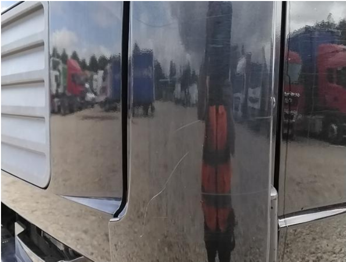
3: Wing nsf Scratched UpTo 25mm Thru Paint