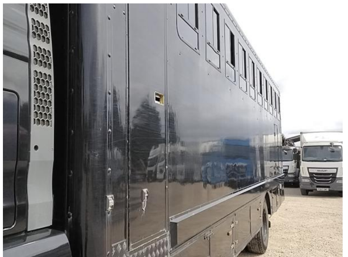
8: Qtr Panel nsr Scratched Over 25mm Not Thru Paint