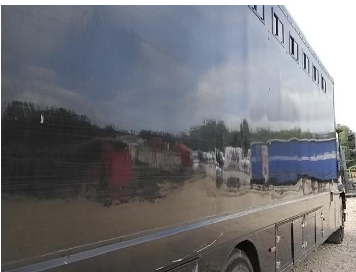
13: Qtr Panel osr Scratched Over 25mm Not Thru Paint