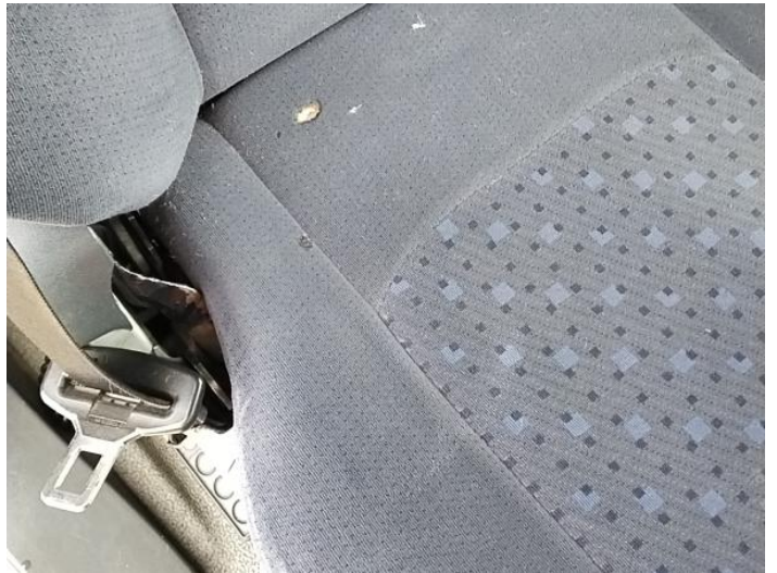
18: Seat Base Cover osf Burn Over 3mm