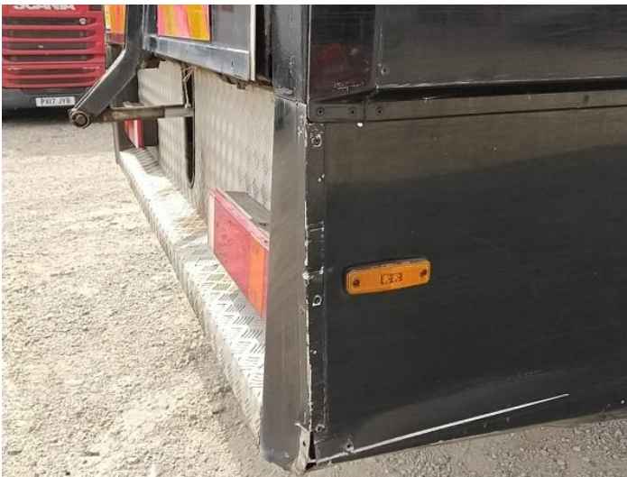
11: Qtr Panel osr Hole Over 10mm