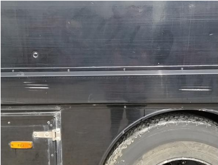
9: Qtr Panel nsr Scratched Over 25mm Thru Paint