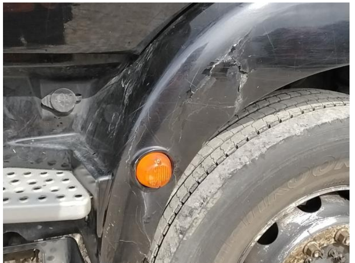
6: Other N/A N/A