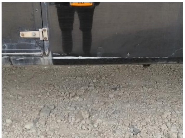
14: Qtr Panel osr Scratched Over 25mm Thru Paint