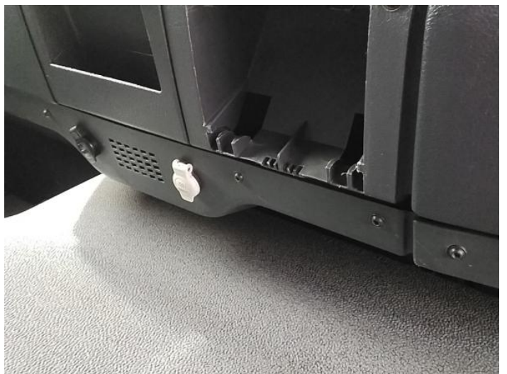
20: Other N/A N/A