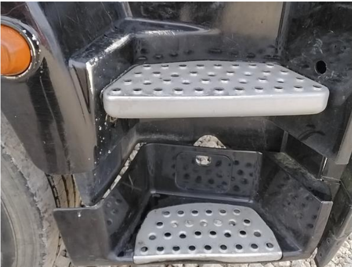
17: Other N/A N/A