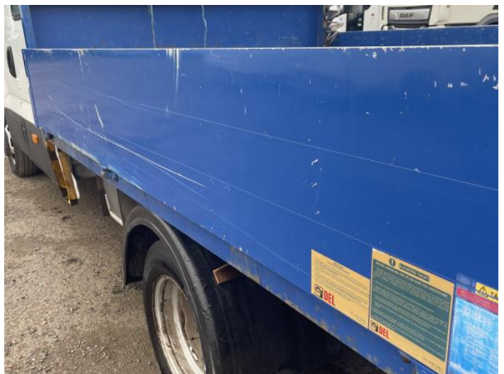
8: Qtr Panel nsr Dented With Paint Damage