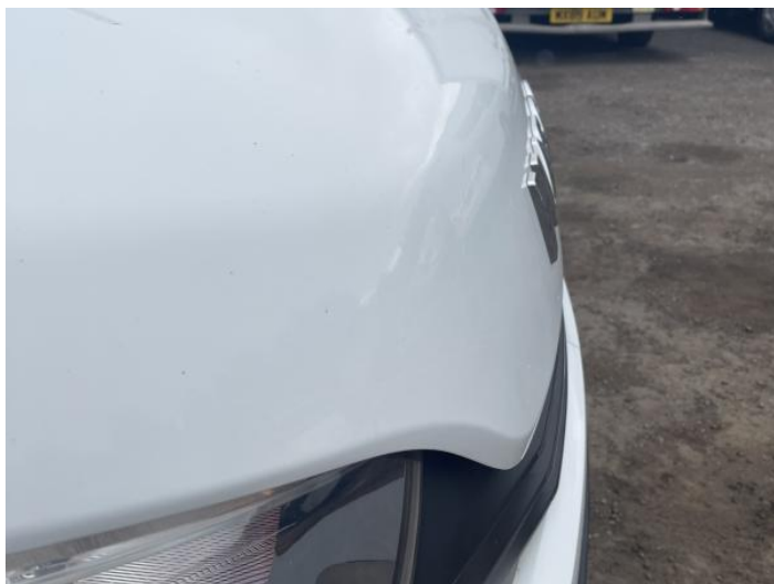
1: Bonnet Dented Over 30mm