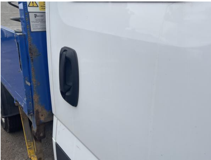
5: Door osr Dented Over 30mm