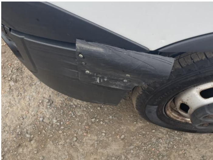
9: Bumper Front Hole Over 25mm