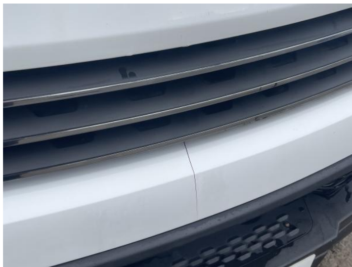
2: Bumper Front Cracked Over 25mm