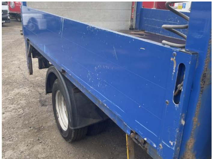
6: Qtr Panel osr Dented With Paint Damage