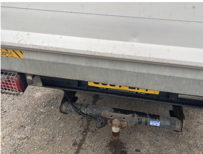
7: Tailgate Dented With Paint Damage