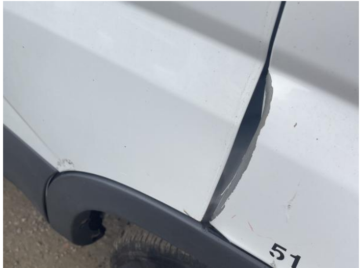
4: Door osf Dented With Paint Damage