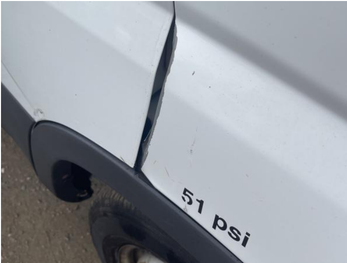
3: Wing osf Dented With Paint Damage