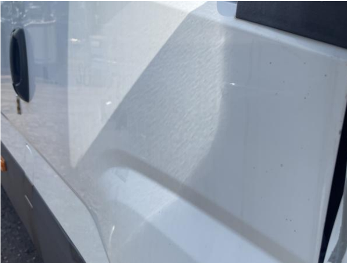
3: Door osf Dented With Paint Damage