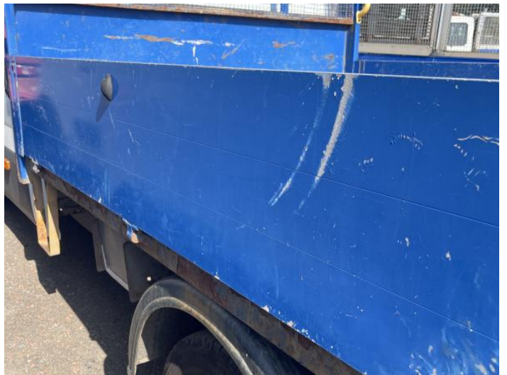
6: Qtr Panel nsr Dented With Paint Damage