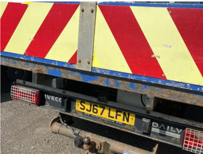
5: Tailgate Dented With Paint Damage