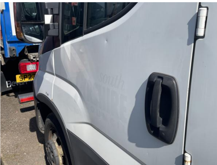
7: Door nsf Dented With Paint Damage