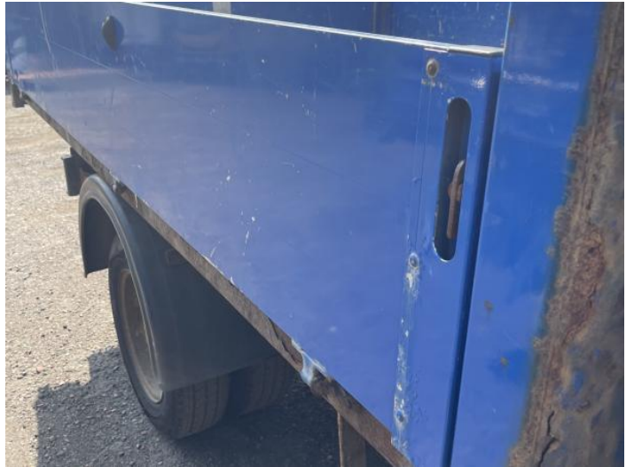
4: Qtr Panel osr Dented With Paint Damage