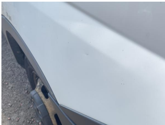
2: Wing osf Dented With Paint Damage