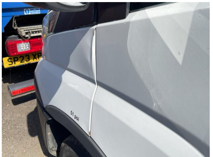
8: Wing nsf Dented With Paint Damage