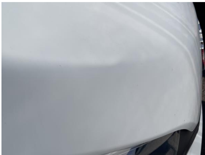
1: Bonnet Dented With Paint Damage