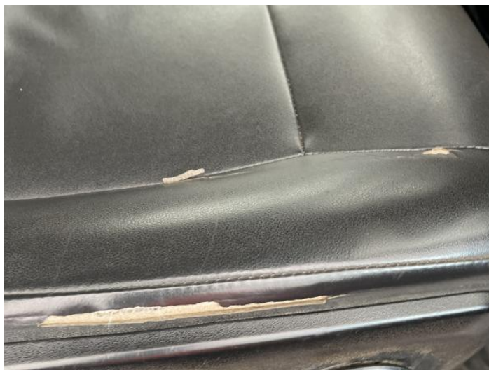
1: Seat Base Cover osf Torn Over 3mm