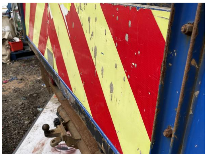
8: Tailgate Dented With Paint Damage