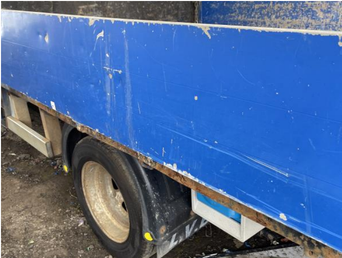
9: Qtr Panel nsr Dented With Paint Damage