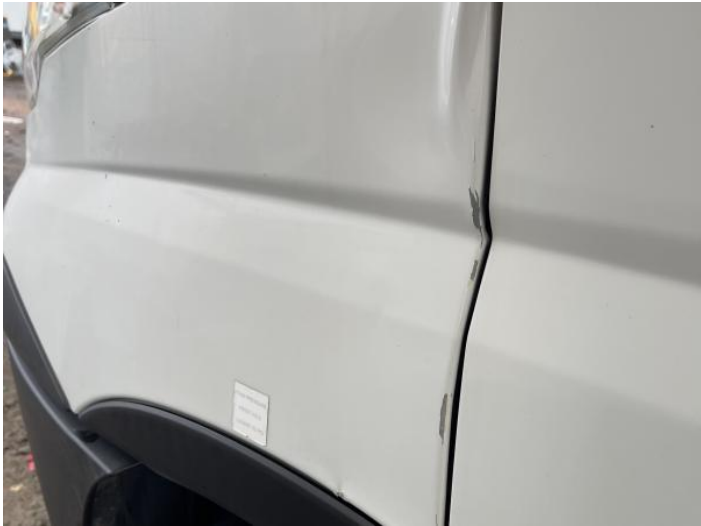
10: Wing nsf Dented With Paint Damage