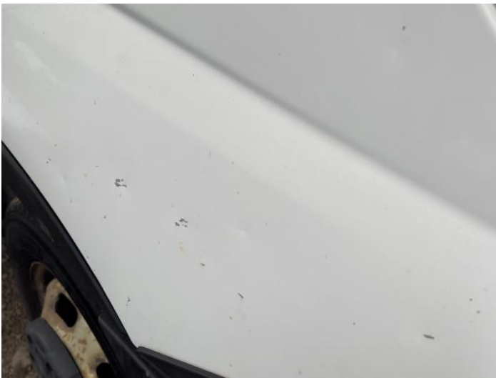
5: Wing osf Dented With Paint Damage