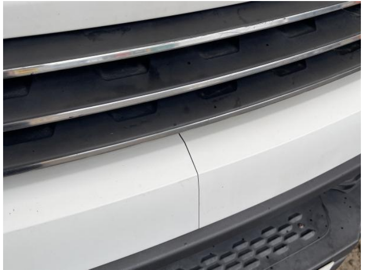
4: Bumper Front Cracked Over 25mm