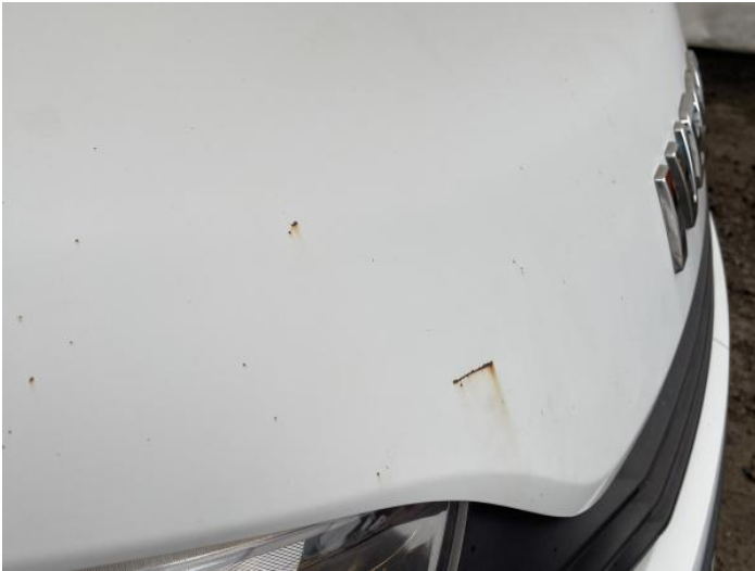
3: Bonnet Rusted Over 5mm