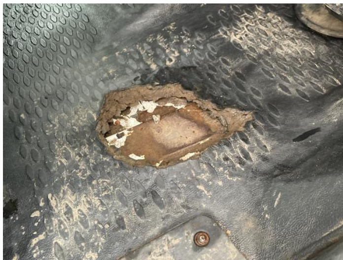
2: Carpets Front Torn Over 10mm