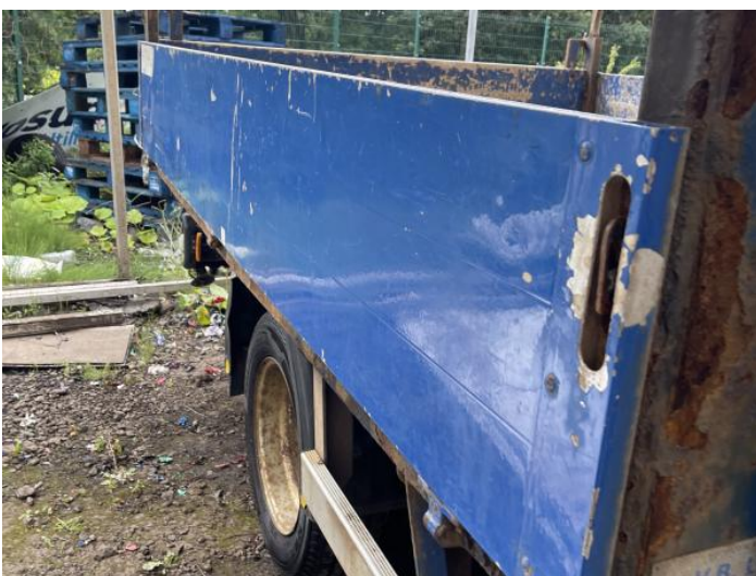
7: Qtr Panel osr Dented Over 30mm