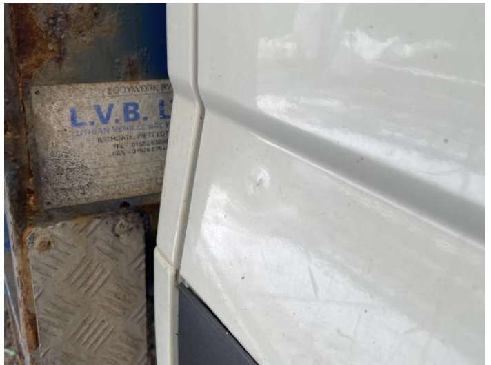
6: Door osr Dented Over 30mm