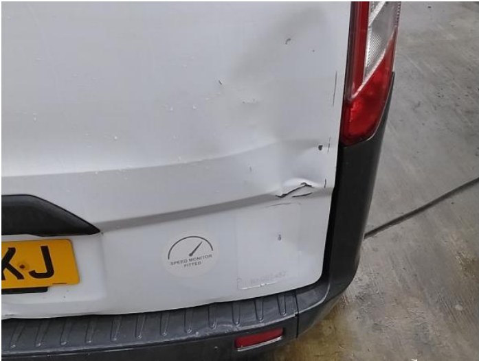
3: Panel Rear Dented Over 30mm