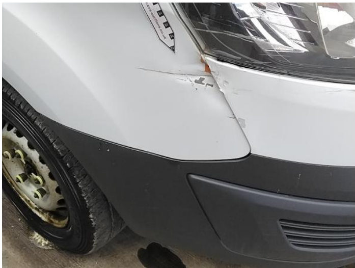
1: A Post os Dented Over 30mm