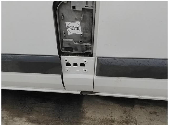
2: Unclassified Major Parts Missing Report Only