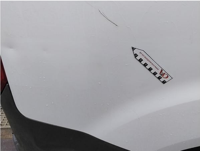
4: Qtr Panel osr Scratched Over 25mm Thru Paint