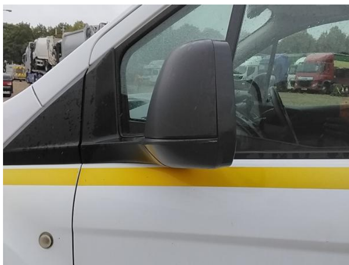
2: Door Mirror Assy nsf Scuffed (Unpainted) UpTo 100mm