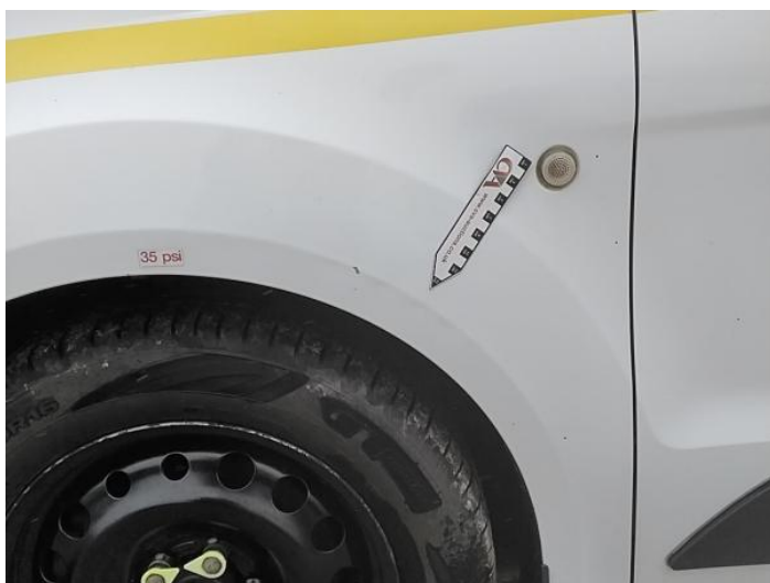
1: Wing nsf Dented Between 10mm + 30mm