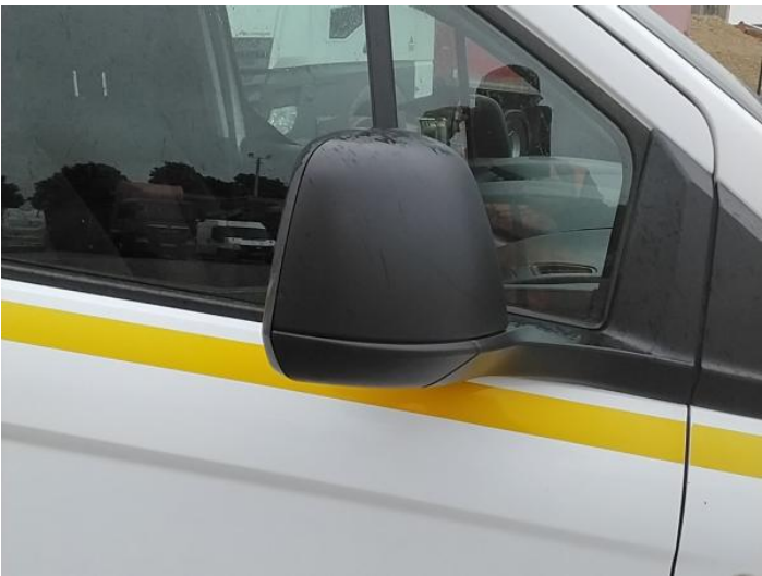
4: Door Mirror Assy osf Scuffed (Unpainted) UpTo 100mm