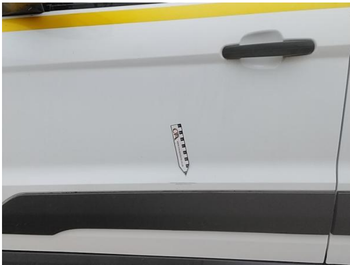
3: Door nsf Scratched UpTo 25mm Thru Paint