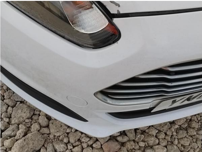
1: Bonnet Chipped Over 5mm