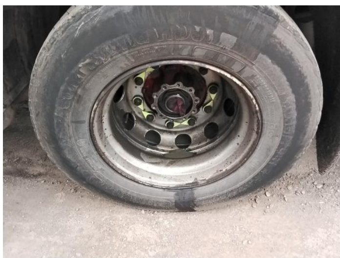
8: Unclassified Major Parts Missing Report Only