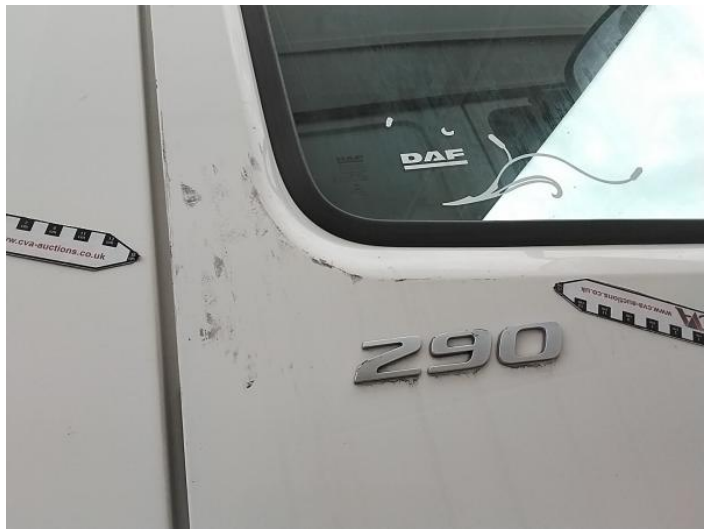
12: Door osf Scratched Over 25mm Thru Paint