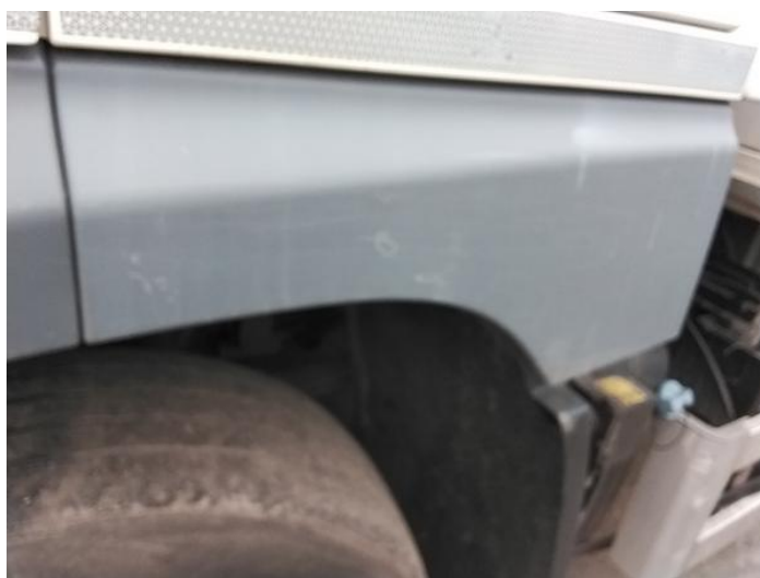
6: Wing nsf Scratched Over 25mm Thru Paint