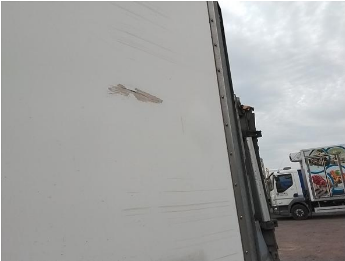
9: Qtr Panel nsr Cracked Replace