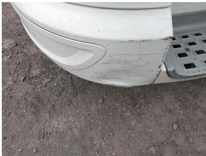
4: Bumper Front Dented With Paint Damage