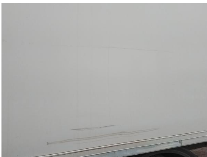
7: Qtr Panel nsr Scratched Over 25mm Thru Paint