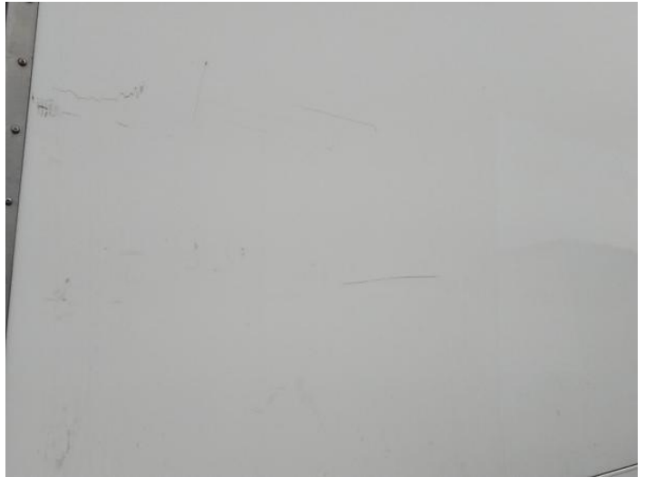
10: Qtr Panel osr Scratched Over 25mm Thru Paint