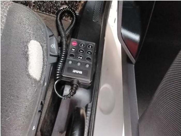
15: Seat Base Cover osf Torn Over 3mm