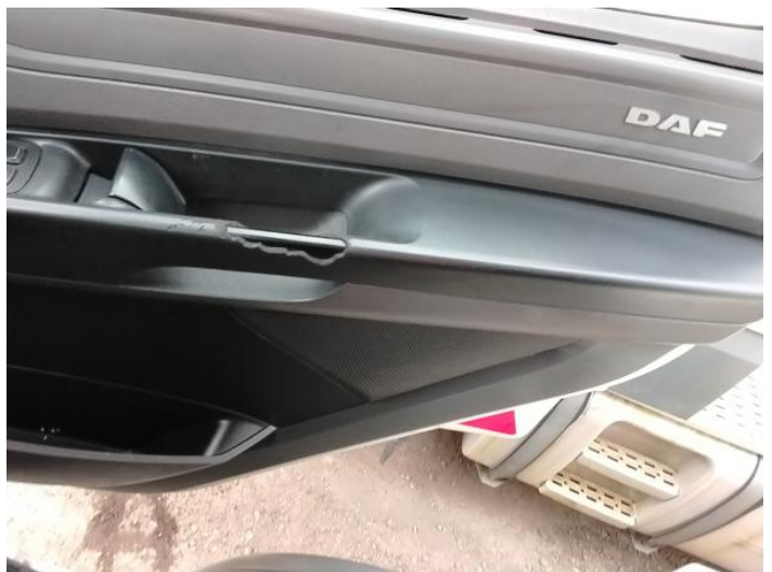
14: Door Pad osf Broken Replace