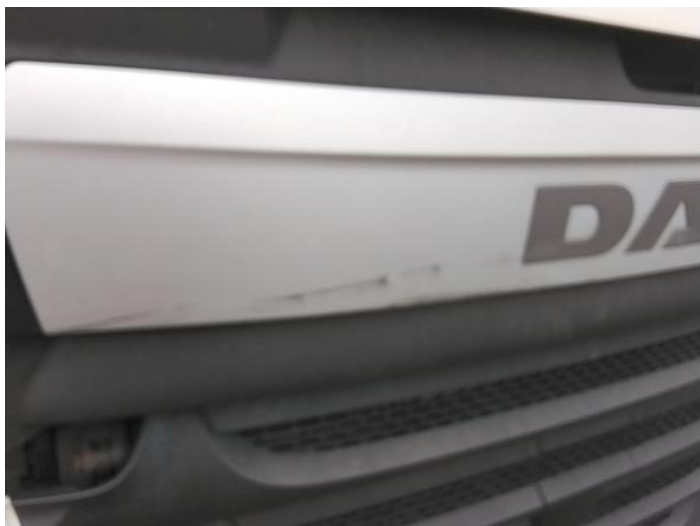
3: Bonnet Scratched Over 25mm Thru Paint