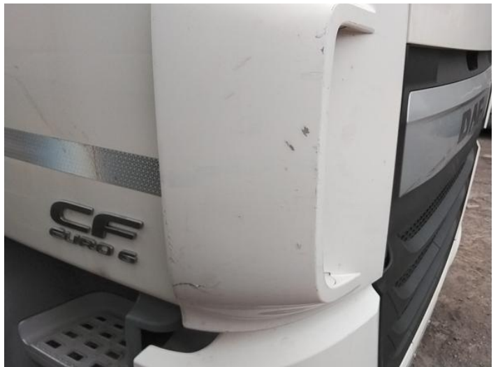
2: Panel Front Cracked Replace