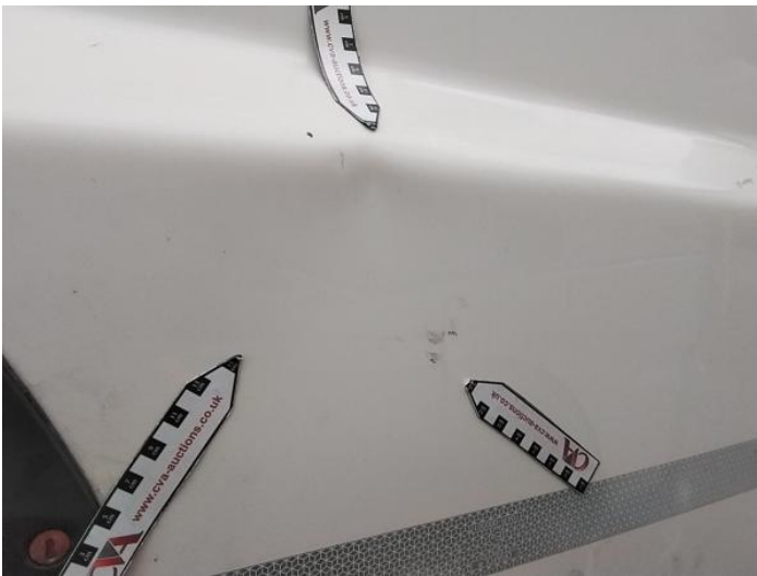
11: Door osf Dented With Paint Damage