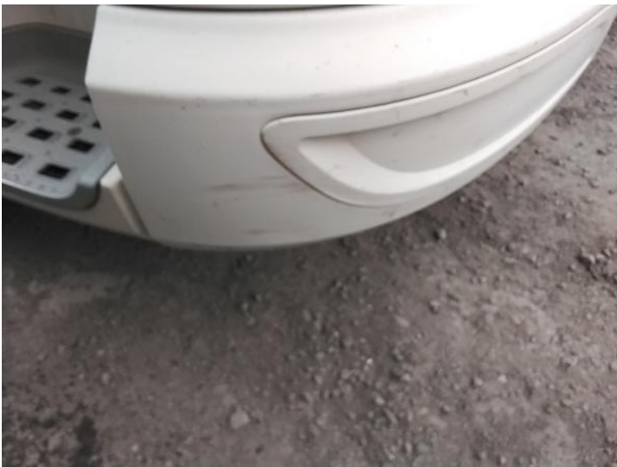
1: Bumper Front Scratched Over 100mm Thru Paint