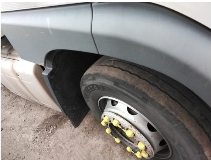
13: Wing osf Scratched Over 25mm Thru Paint