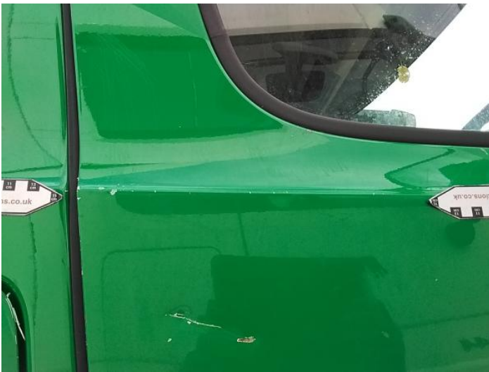
5: Door osf Scratched Over 25mm Thru Paint