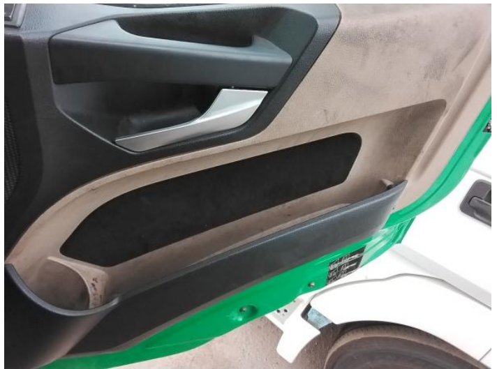
6: Door Pad osf Soiled Heavy