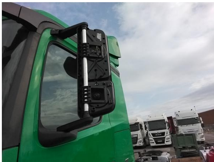
2: Door Mirror Assy nsf Broken Replace