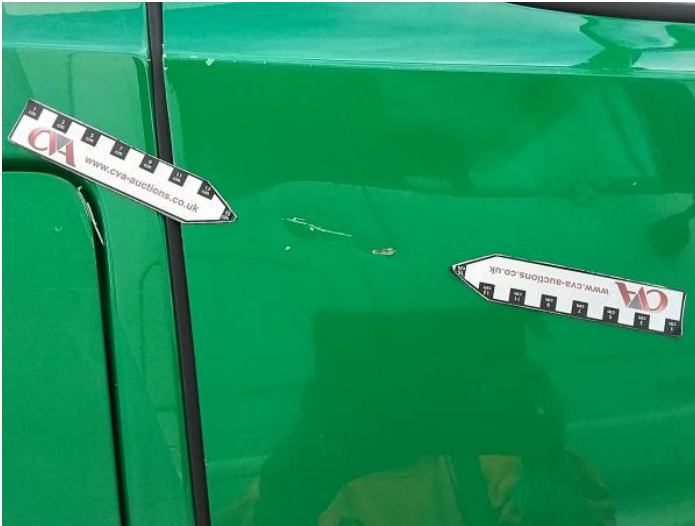
3: Door osf Dented With Paint Damage