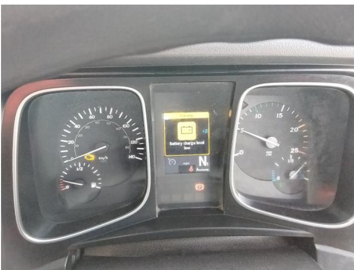
7: Dash Warning Lights Displayed No Action