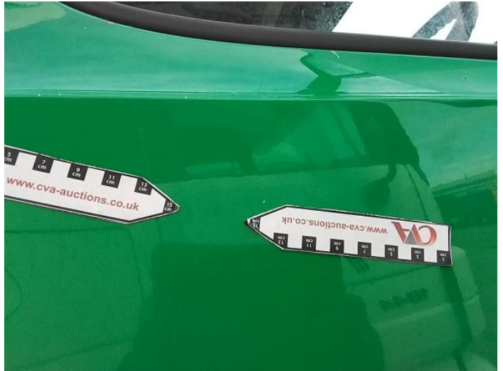
4: Door osf Dented Over 30mm