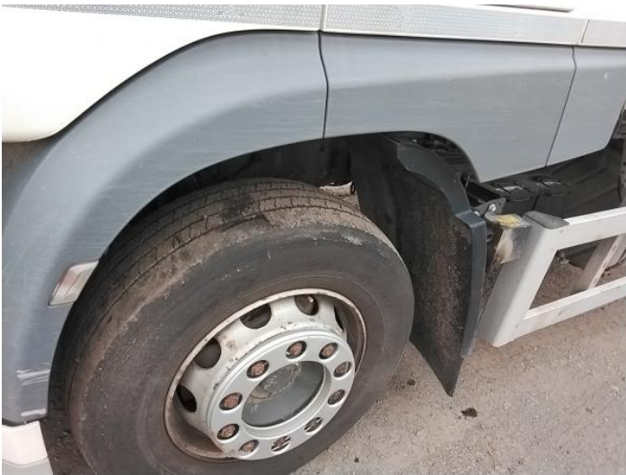
3: Wing nsf Scratched Over 25mm Thru Paint