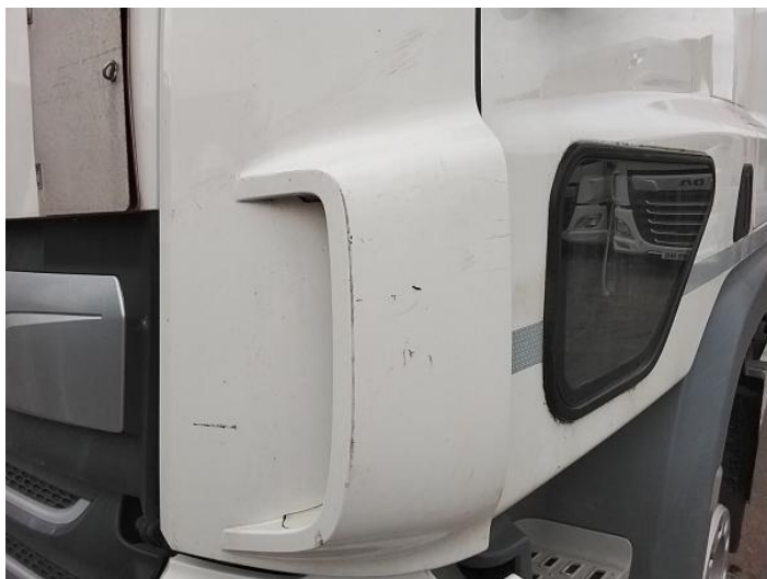
1: Panel Front Scratched Over 25mm Thru Paint