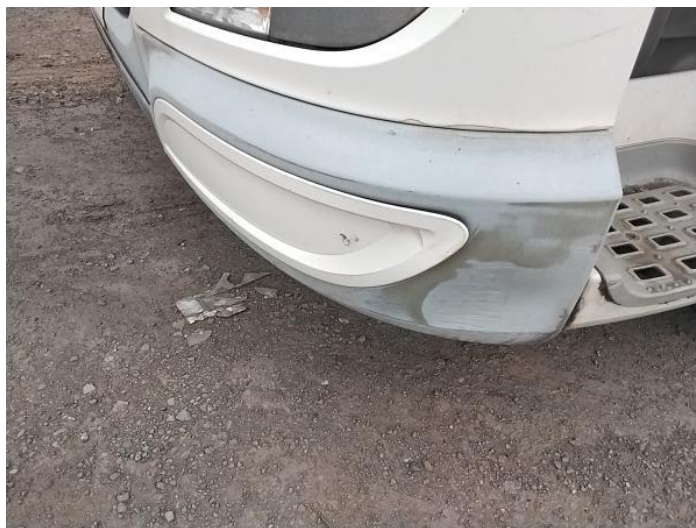
2: Bumper Front Dented With Paint Damage