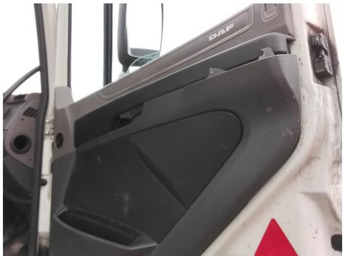
8: Door Pad osf Broken Replace