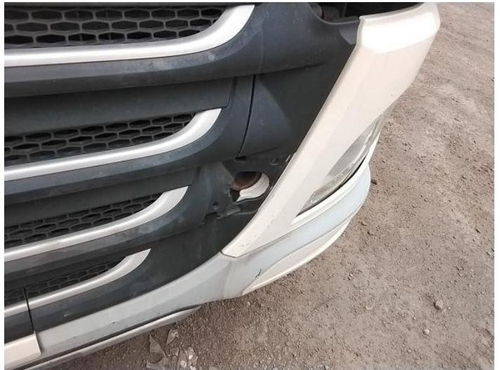
6: Bumper Front Moulding Missing Replace