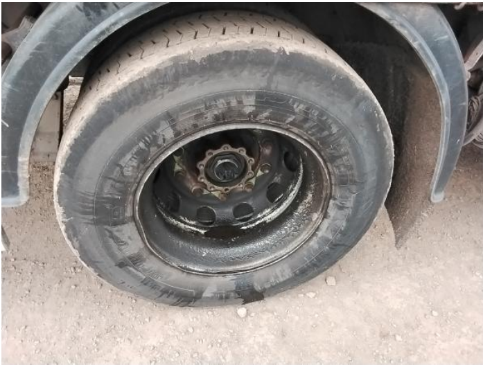
5: Unclassified Major Parts Missing Report Only