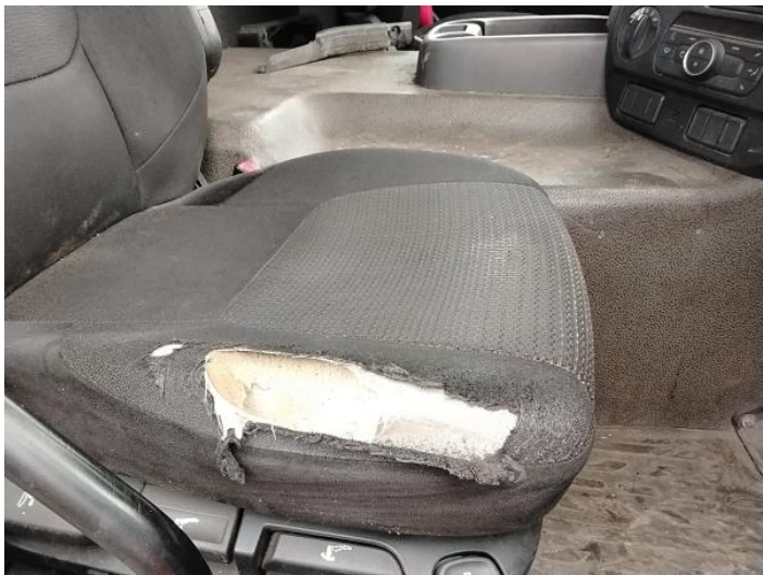
9: Seat Base Cover osf Holed Over 3mm