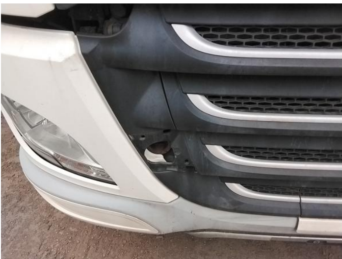
7: Bumper Front Moulding Missing Replace