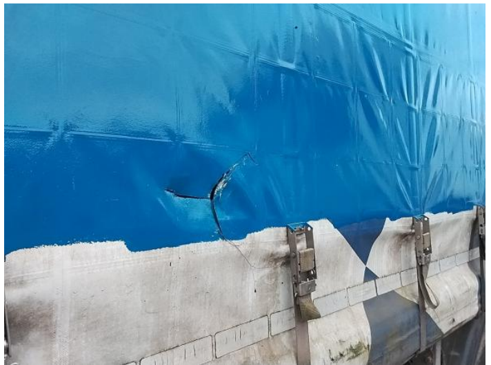
4: Qtr Panel nsr Hole Over 10mm