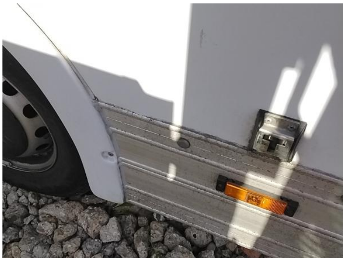
1: Qtr Panel nsr Scratched UpTo 25mm Thru Paint