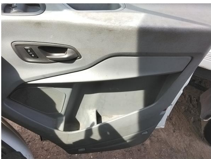
13: Door Pad osf Soiled Heavy