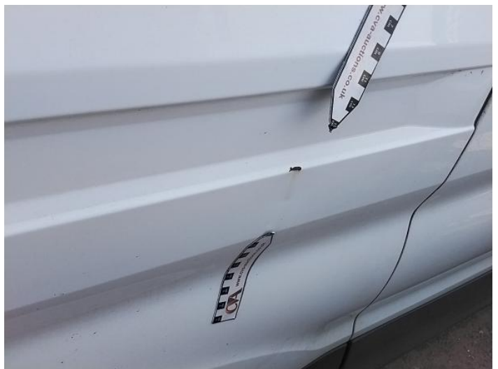
8: Qtr Panel osr Dented With Paint Damage