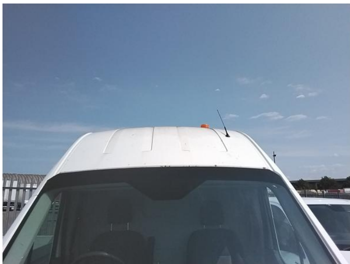
1: Roof Chipped Multiple Chips