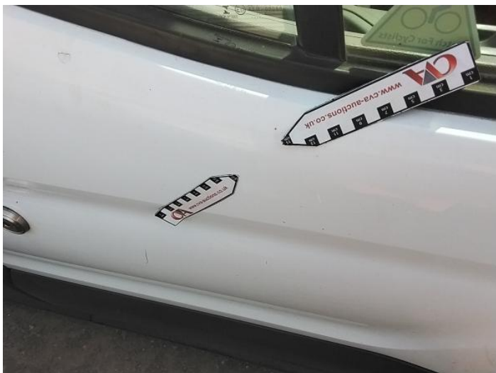
9: Door osf Dented Over 30mm