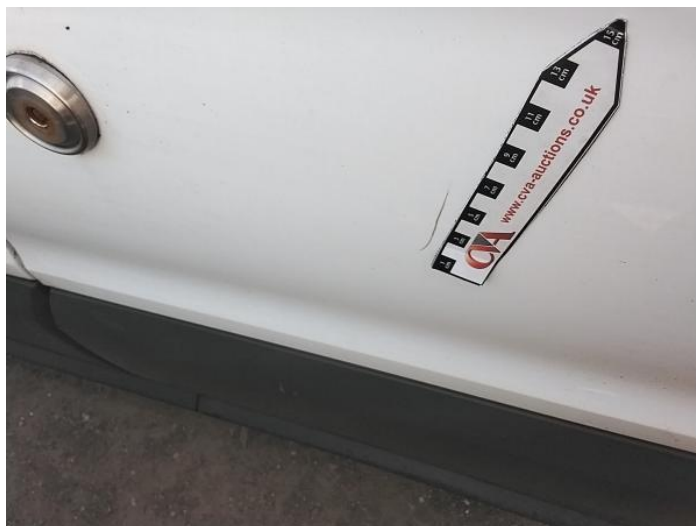
10: Door osf Scratched Over 25mm Thru Paint