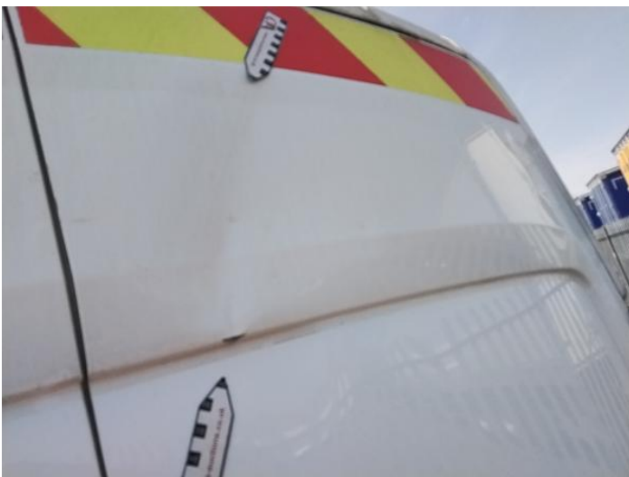
7: Door osr Dented Over 30mm