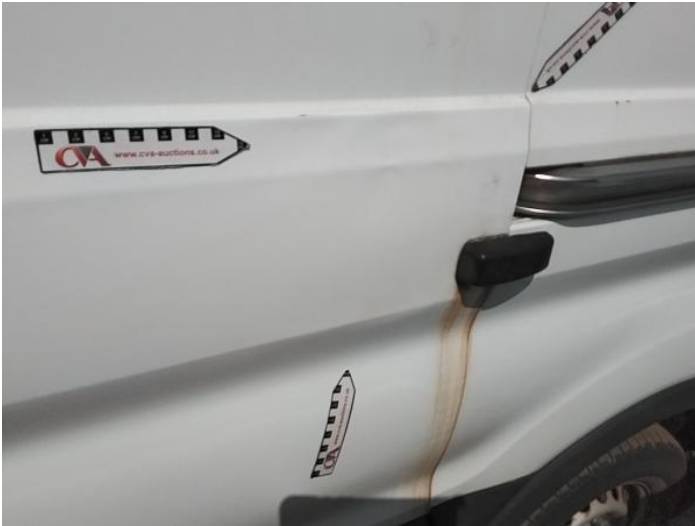
3: Qtr Panel nsr Dented Over 30mm