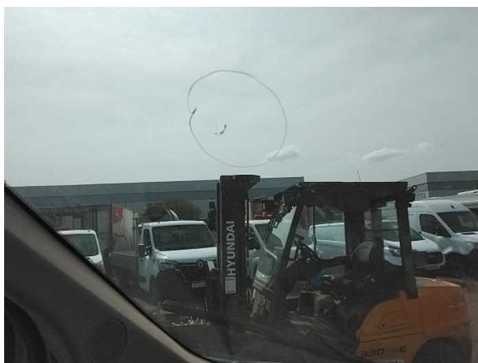
12: Screen Front Cracked Replace