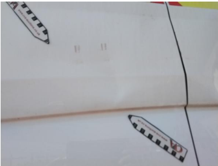
5: Door nsr Dented With Paint Damage