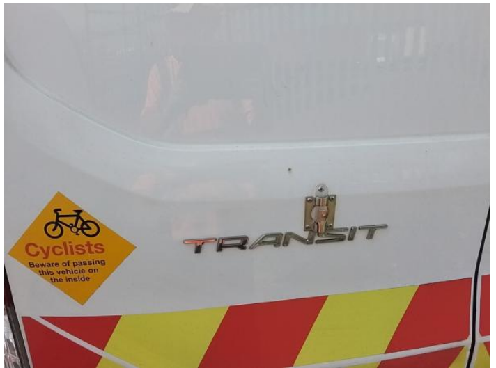
6: Door nsr Chipped Multiple Chips