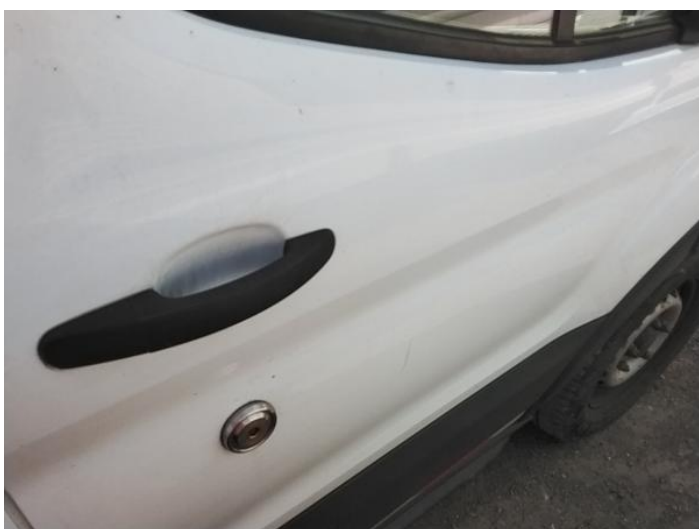
11: Door osf Chipped Multiple Chips