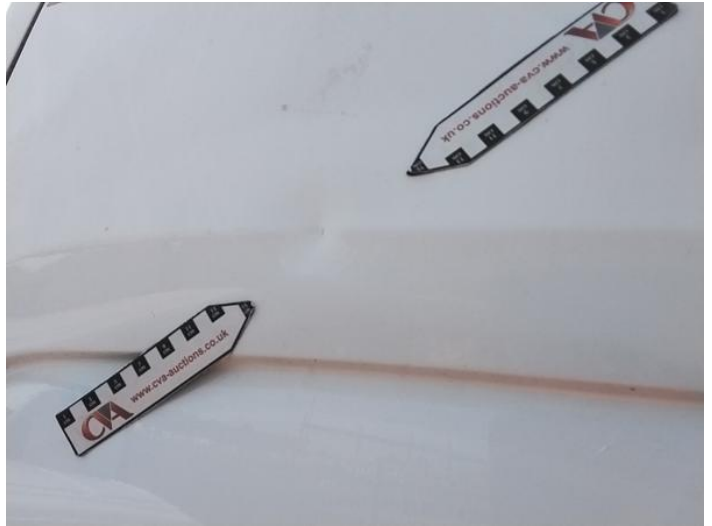
4: Door nsr Dented Over 30mm