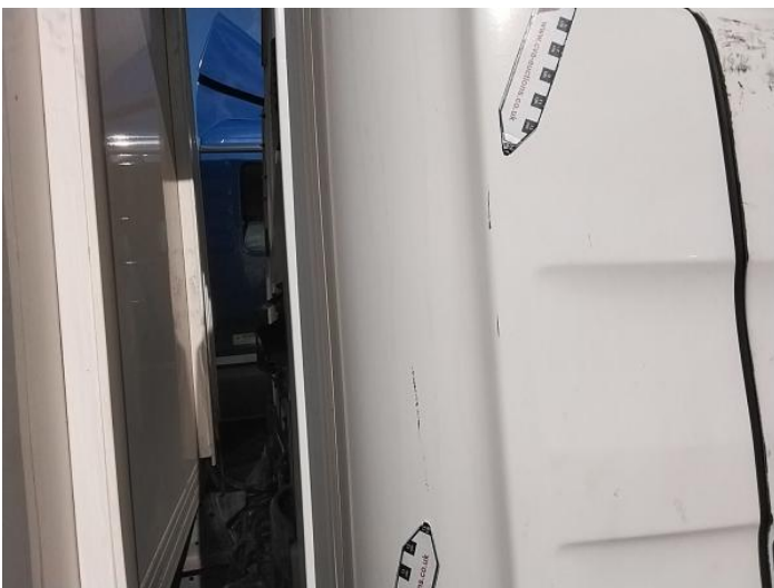
7: B Post os Scratched Over 25mm Thru Paint