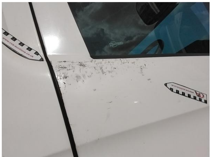
8: Door osf Scratched Over 25mm Thru Paint