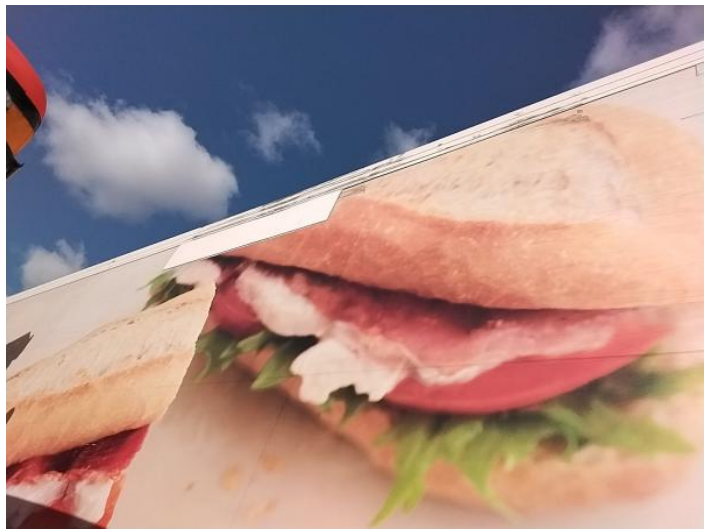
6: Qtr Panel osr Scratched Over 25mm Thru Paint