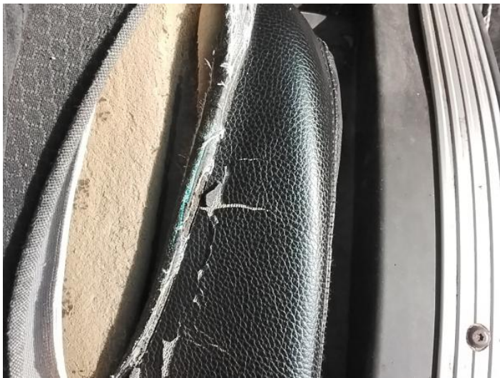
9: Seat Base Cover osf Torn Over 3mm