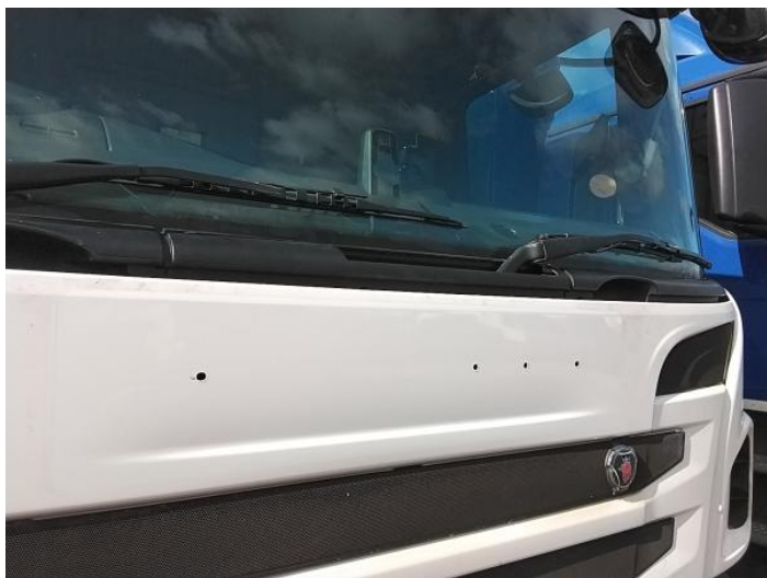
1: Bonnet Hole Over 10mm