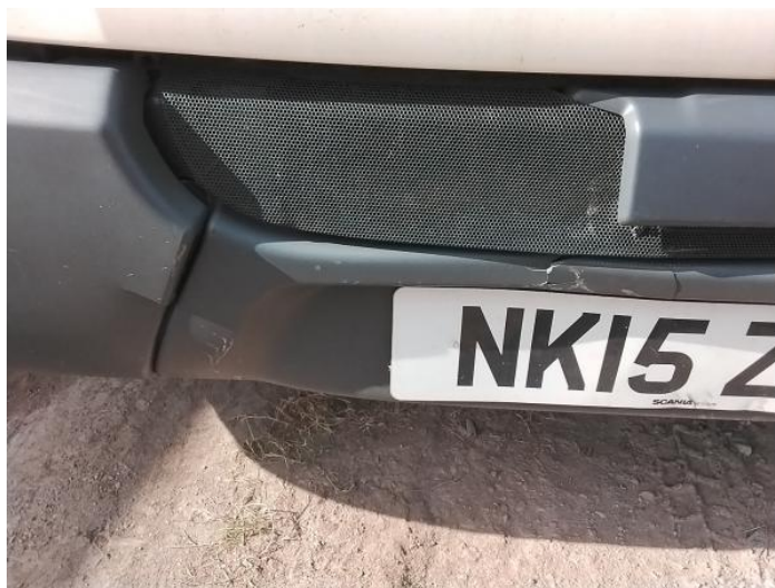
2: Bumper Front Cracked Over 25mm