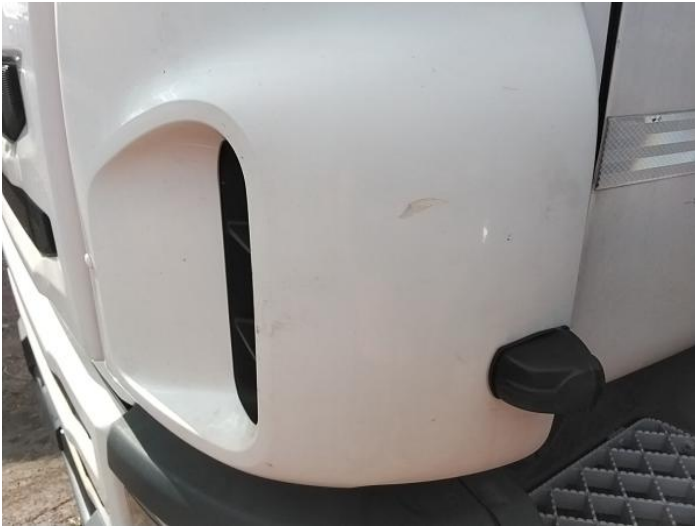
3: Panel Front Scratched Over 25mm Thru Paint