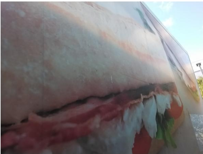
5: Qtr Panel nsr Scratched Over 25mm Thru Paint