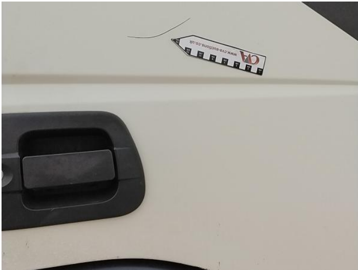
2: Door osf Scratched UpTo 25mm Thru Paint