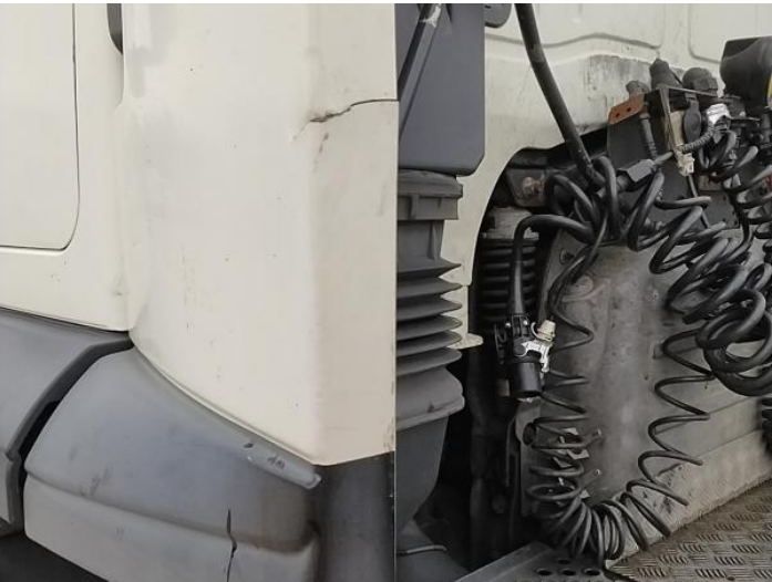
1: D Post ns Cracked Replace