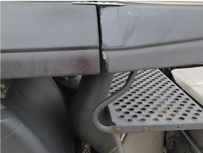
1: D Post ns Cracked Replace