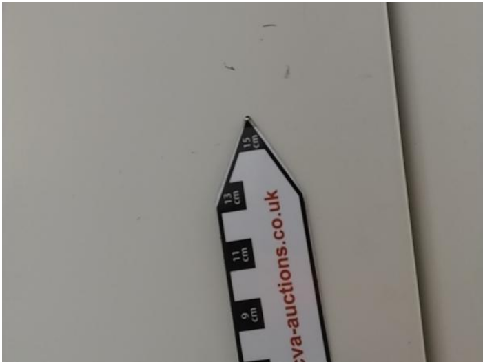
2: Bumper Front Chipped 1 To 5