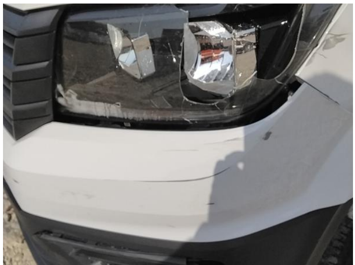
2: Door Qtr Light nsf Cracked Replace