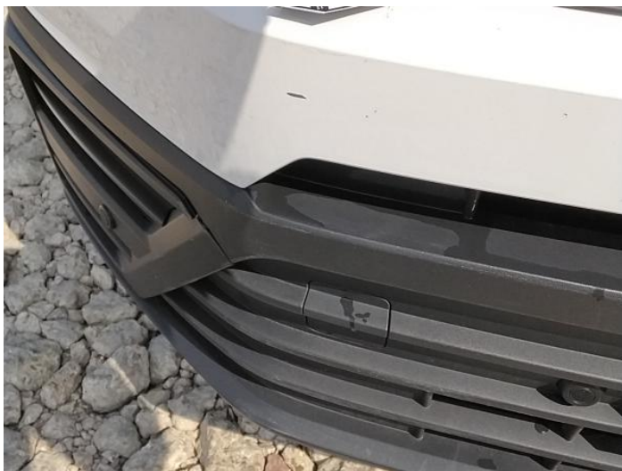
1: Bumper Front Scratched UpTo 25mm Thru Paint