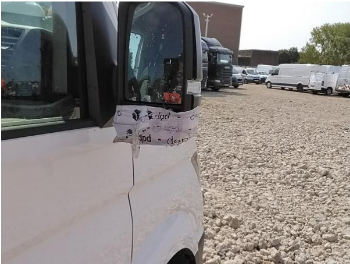
5: Door Mirror Assy osf Broken Replace