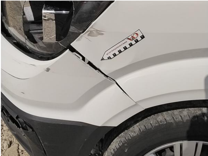
4: Bumper Front Insecure Action Required