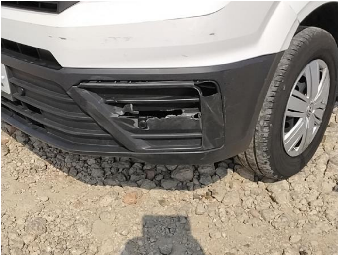
3: Bumper Front Grill Broken Replace