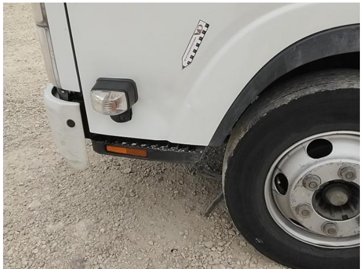
2: Door nsf Dented Over 30mm