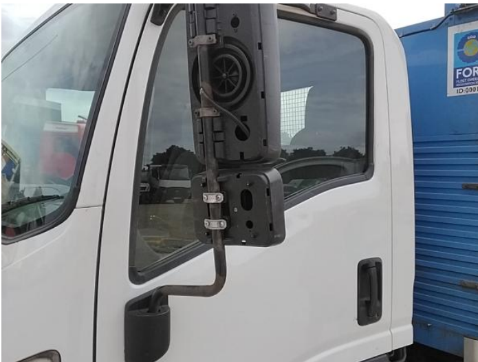
1: Door Mirror Assy nsf Missing Replace