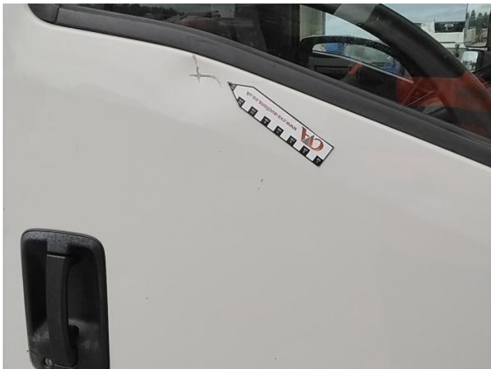
3: Door osf Dented With Paint Damage