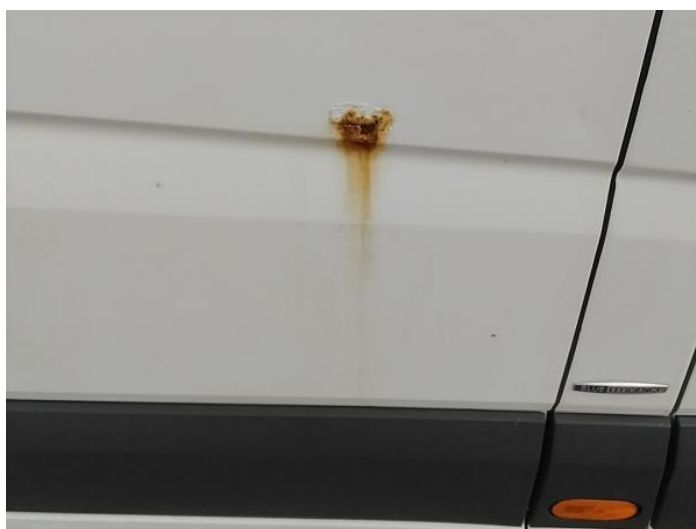
6: D Post os Rusted Over 5mm