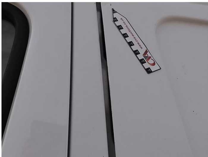
1: Qtr Panel nsr Dented Over 2 UpTo 10mm