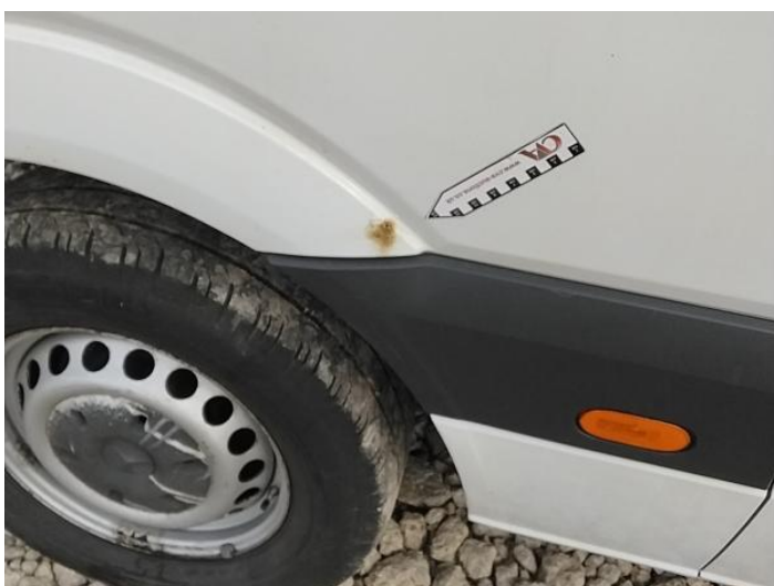
5: Qtr Panel osr Rusted Over 5mm