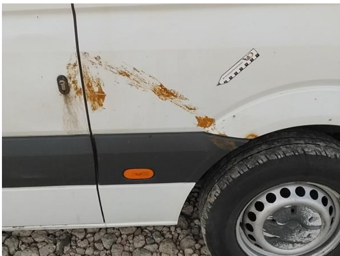
3: Qtr Panel nsr Rusted Over 5mm