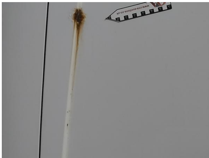
4: Qtr Panel osr Rusted Over 5mm