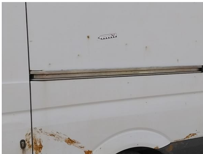
2: Qtr Panel nsr Rusted Over 5mm