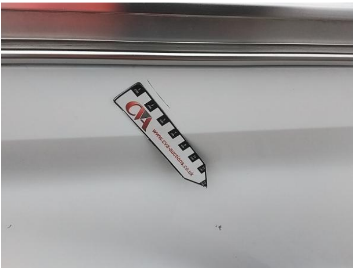
5: Qtr Panel nsr Scratched Over 25mm Thru Paint