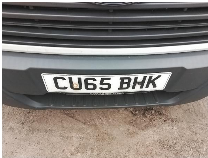
2: Number Plate Front Broken Replace