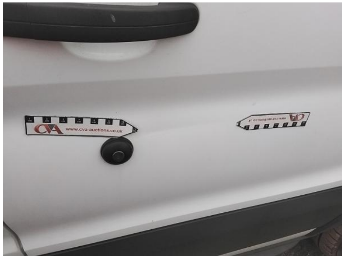
6: Door osf Dented Over 30mm