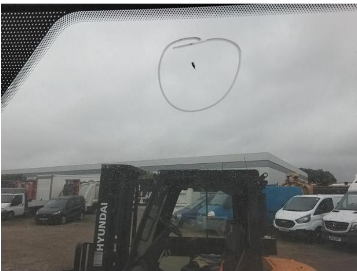
7: Screen Front Chipped Over 10mm