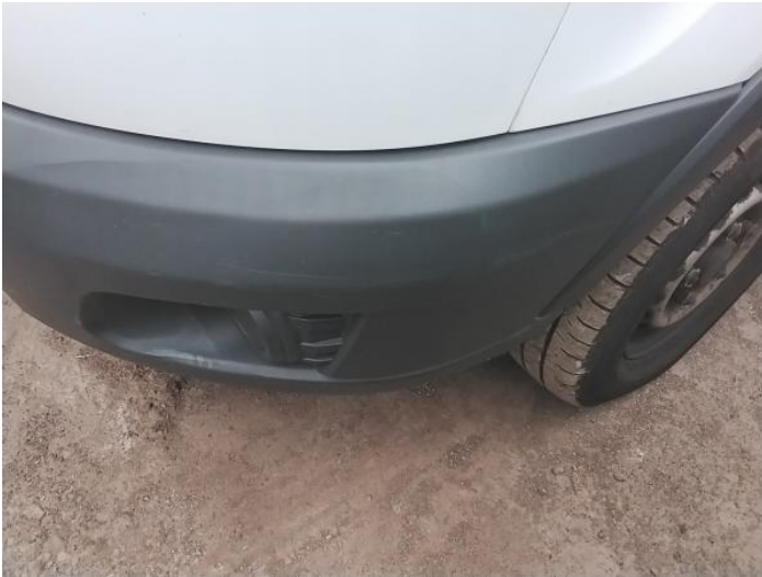
3: Bumper Front Scratched Over 100mm Thru Paint