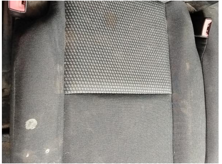
10: Seat Base Cover nsf Soiled Heavy