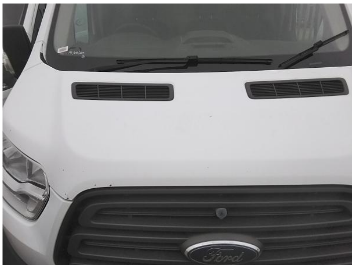
1: Bonnet Chipped Multiple Chips