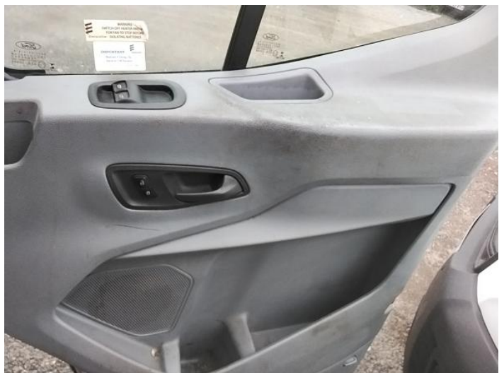
8: Door Pad osf Soiled Heavy