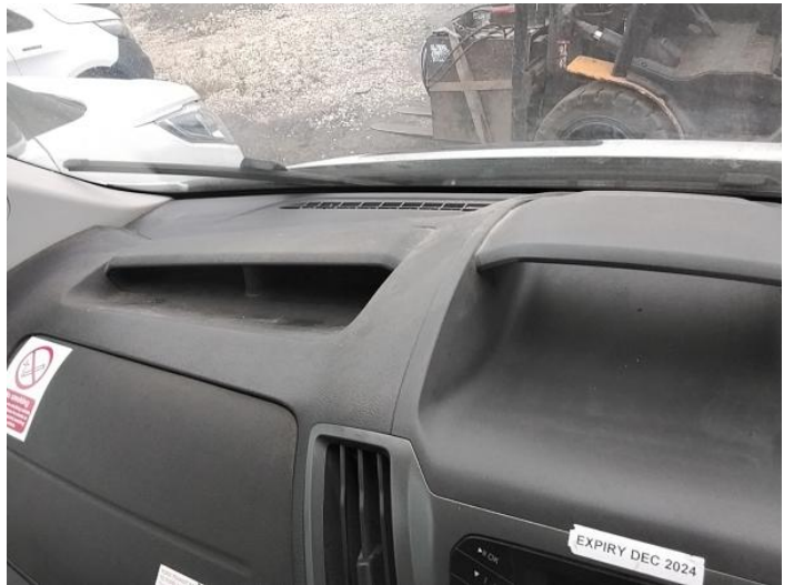
12: Fascia Panel Soiled Heavy