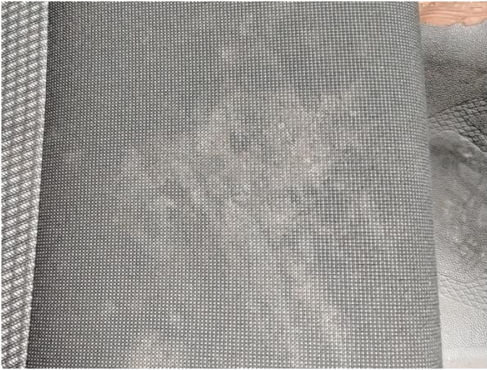
9: Seat Base Cover osf Soiled Heavy