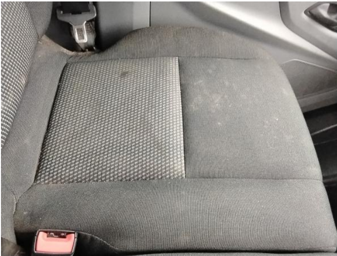
11: Seat Base Cover nsf Soiled Heavy