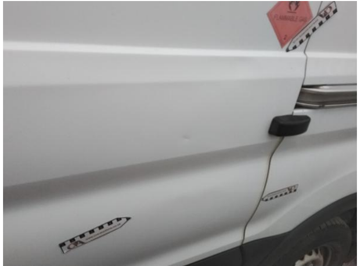
4: Qtr Panel nsr Dented With Paint Damage