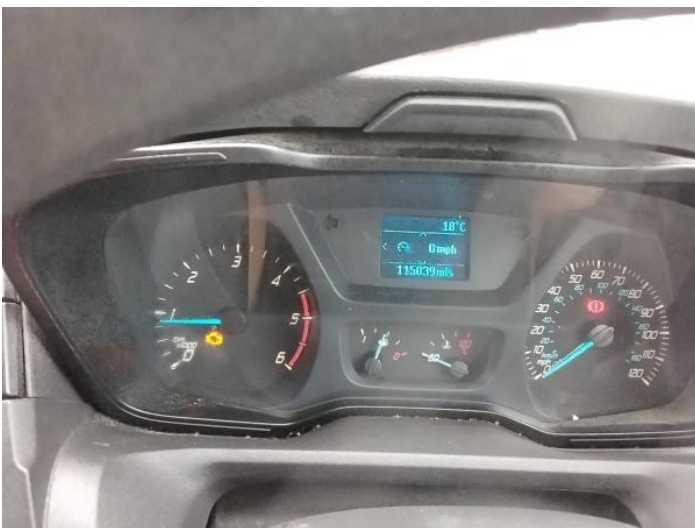
13: Dash Warning Lights Displayed No Action