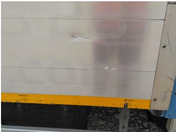
3: Qtr Panel osr Dented Over 30mm