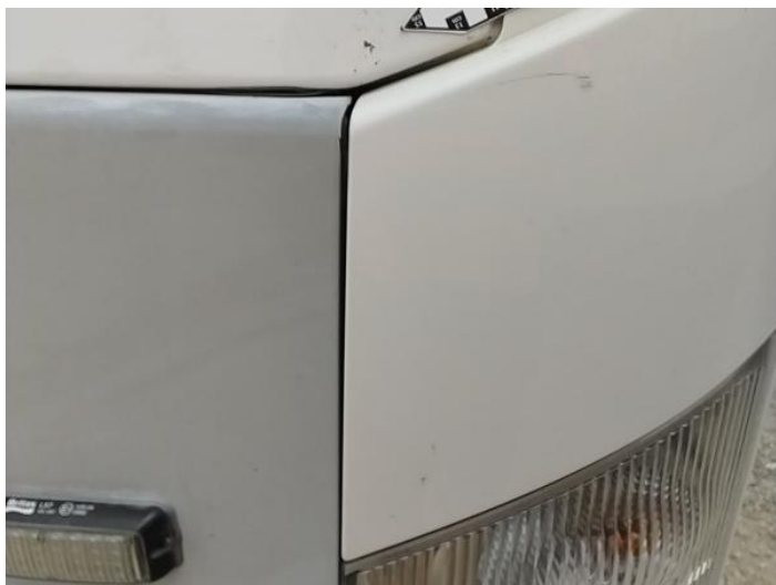
1: Bumper Front Chipped 1 To 5