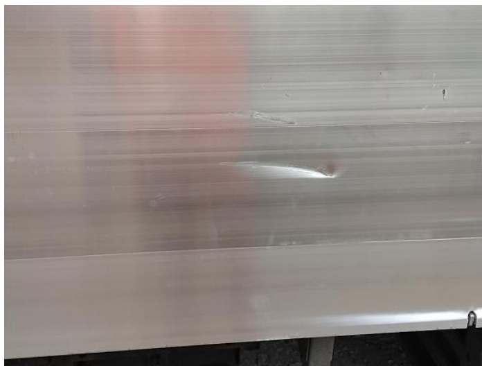
2: Qtr Panel nsr Dented Over 30mm