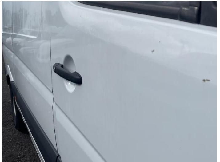
6: Door osf Dented Over 30mm