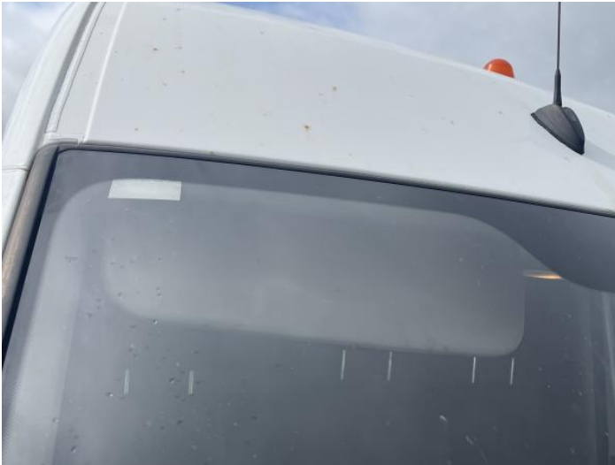
3: Roof Rusted Over 5mm