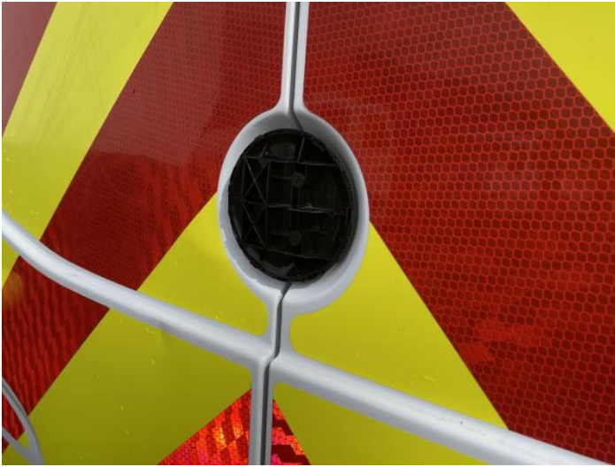
9: Badgedecal Rear Broken Replace