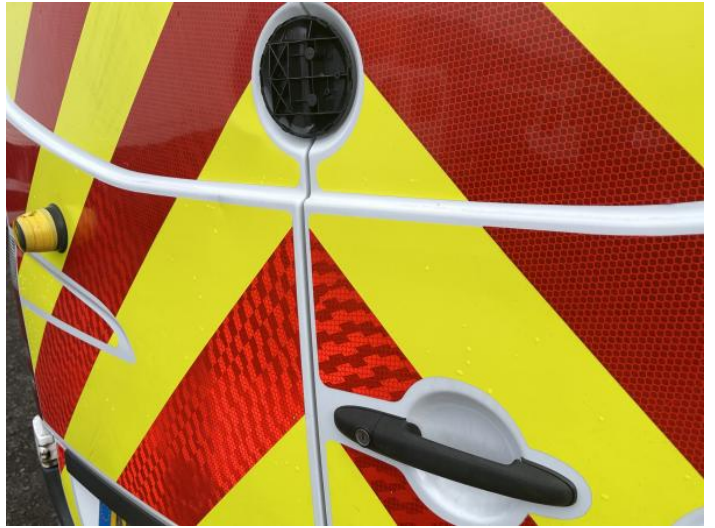
10: Tailgate Dented With Paint Damage