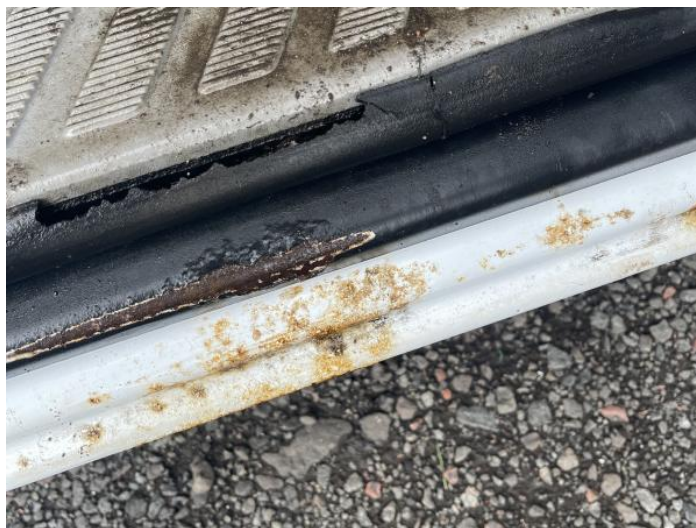
2: Sill os Rusted Over 5mm