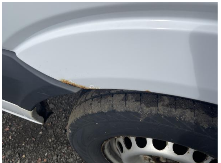
8: Qtr Panel osr Rusted Over 5mm