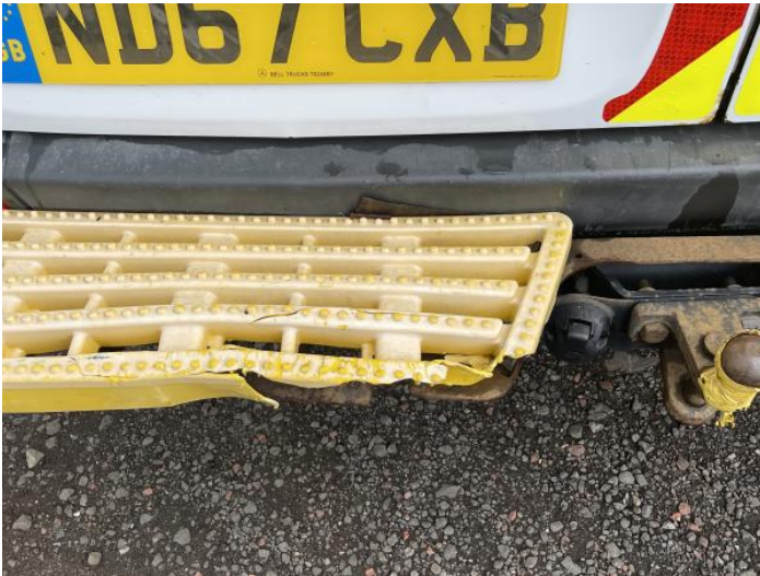
11: Bumper Rear Moulding Broken Replace