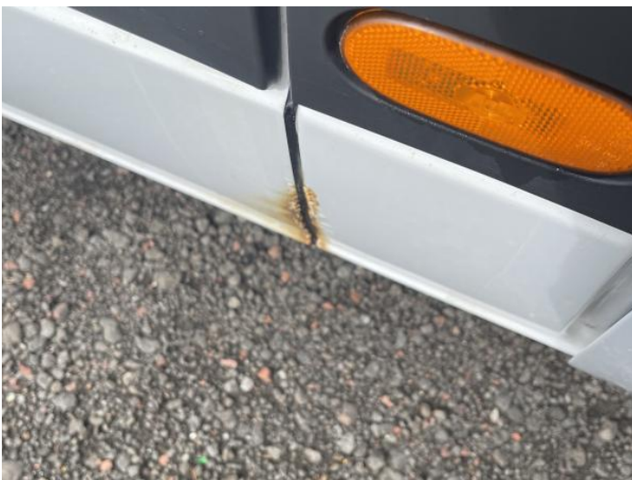
7: B Post os Rusted Over 5mm