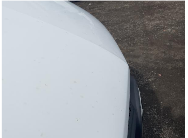
4: Bonnet Dented With Paint Damage