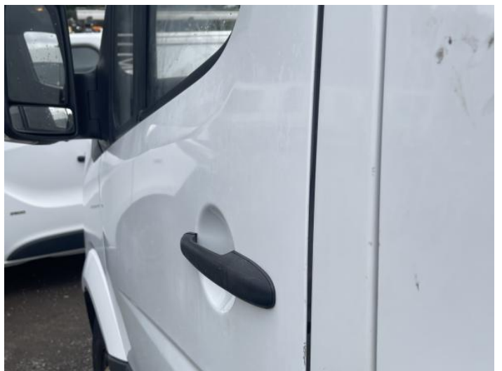
14: Door nsr Dented Over 30mm