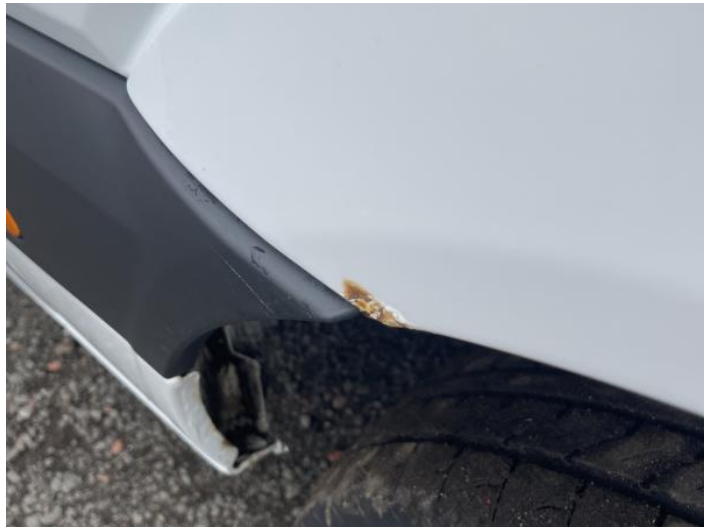
12: Qtr Panel nsr Rusted Over 5mm