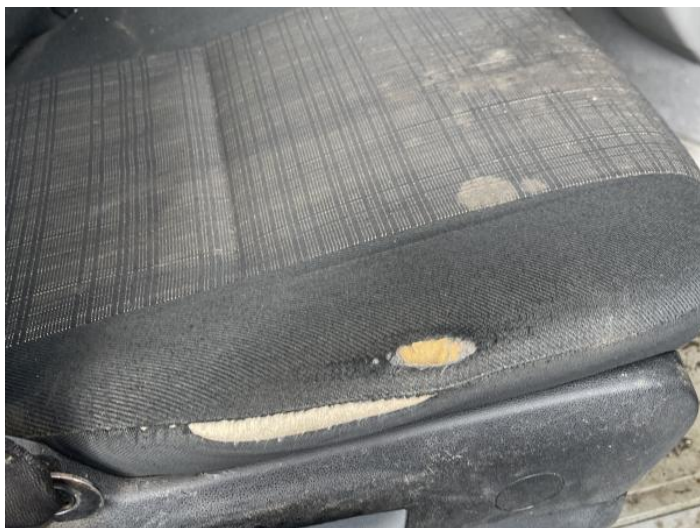
1: Seat Base Cover osf Torn Over 3mm