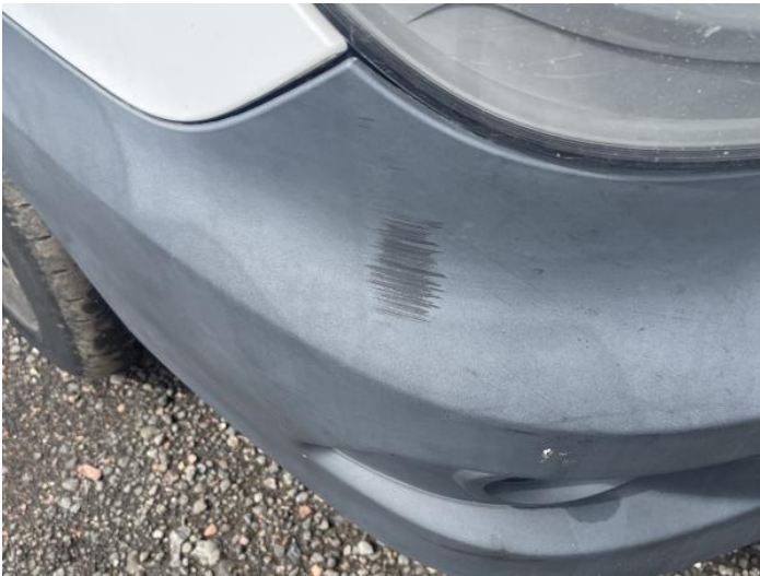
5: Bumper Front Moulding Scuffed (Unpainted) Over 100mm