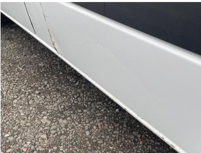
13: Door nsr Dented Over 30mm