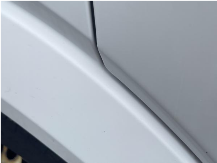
15: Wing nsf Rusted Over 5mm