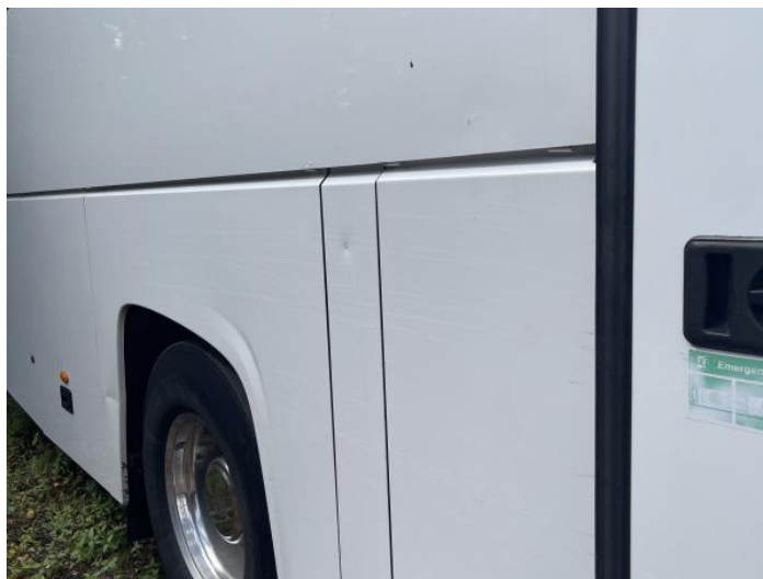
2: Qtr Panel osr Dented With Paint Damage