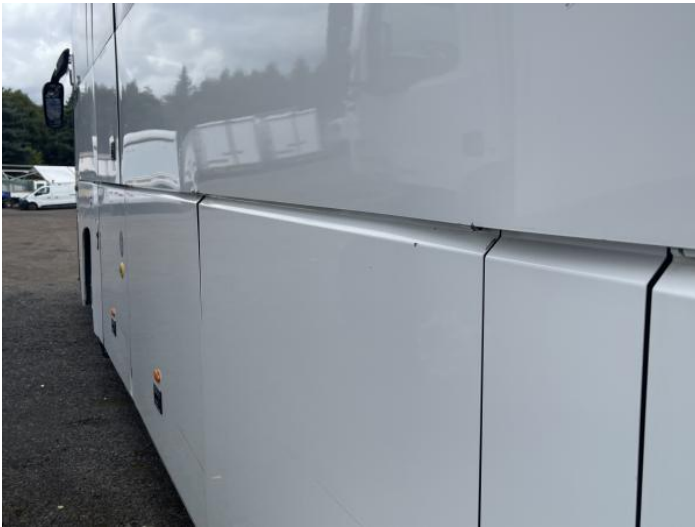
5: Qtr Panel nsr Dented With Paint Damage