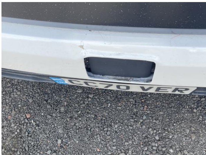
1: Bumper Front Cracked Over 25mm