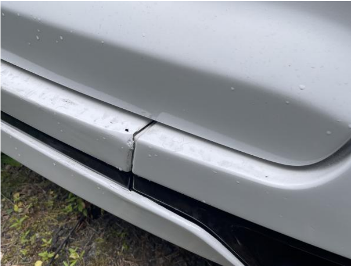
4: Bumper Rear Dented With Paint Damage