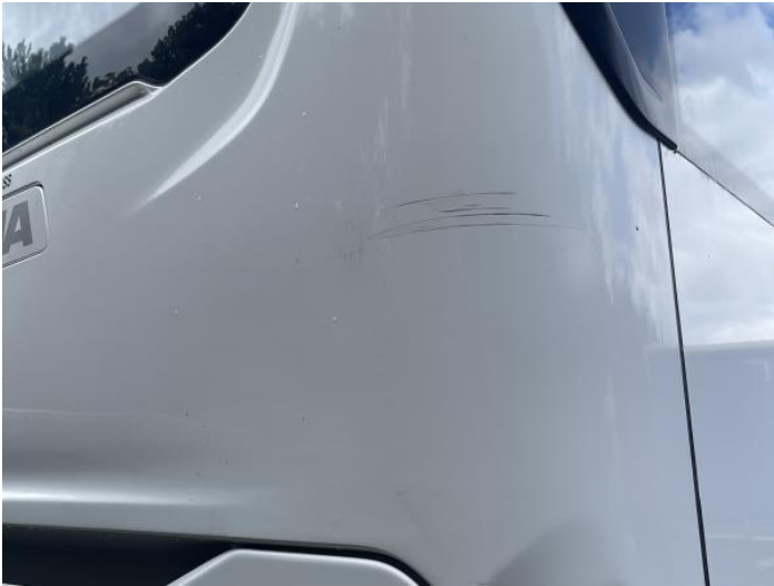
3: Tailgate Dented With Paint Damage