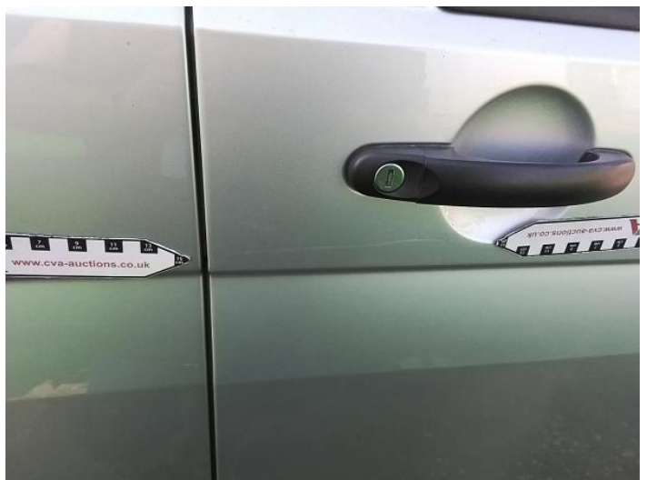
14: Door osf Scratched Over 25mm Thru Paint