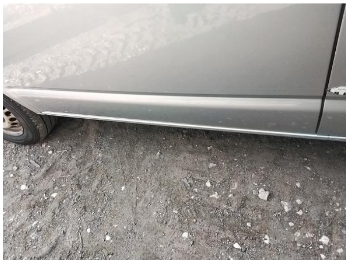
8: Qtr Panel osr Scratched Over 25mm Thru Paint