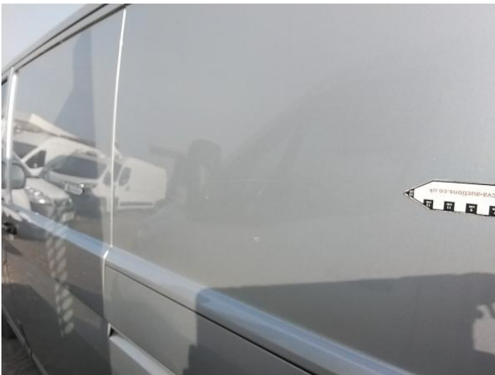
5: Qtr Panel nsr Scratched Over 25mm Thru Paint