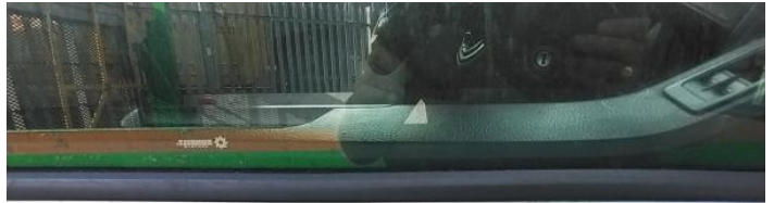
10: Door osf Chipped Multiple Chips