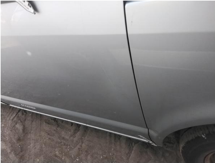
3: Qtr Panel nsr Scratched Over 25mm Thru Paint