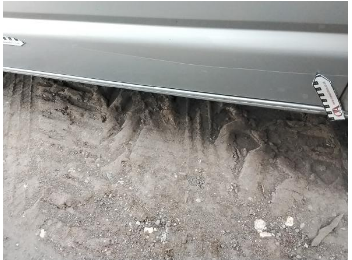
4: Qtr Panel nsr Scratched Over 25mm Thru Paint