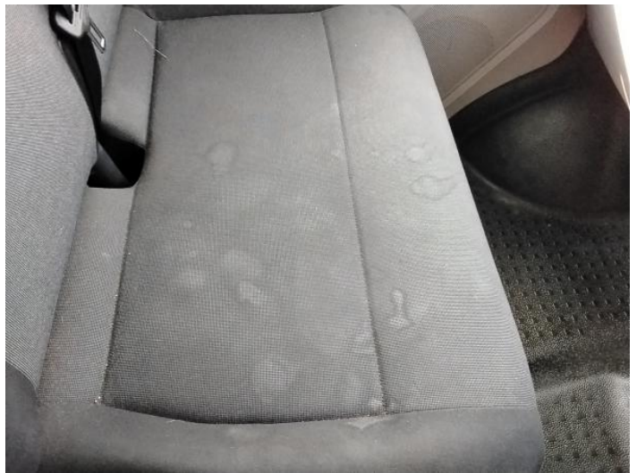
12: Seat Base Cover nsf Soiled Heavy