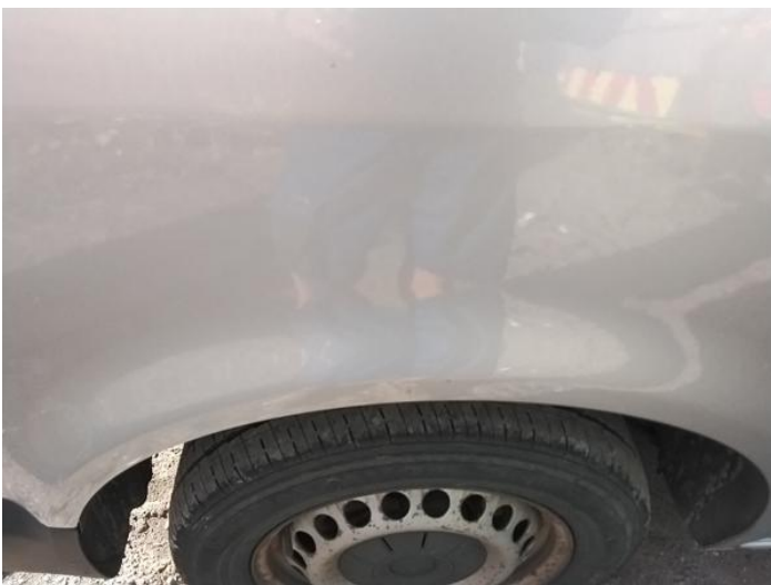
7: Qtr Panel osr Chipped Multiple Chips