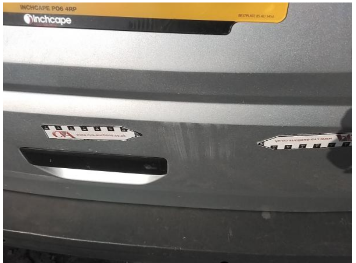
6: Tailgate Dented With Paint Damage