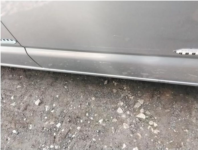
9: Door osf Scratched Over 25mm Thru Paint