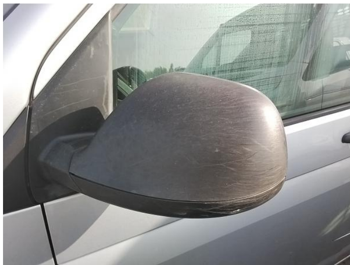
2: Door Mirror Assy nsf Scuffed (Unpainted) Over 100mm