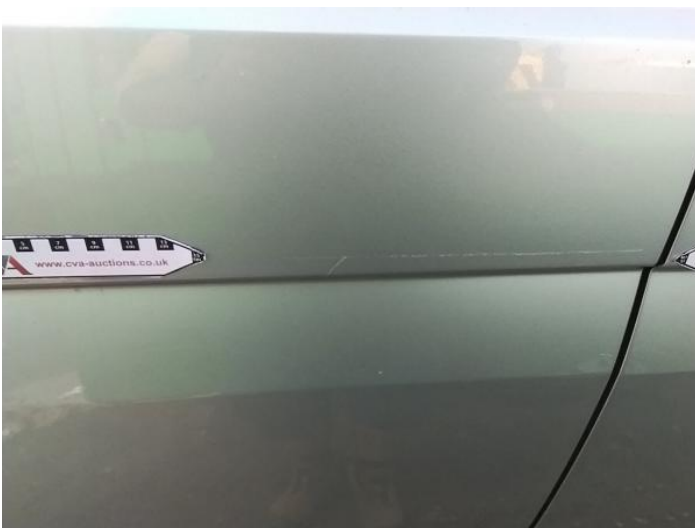
13: Qtr Panel osr Scratched Over 25mm Thru Paint