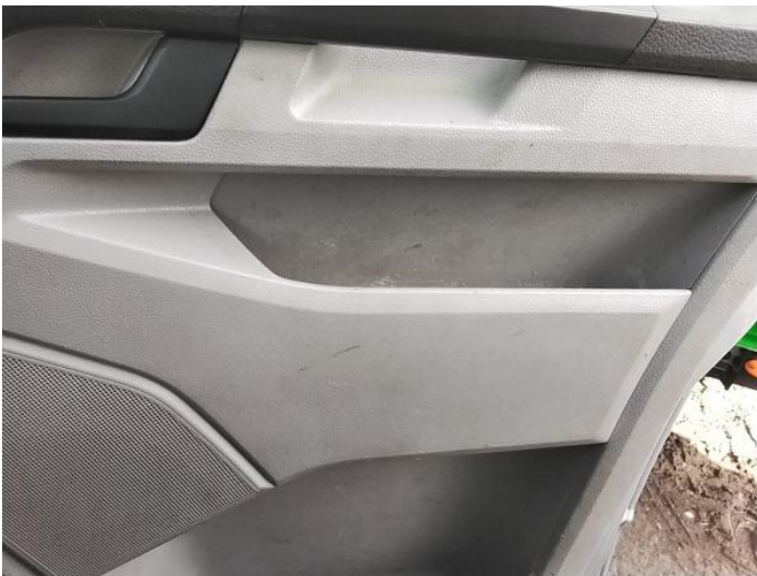
11: Door Pad osf Soiled Heavy