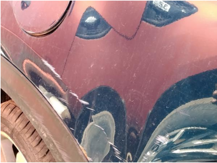
9: Qtr Panel osr Scratched Rusted