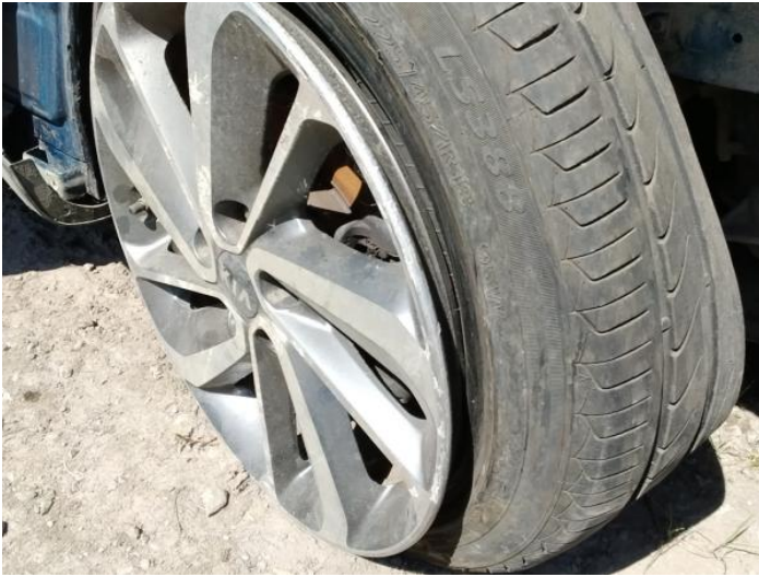
3: Wheel nsf Damaged Replace