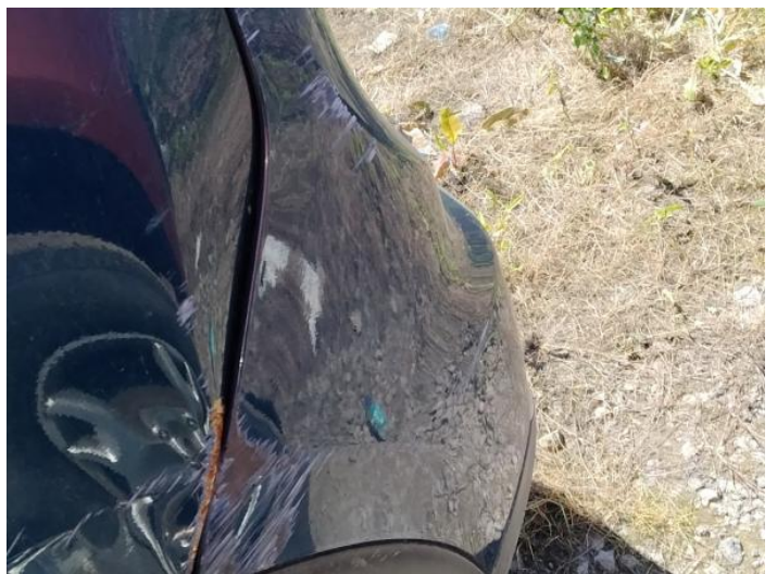
8: Bumper Rear Dented With Paint Damage