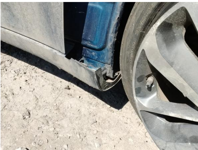
7: Sill Panel Trim ns Broken Replace