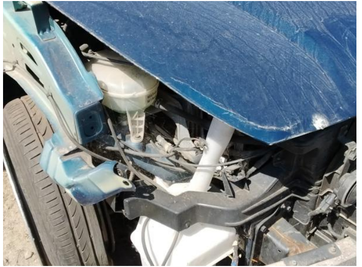
4: Headlamp ns Missing Replace