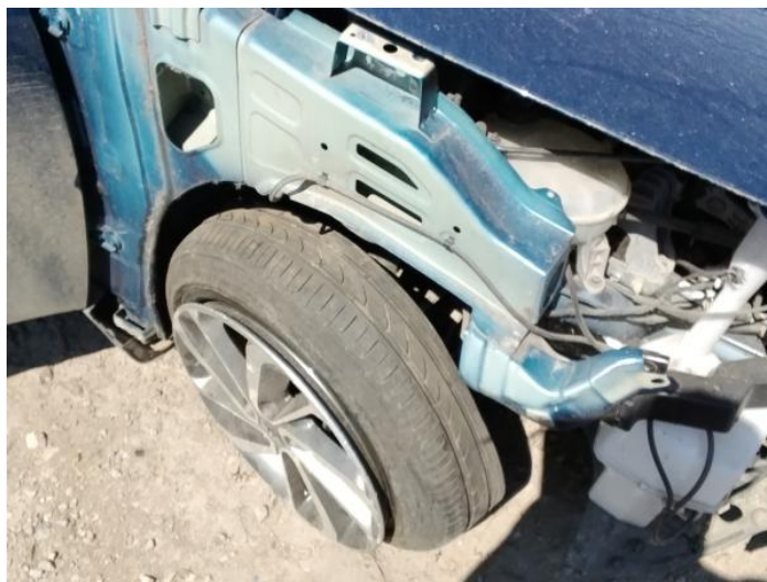
2: Wing nsf Missing Replace