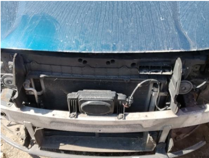
5: Bumper Front Grill Missing Replace