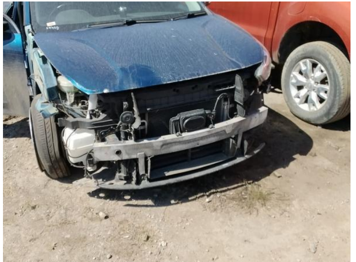
6: Bumper Front Missing Replace