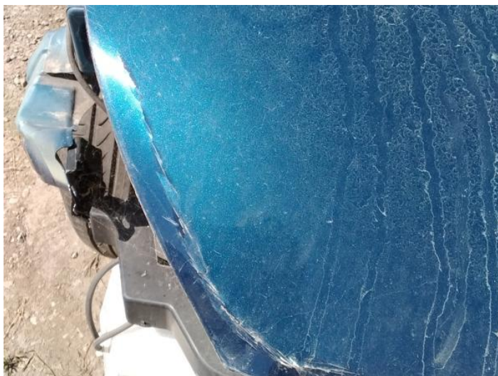
1: Bonnet Cracked Replace