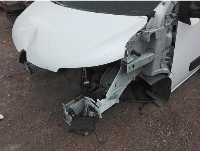
3: Unclassified Major Parts Missing Report Only