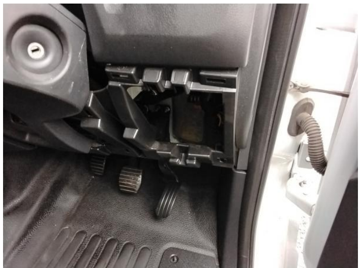
8: Fascia Panel Missing Replace