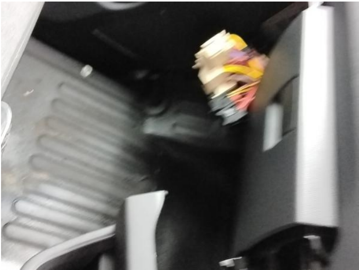
11: Fascia Panel Missing Replace