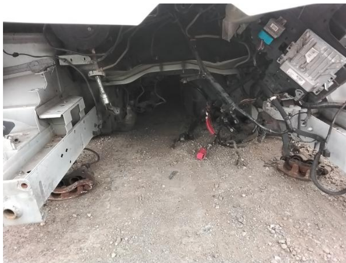
2: Unclassified Major Parts Missing Report Only