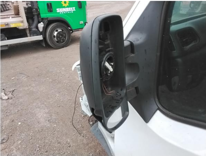
5: Door Mirror Assy nsf Broken Replace