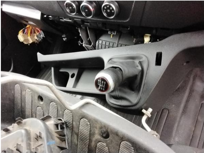
10: Fascia Panel Broken Replace