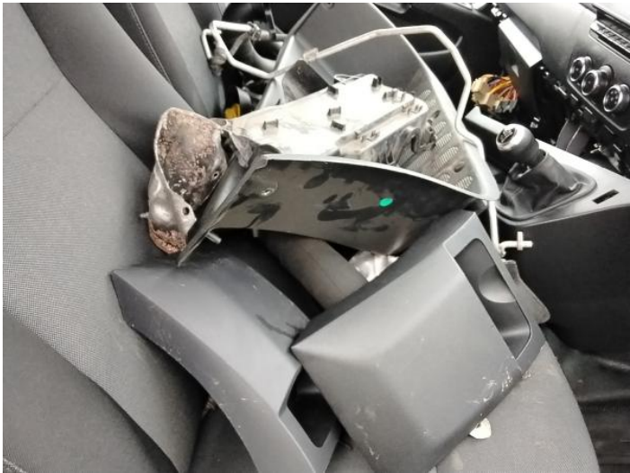
12: General Interior Soiled Light