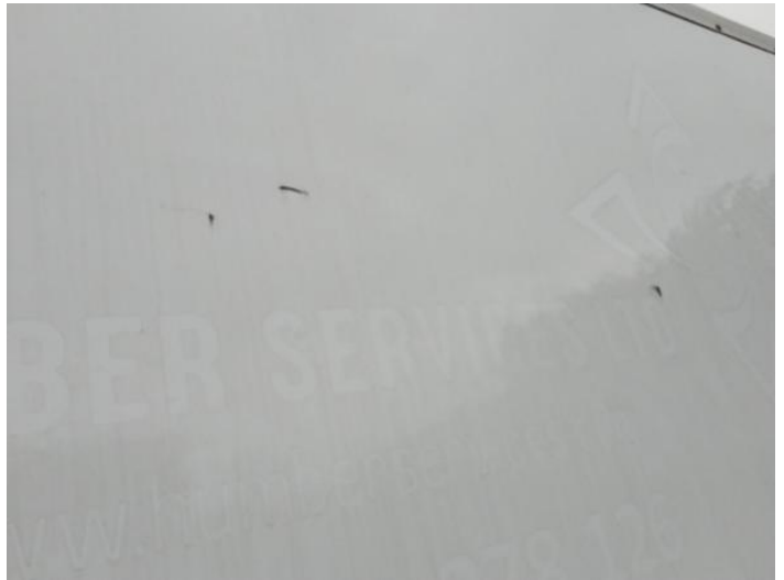
6: Qtr Panel nsr Cracked Replace