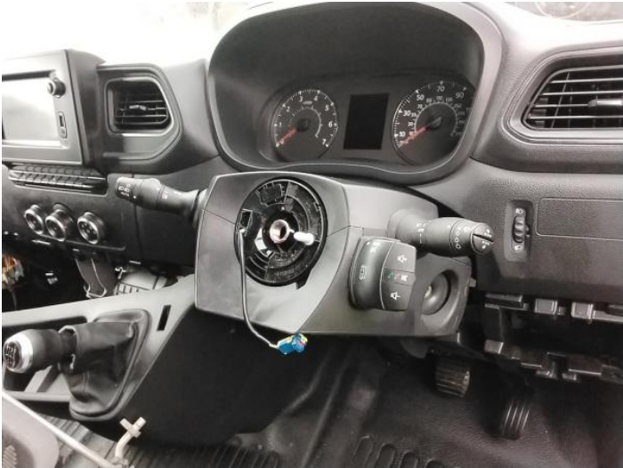
9: Steering Wheel Missing Replace