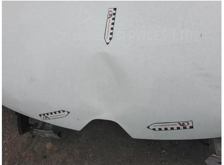
4: Bonnet Dented Over 30mm