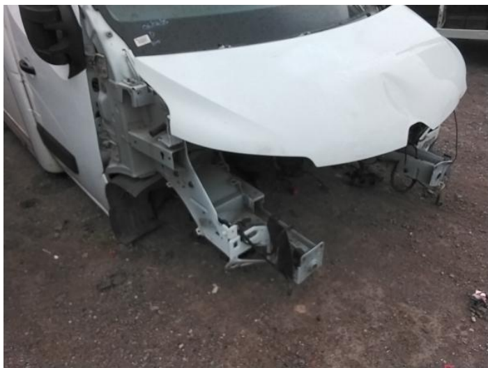
1: Unclassified Major Parts Missing Report Only