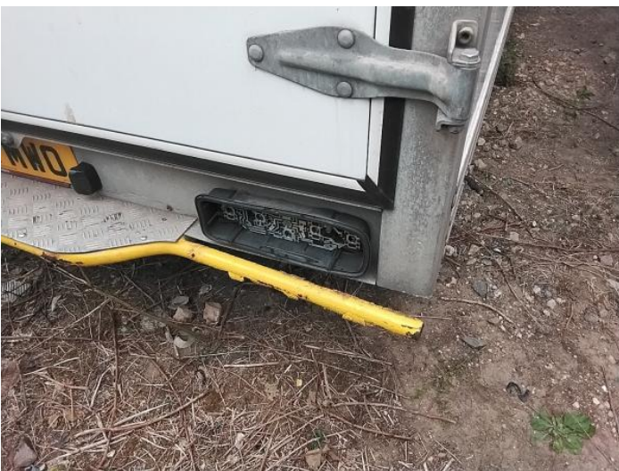
7: Lamp osr Missing Replace