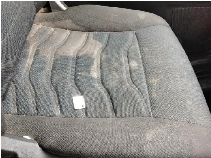
15: Seat Base Cover nsf Soiled Heavy