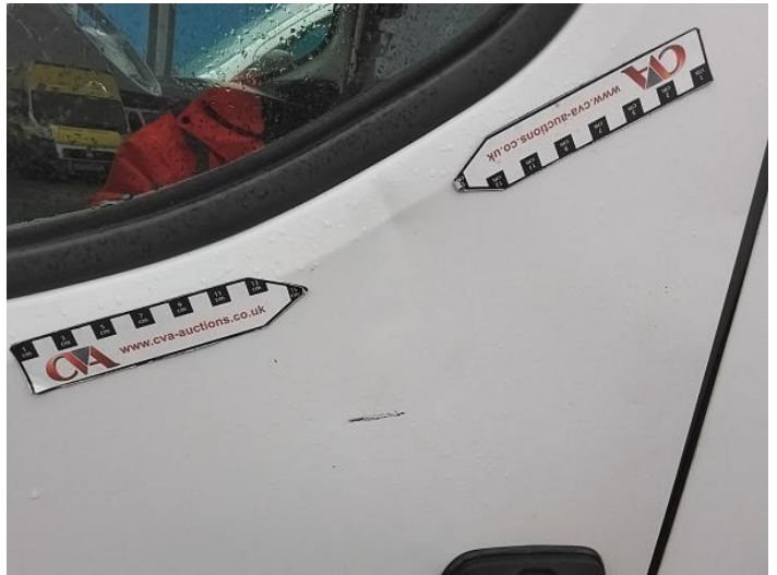
6: Door nsf Dented Over 30mm