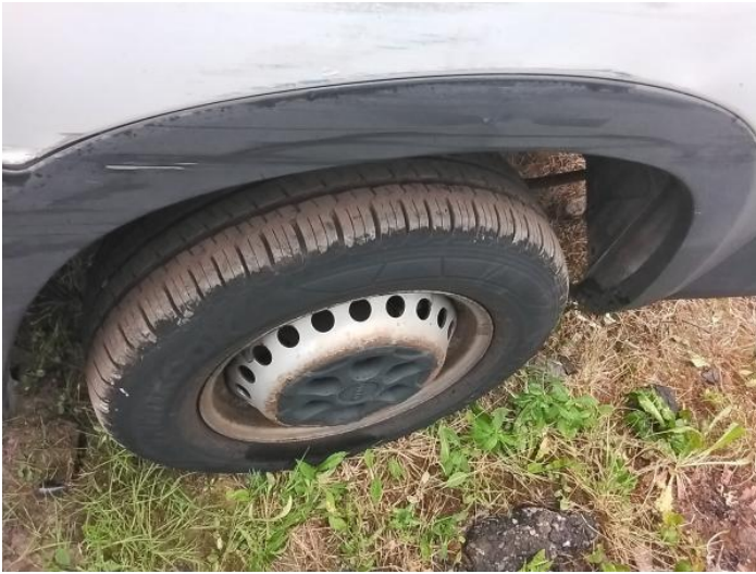
9: Qtr Panel Moulding ns Scuffed (Unpainted) Over 100mm