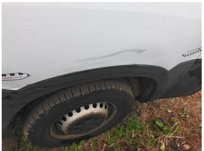
8: Qtr Panel nsr Dented With Paint Damage