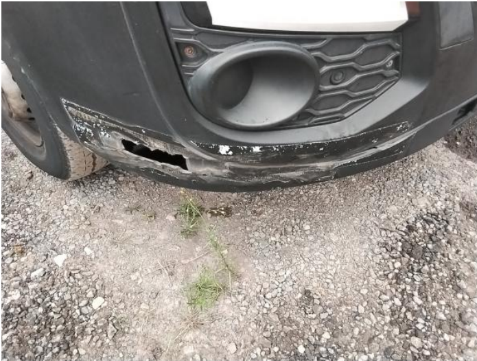
3: Bumper Front Hole Over 25mm