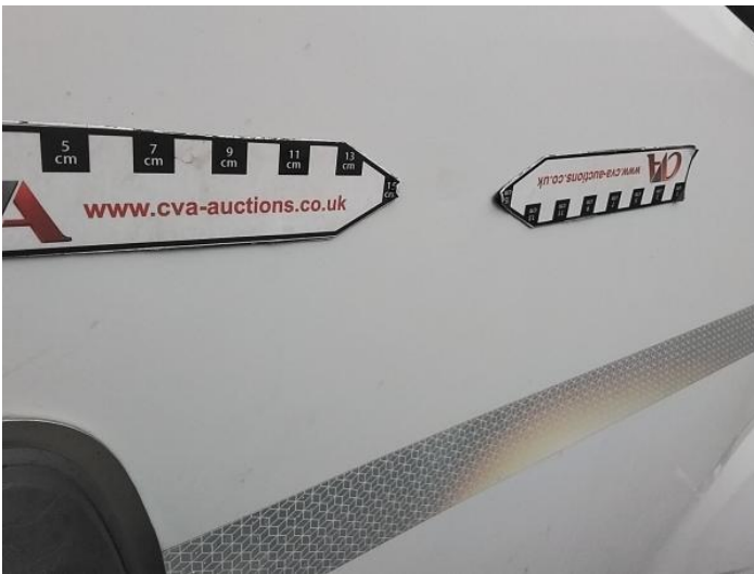
11: Door osf Dented Over 30mm