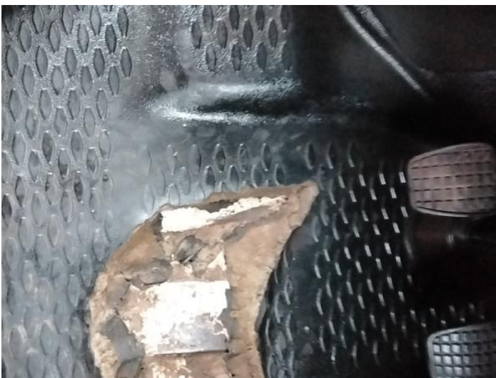
13: Carpets Front Holed Over 3mm