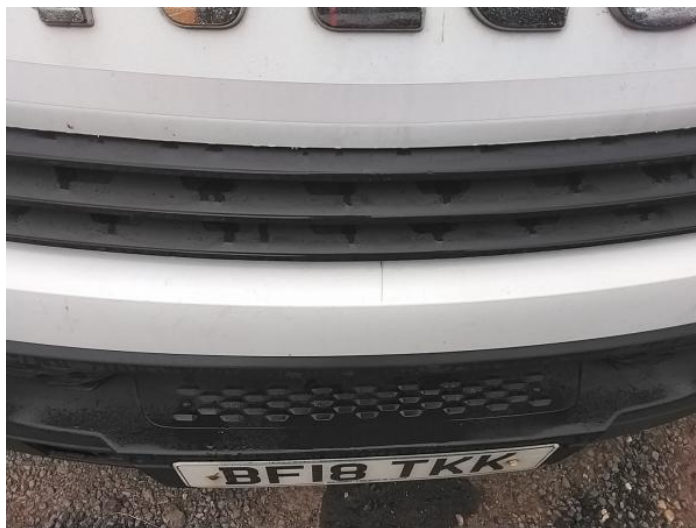
2: Panel Front Cracked Replace