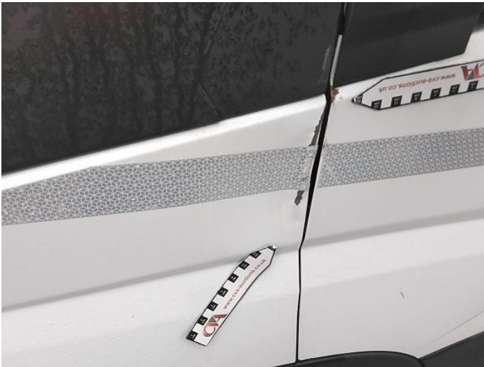
5: Wing nsf Dented With Paint Damage