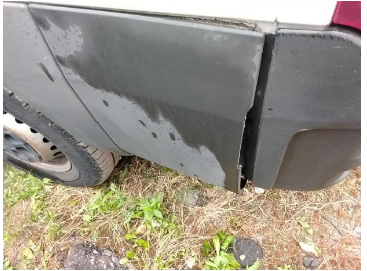
10: Qtr Panel Moulding ns Broken Replace