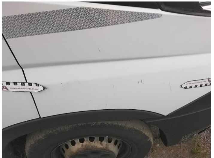
12: Wing osf Scratched Over 25mm Thru Paint