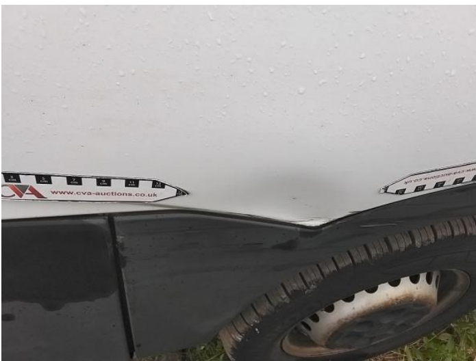
7: Qtr Panel nsr Dented With Paint Damage