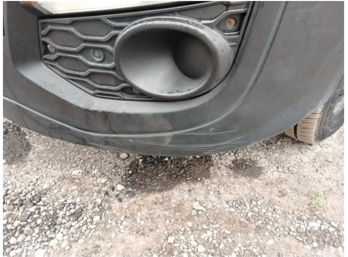
4: Bumper Front Scratched Over 100mm Thru Paint