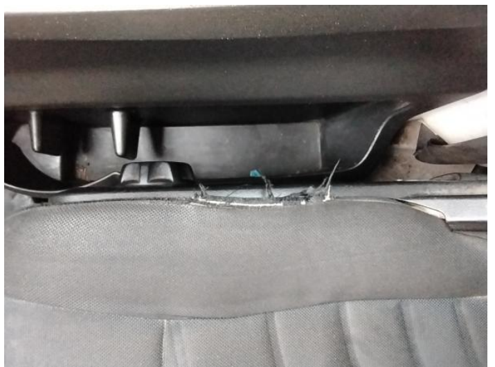
14: Seat Base Cover osf Torn Over 3mm