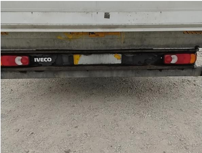
5: Bumper Rear Rusted Over 5mm