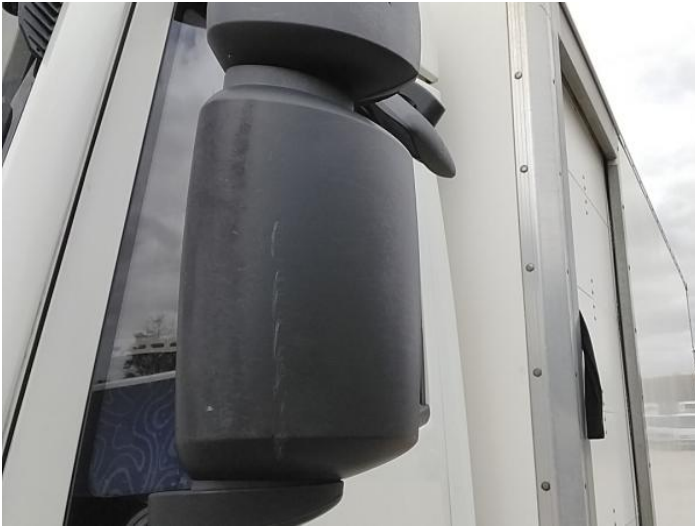
3: Door Mirror Assy nsf Scuffed (Unpainted) UpTo 100mm