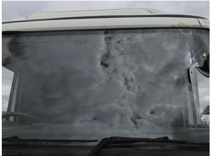
4: Screen Front Chipped UpTo 10mm