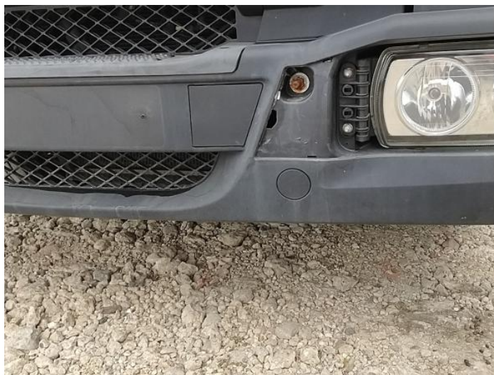
2: Other N/A N/A