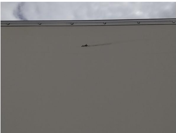
7: Qtr Panel osr Scratched UpTo 25mm Thru Paint