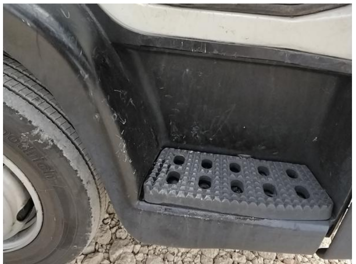
8: Other N/A N/A