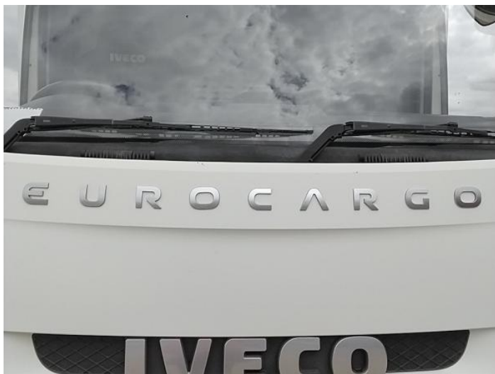
1: Bonnet Scratched UpTo 25mm Thru Paint