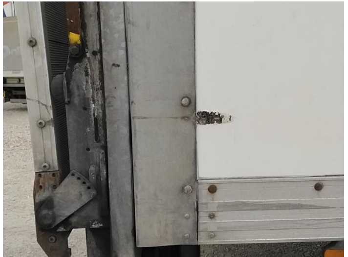
6: Qtr Panel osr Scratched UpTo 25mm Thru Paint