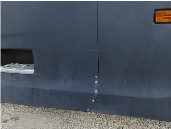
7: Other N/A N/A