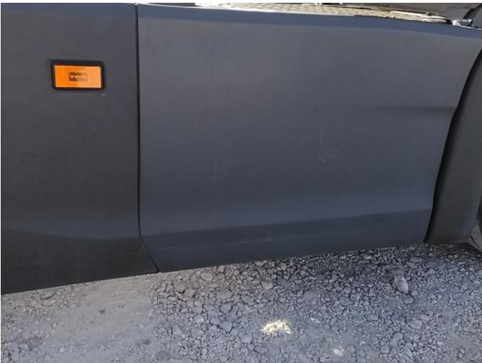
8: Other N/A N/A