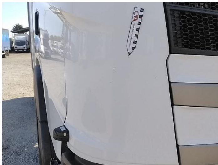
2: Wing osf Chipped 1 To 5