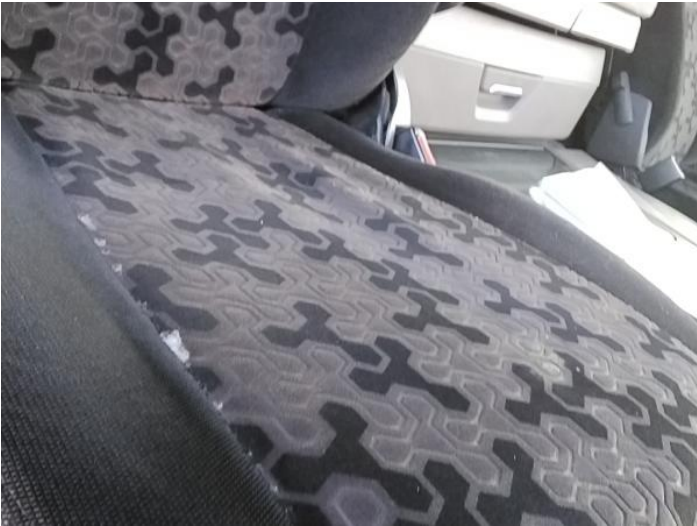
10: Seat Base Cover osf Holed Over 3mm