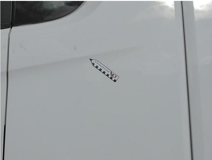
6: Qtr Panel nsr Scratched UpTo 25mm Thru Paint