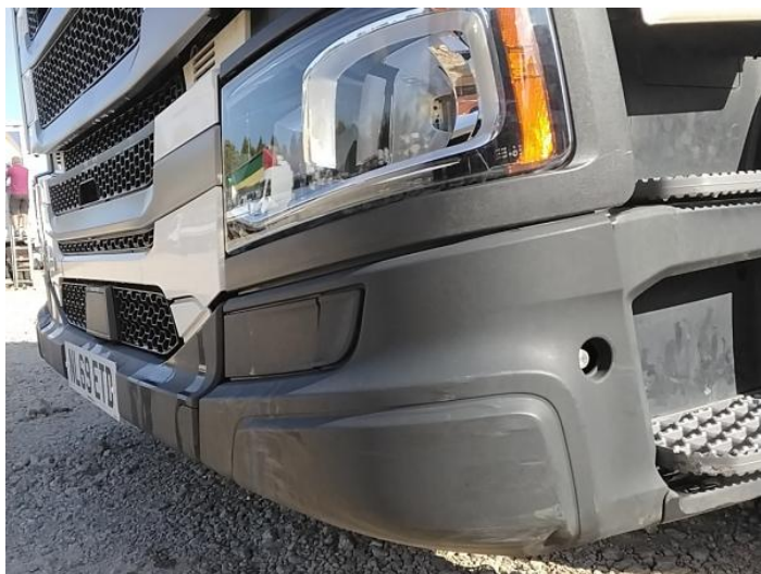
1: Bumper Front Moulding Scuffed (Unpainted) Up To 100mm