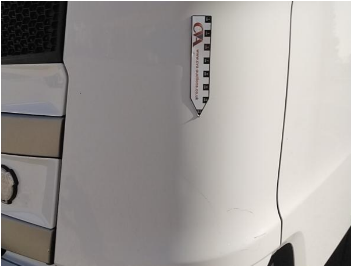
3: Wing nsf Scratched UpTo 25mm Not Thru Paint