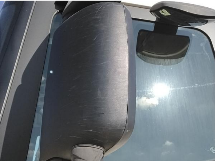
4: Door Mirror Assy nsf Scuffed (Unpainted) UpTo 100mm