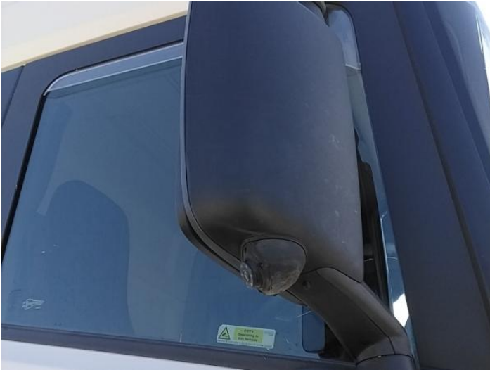
9: Door Mirror Assy osf Scuffed (Unpainted) UpTo 100mm