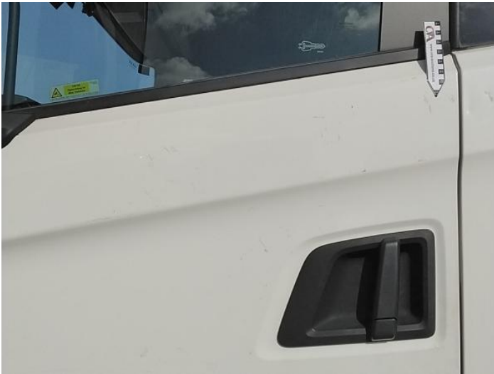
5: Door nsf Scratched Over 25mm Thru Paint