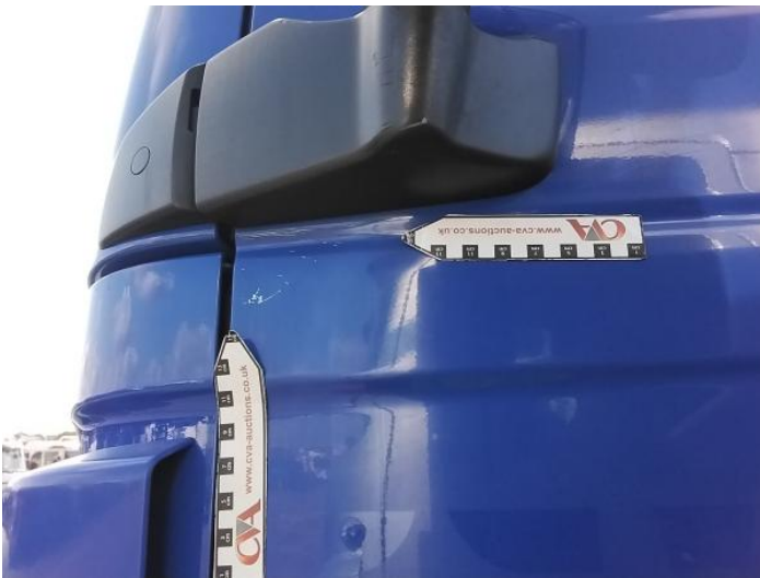
5: Door nsf Scratched Over 25mm Thru Paint