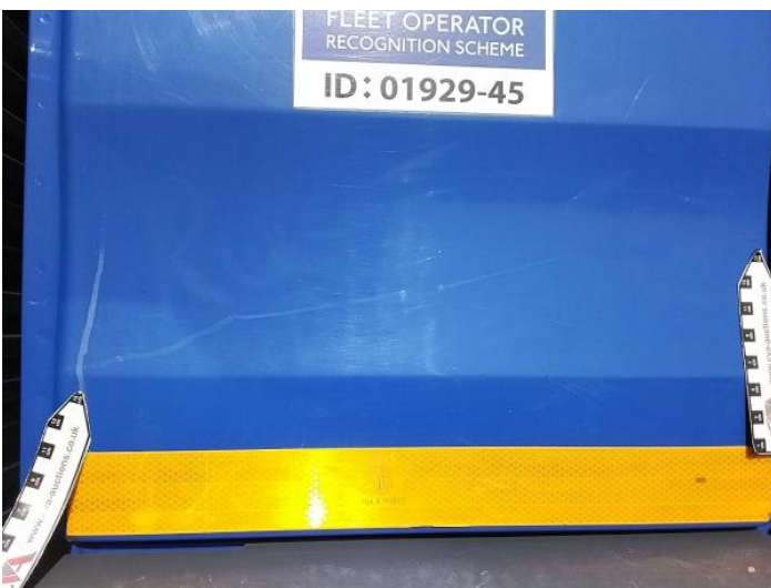
7: Qtr Panel osr Scratched Over 25mm Not Thru Paint