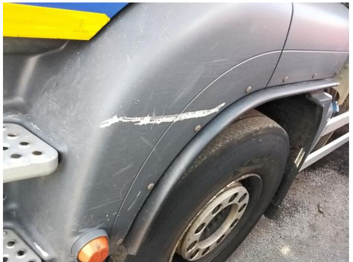
6: Wing nsf Scratched Over 25mm Thru Paint