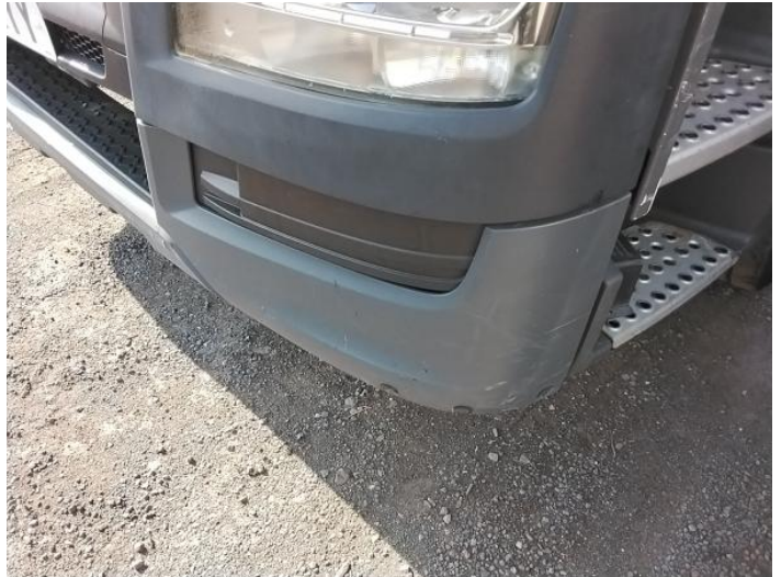
4: Bumper Front Scratched Over 100mm Thru Paint