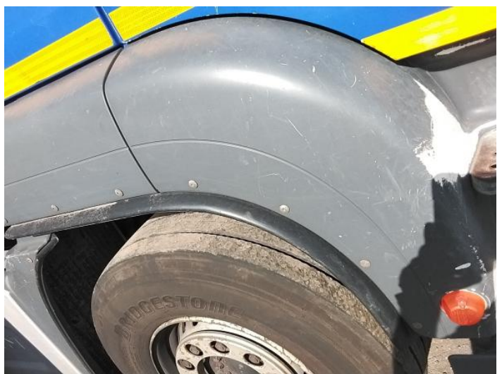
8: Wing osf Scratched Over 25mm Thru Paint