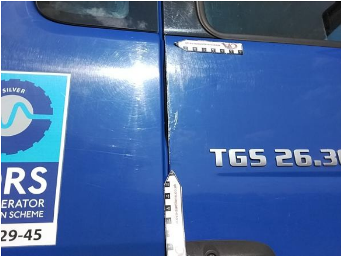
9: Door osf Dented With Paint Damage