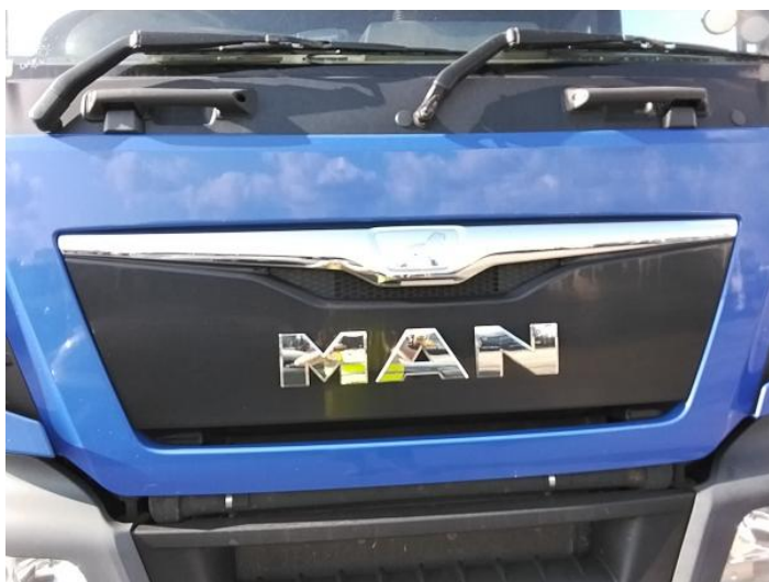
1: Bonnet Chipped Multiple Chips