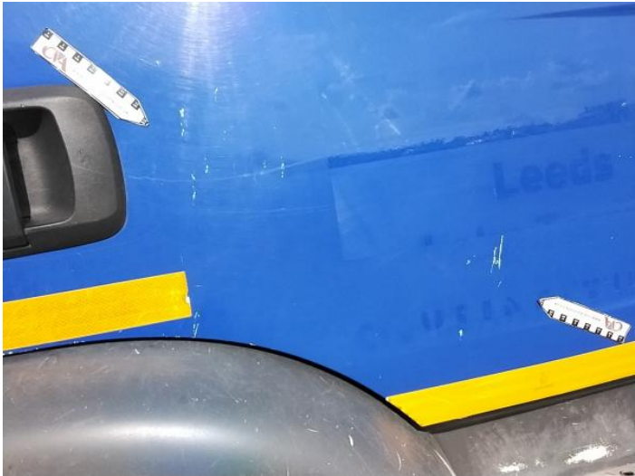
10: Door osf Scratched Over 25mm Thru Paint