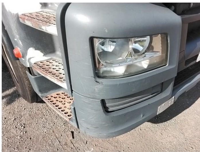
2: Bumper Front Scratched Over 100mm Thru Paint