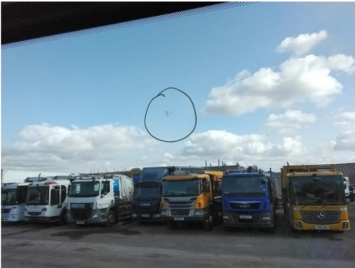
11: Screen Front Chipped Over 10mm