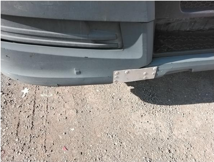
3: Bumper Front Poor Previous Repair Poor Colour