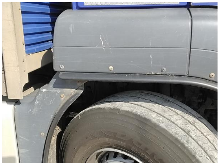
14: Other N/A N/A