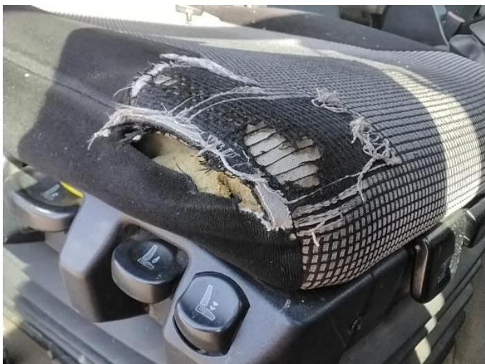
15: Seat Base Cover osf Torn Over 3mm