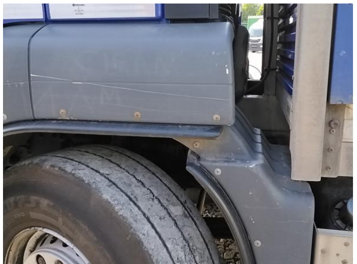
8: Other N/A N/A