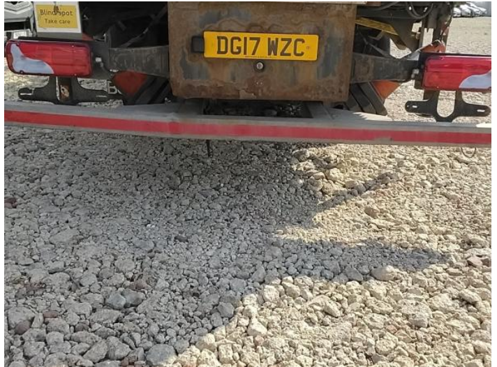
10: Bumper Rear Dented Between 10mm + 30mm