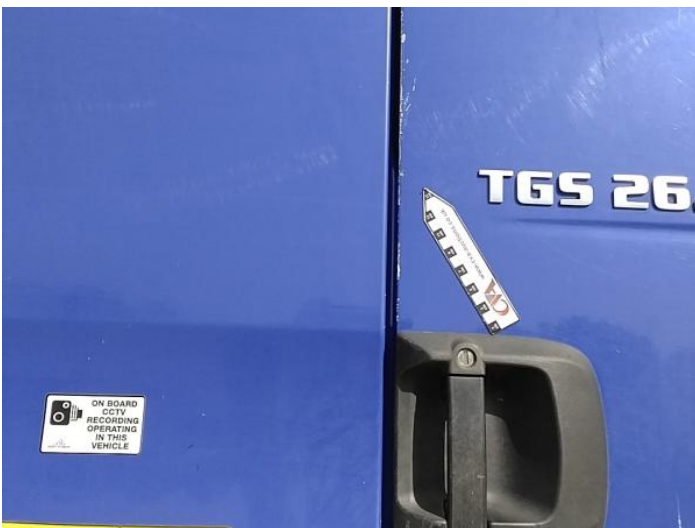
13: Door osf Chipped Edge Chip