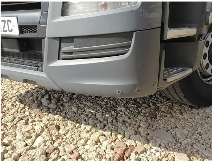
5: Bumper Front Moulding Scuffed (Unpainted) UpTo 100mm