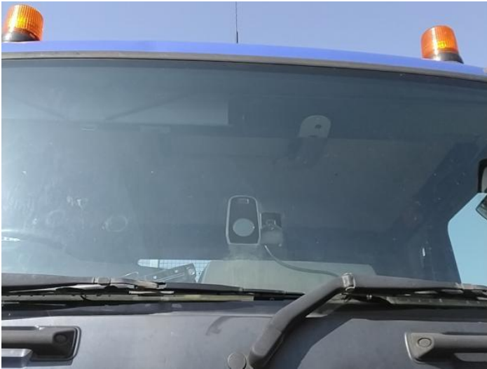
3: Screen Front Chipped UpTo 10mm