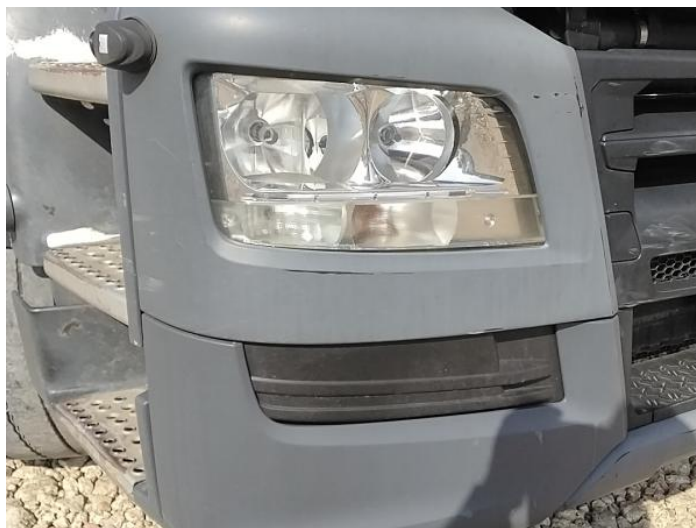
2: Fog Lamp Surround os Scuffed (Unpainted) Over 100mm