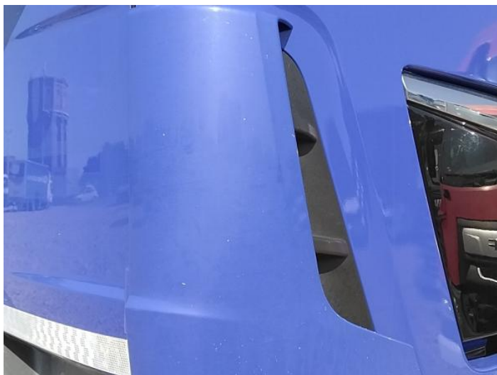
1: Wing osf Chipped Multiple Chips