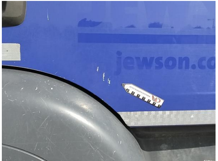
12: Door osf Scratched UpTo 25mm Thru Paint