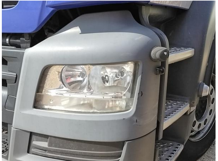
4: Fog Lamp Surround ns Scuffed (Unpainted) Over 100mm