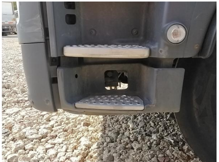
6: Other N/A N/A