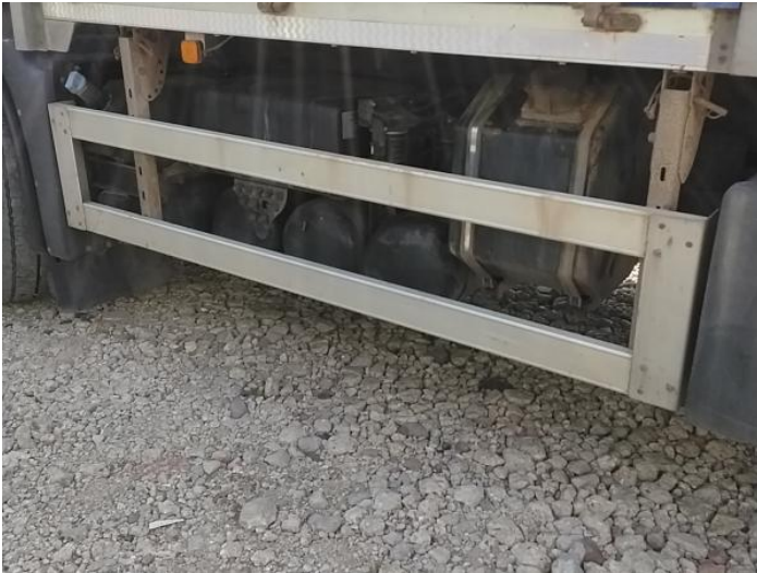
9: Other N/A N/A