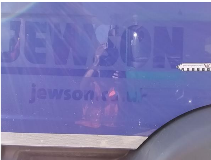
7: Door nsf Chipped Multiple Chips