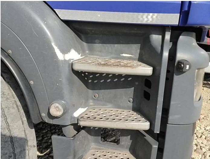
11: Other N/A N/A