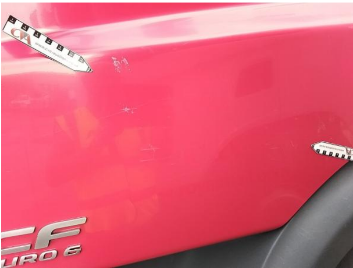
5: Door nsf Scratched Over 25mm Thru Paint