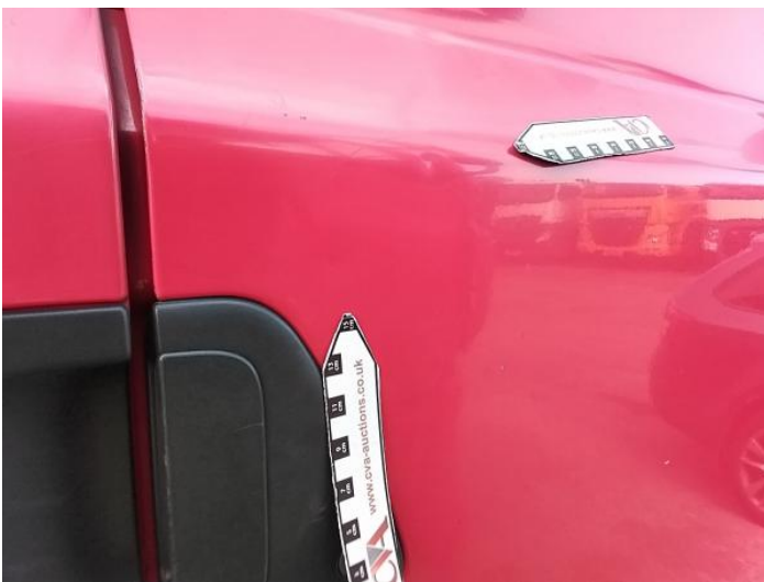
7: Door osf Dented Over 30mm