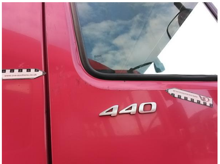
8: Door osf Scratched Over 25mm Not Thru Paint