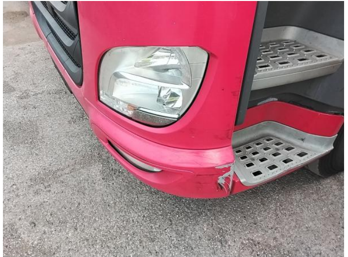
4: Bumper Front Scratched Over 100mm Thru Paint