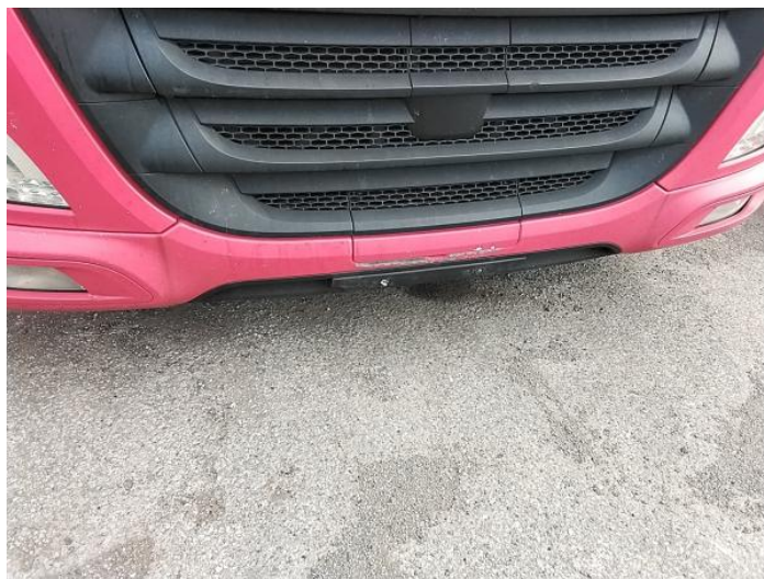
2: Bumper Front Scratched Over 100mm Thru Paint