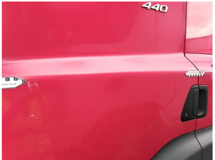
6: Door nsf Dented Over 30mm