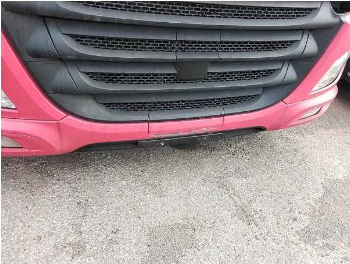
3: Number Plate Front Missing Replace