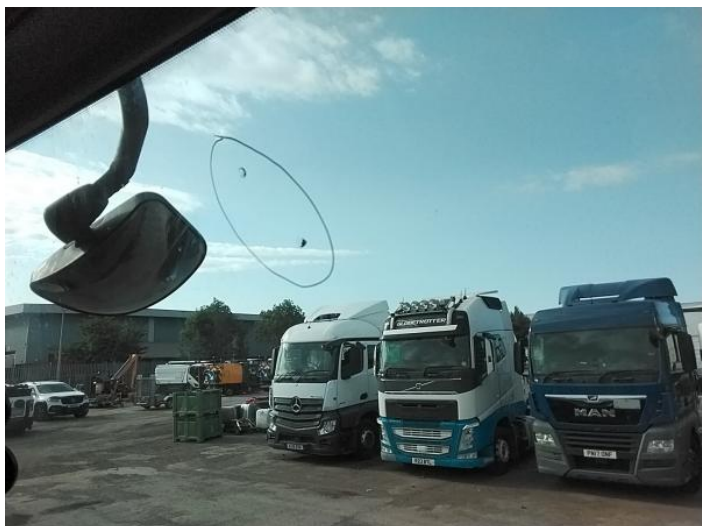
9: Screen Front Chipped Over 10mm