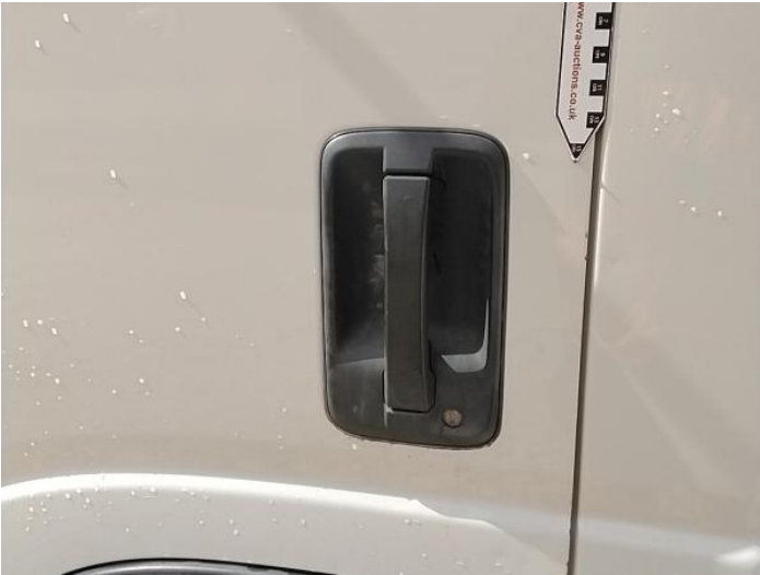
4: Door nsf Chipped Edge Chip