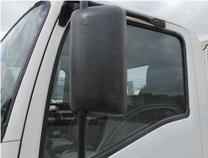
3: Door Mirror Assy nsf Scuffed (Unpainted) UpTo 100mm