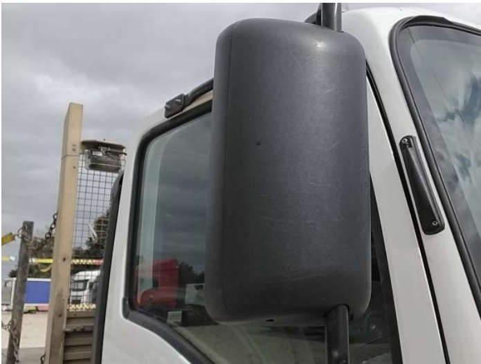
7: Door Mirror Assy osf Scuffed (Unpainted) UpTo 100mm