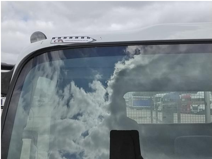
2: Other N/A N/A