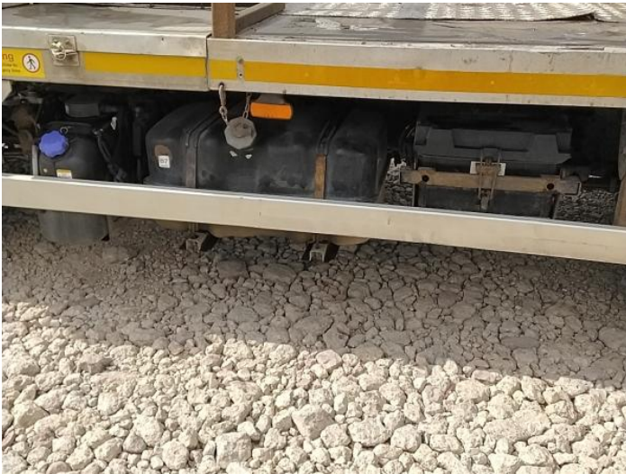
5: Other N/A N/A