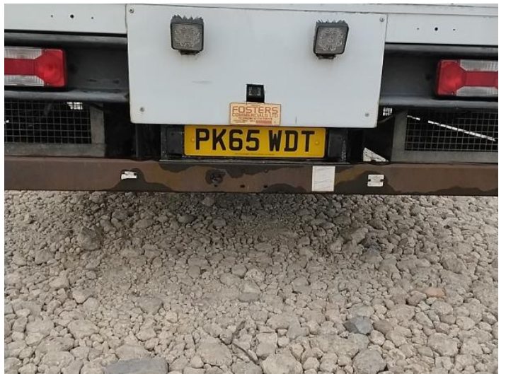
6: Bumper Rear Rusted Over 5mm