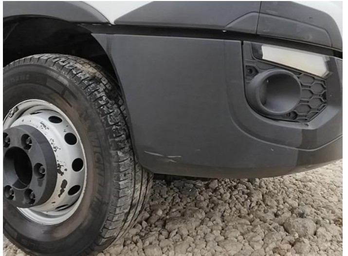
4: Bumper Front Moulding Scuffed (Unpainted) UpTo 100mm