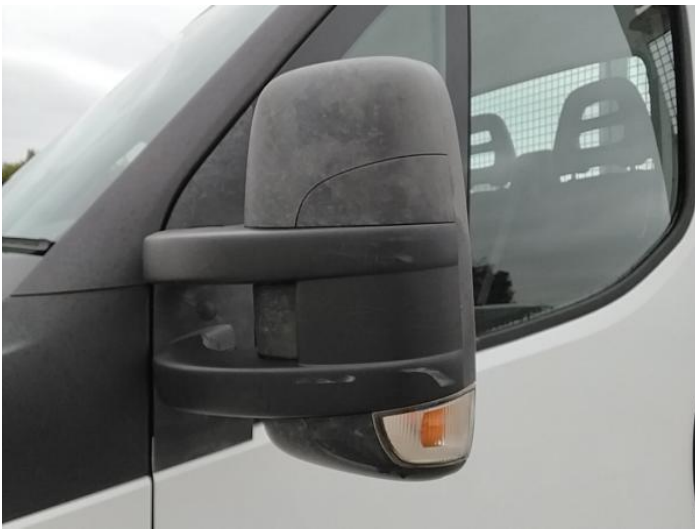
5: Door Mirror Assy nsf Scuffed (Unpainted) UpTo 100mm