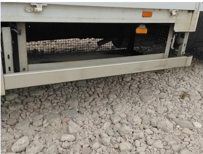
7: Other N/A N/A