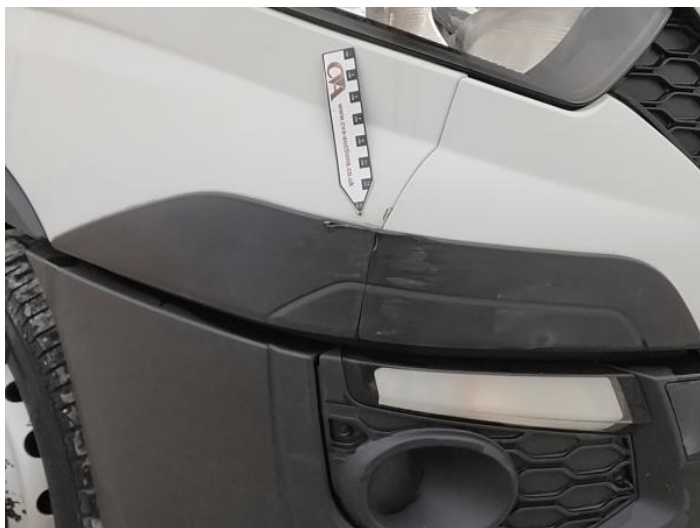
1: Moulding on Wing Scuffed (Unpainted) Up To 100mm