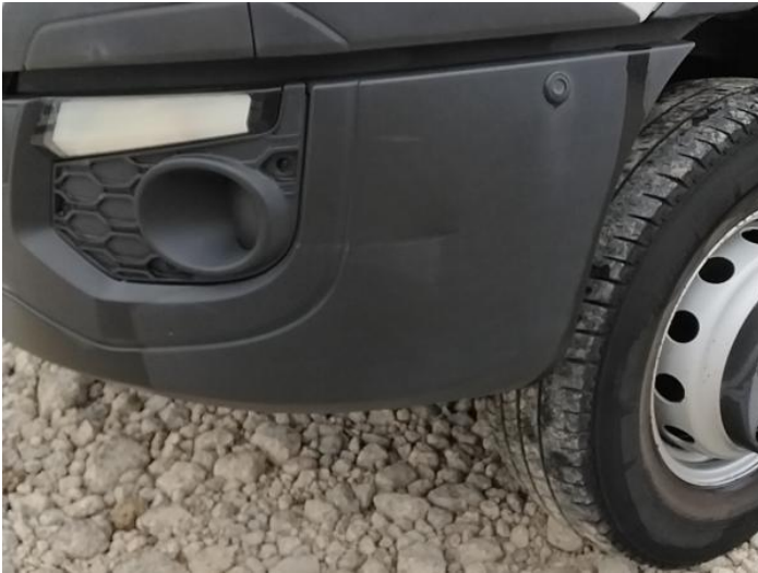
3: Bumper Front Moulding Scuffed (Unpainted) UpTo 100mm