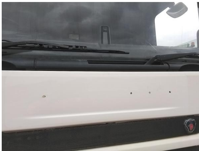
2: Bonnet Hole Over 10mm