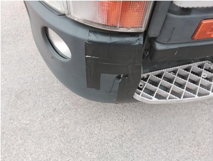
3: Bumper Front Cracked Over 25mm