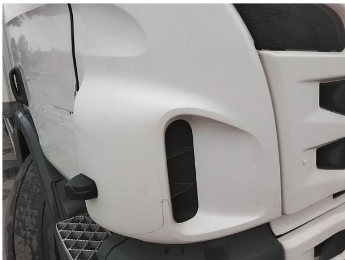
1: Panel Front Scratched Over 25mm Thru Paint