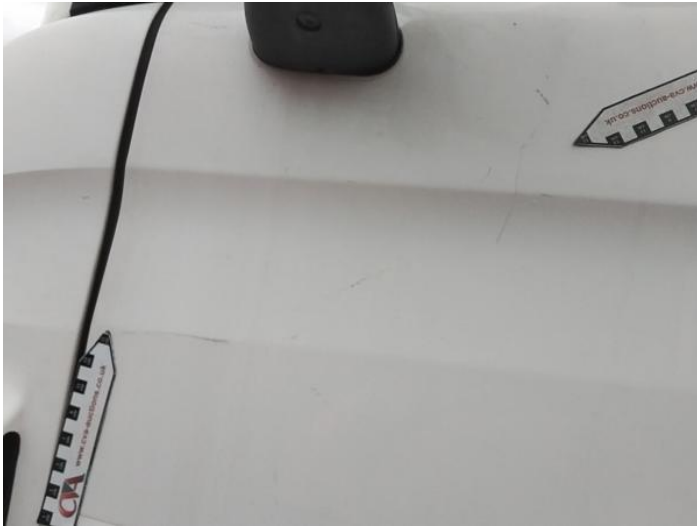
4: Door nsf Scratched Over 25mm Thru Paint