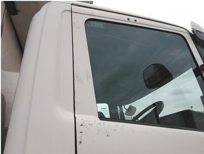
6: Door osf Scratched Over 25mm Thru Paint