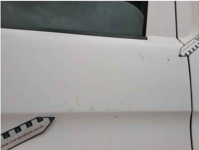
5: Door nsf Scratched Over 25mm Thru Paint