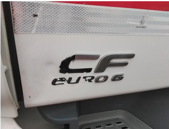
5: Badgedecal Front Broken Replace