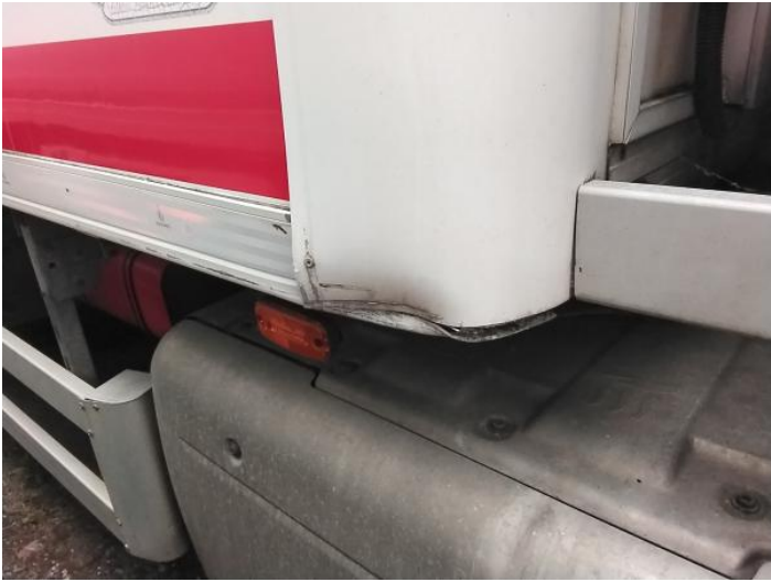
9: Qtr Panel Trim os Broken Replace