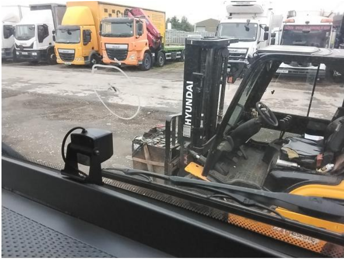
10: Screen Front Chipped Over 10mm