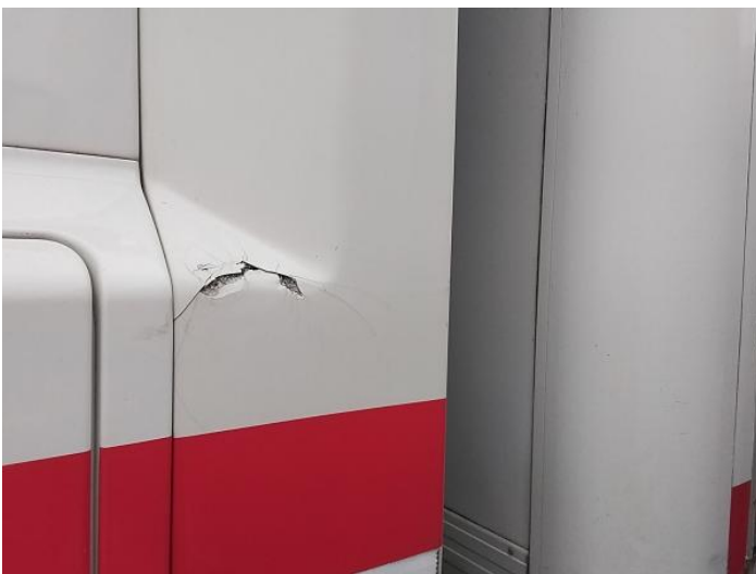
7: Qtr Panel Trim ns Broken Replace