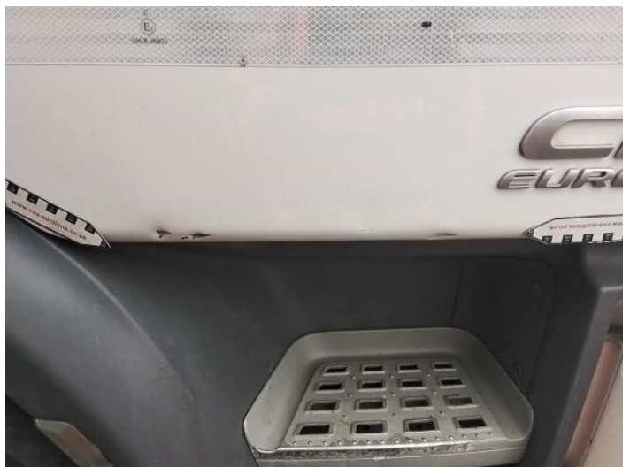
8: Door osf Dented With Paint Damage