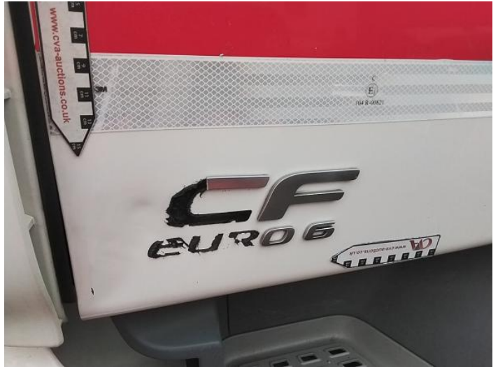
4: Door nsf Dented With Paint Damage