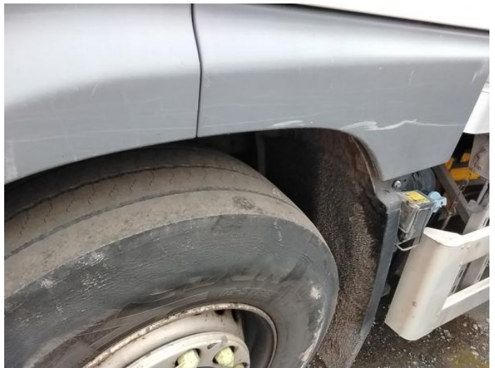
6: Qtr Panel Moulding ns Scuffed (Unpainted) Over 100mm