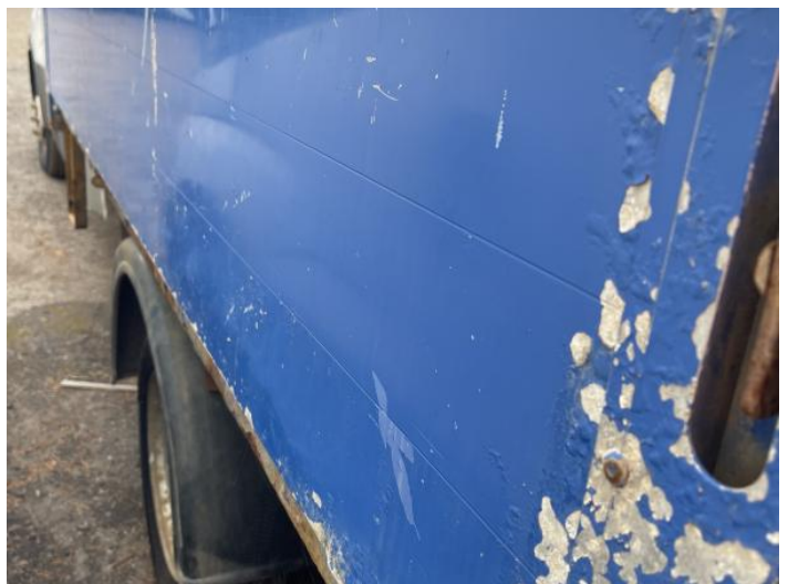
8: Qtr Panel nsr Dented With Paint Damage