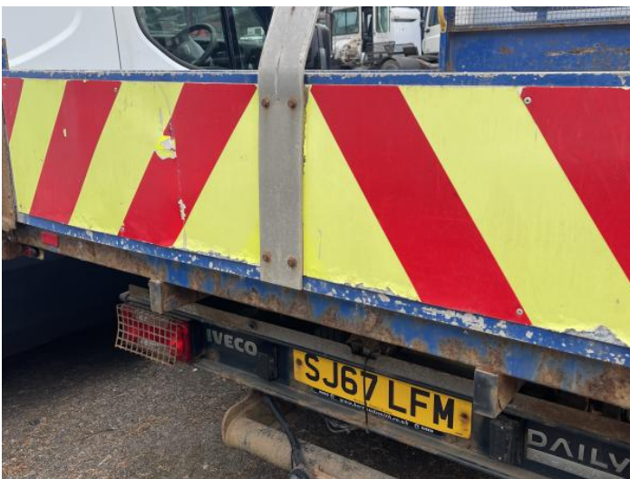
7: Tailgate Dented With Paint Damage