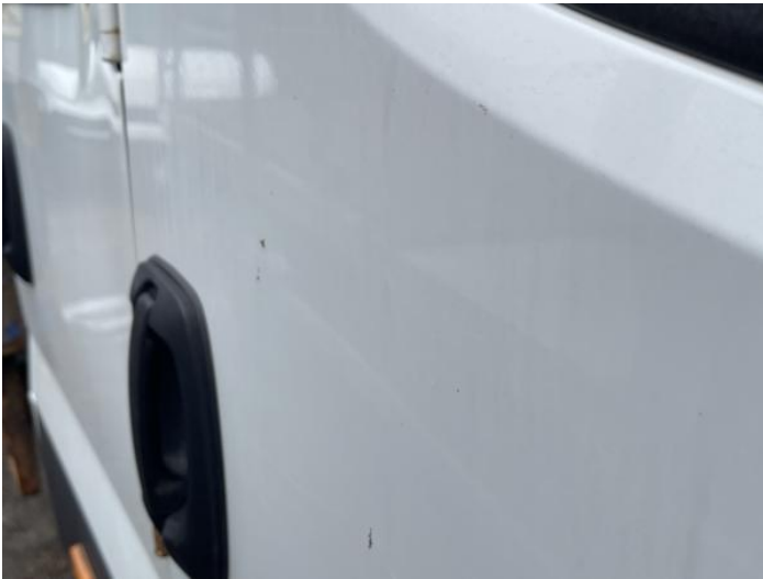
5: Door osf Dented Over 30mm