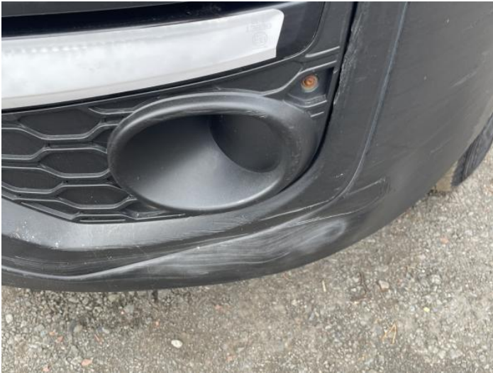
3: Bumper Front Moulding Scuffed (Unpainted) Over 100mm