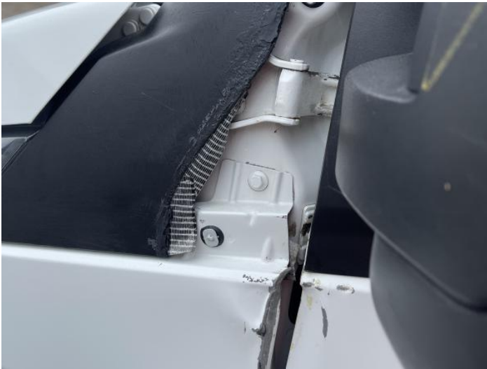
11: Door Mirror Assy nsf Broken Replace