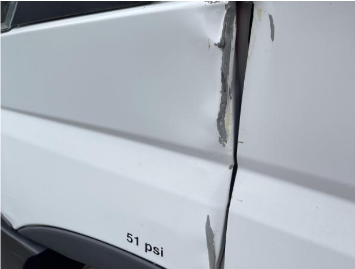
10: Wing nsf Dented With Paint Damage