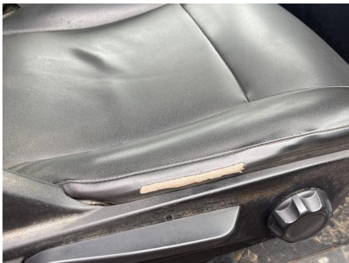
1: Seat Base Cover osf Torn Over 3mm