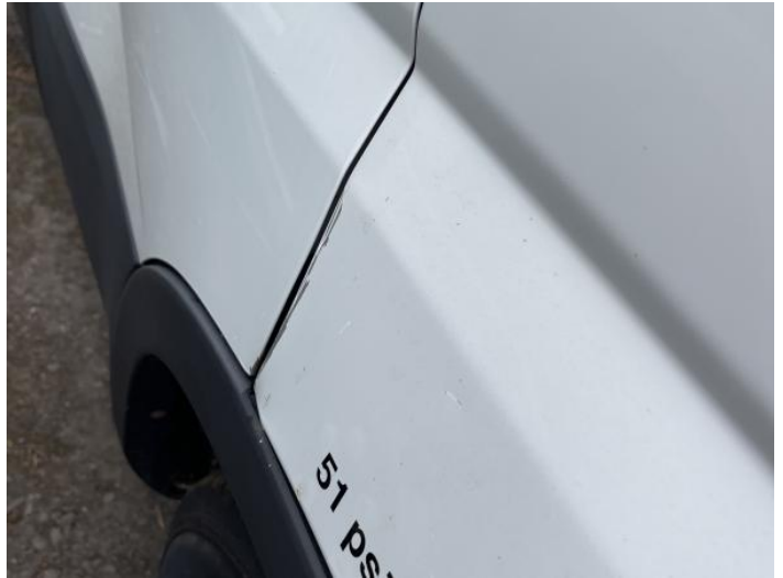
4: Wing osf Dented Over 30mm