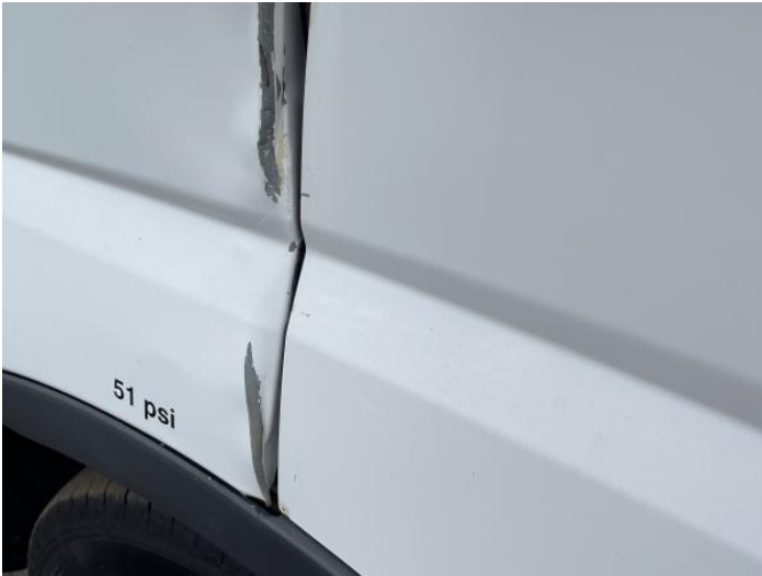
9: Door nsf Dented Over 30mm