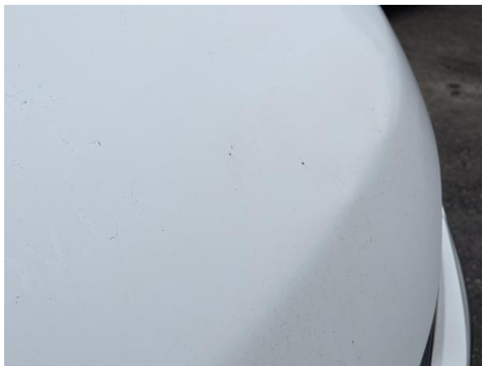
2: Bonnet Dented With Paint Damage