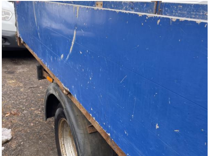
6: Qtr Panel osr Dented With Paint Damage